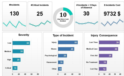
Health & Safety KPI Dashboard Showing Incidents ...

This graph/chart is linked to excel, and changes automatically based on data. Just left click on it and select "Edit Data".