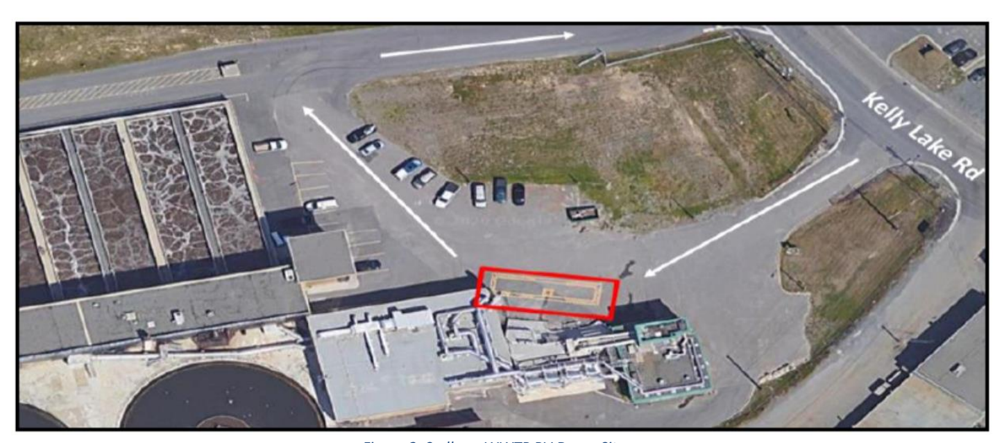
Figure 2: Sudbury WWTP RV Dump Site