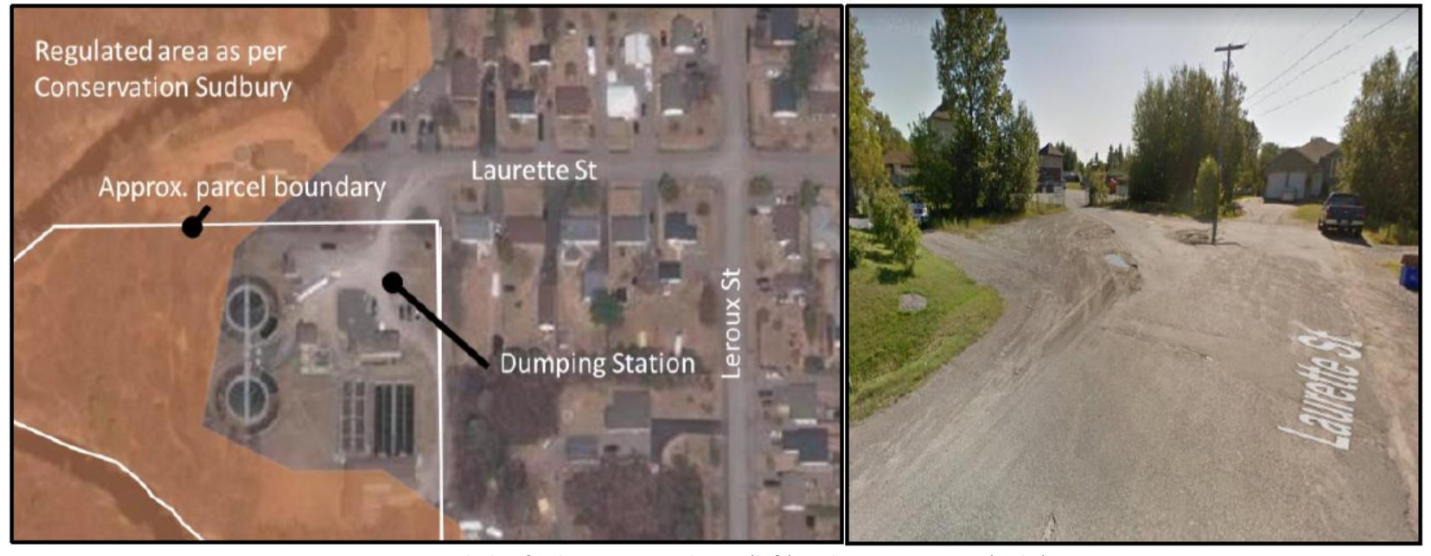
Figure 1: Chelmsford WPCP Boundaries (left) and Entrance View (right)