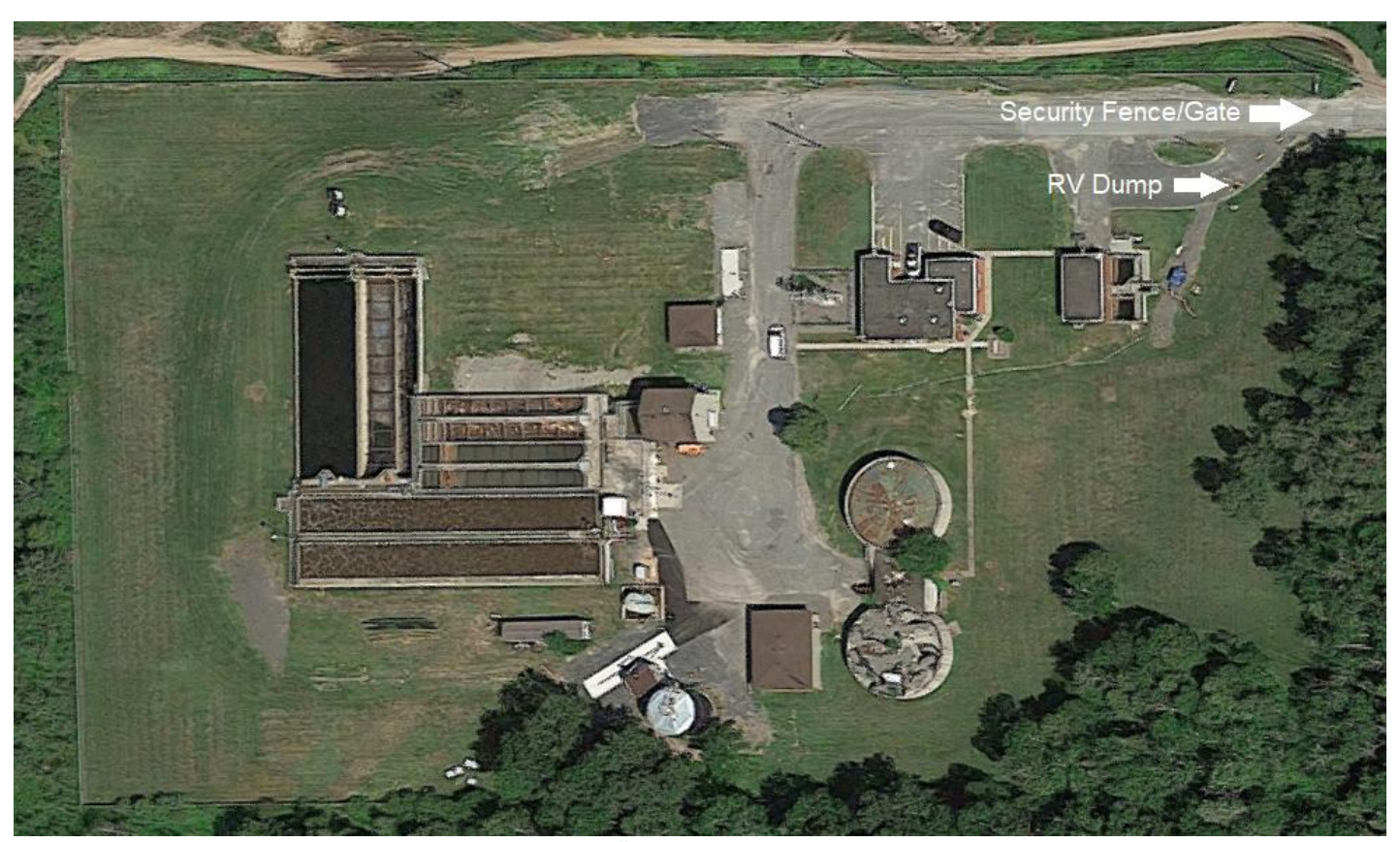
Figure 3: Valley East WWTP RV Dump Site