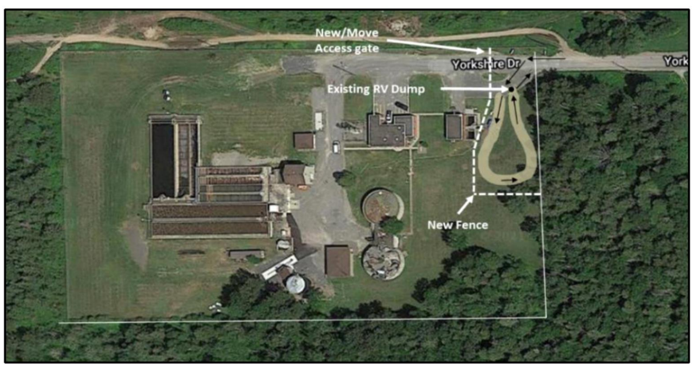
Figure 5: Valley East WWTP RV Dump Site Conceptual Design