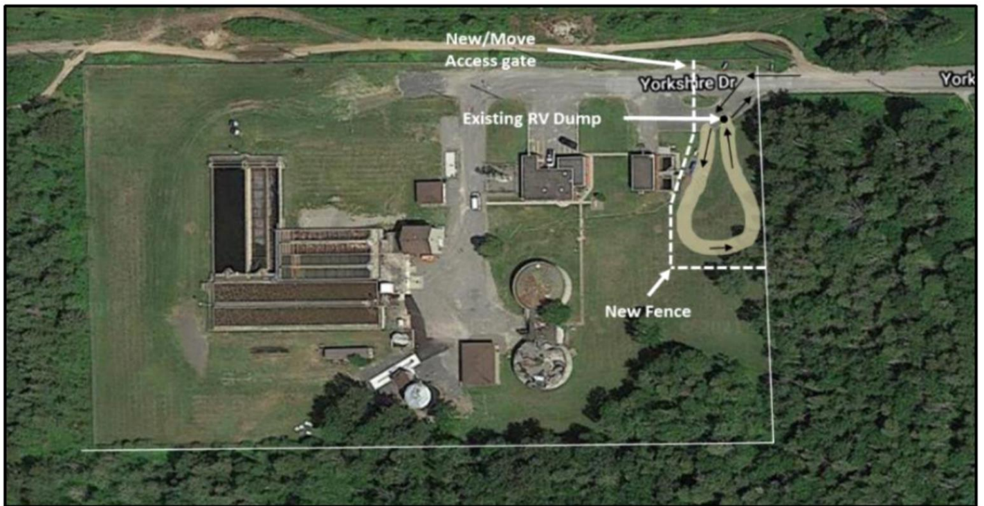
Figure 5: Valley East WWTP RV Dump Site Conceptual Design