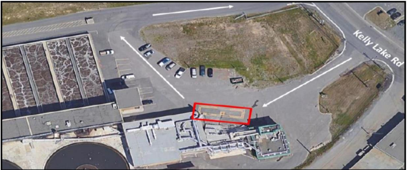
Figure 2: Sudbury WWTP RV Dump Site