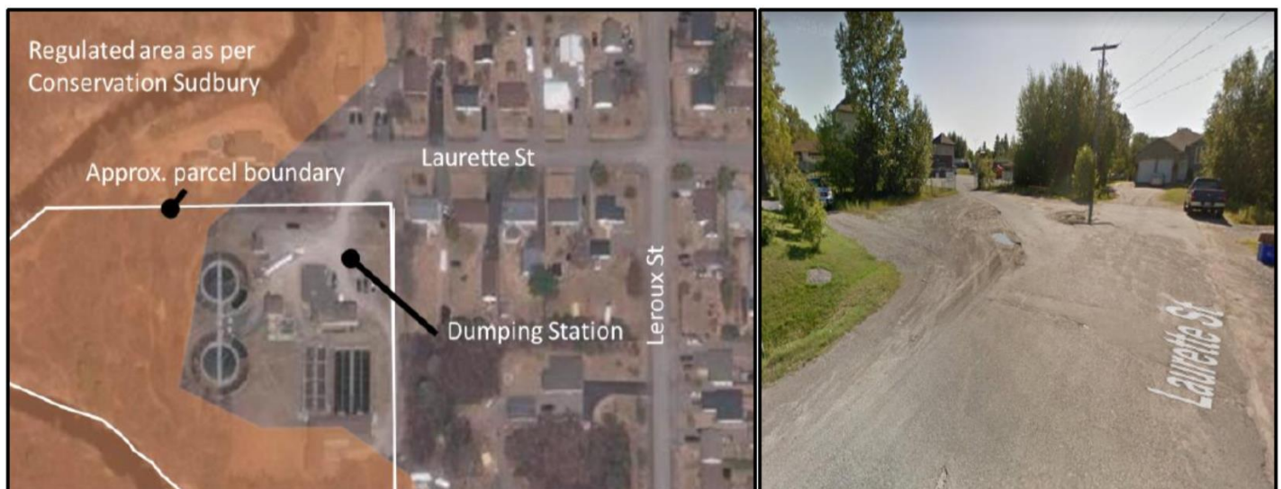
Figure 1: Chelmsford WPCP Boundaries (left) and Entrance View (right)