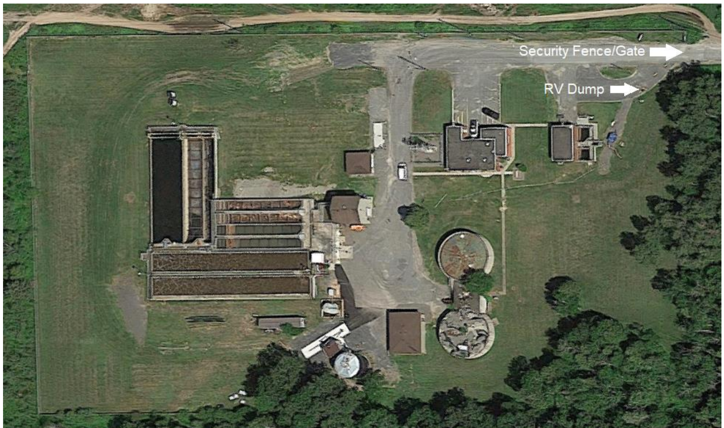
Figure 3: Valley East WWTP RV Dump Site