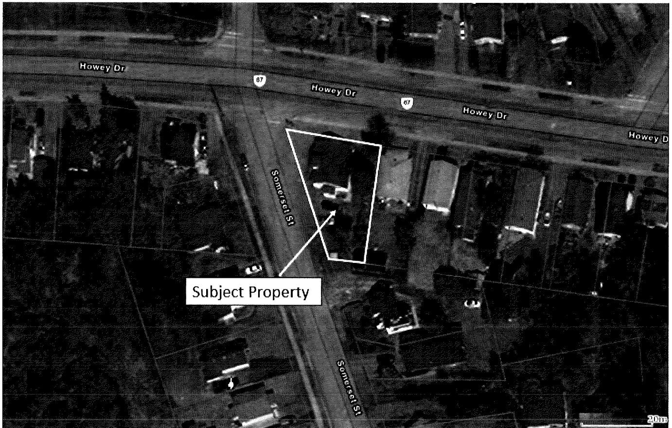
Figure 1: Aerial Image of Subject Property Lands

The property is an irregular shaped parcel that is 519.48 m 2 , which includes an existing three-unit multiple dwelling residential building. The surrounding area consist of a range of residential uses. The lots to the south are zoned Low Density Residential One (R1-5) comprised of predominantly single detached residential uses. The lands to the north, east and west are predominantly zoned Residential Second Density Two (R2-2) and consist mainly of single and semi detached residential uses. The lot immediately to the east is zoned C1, and appears to be used for residential purposes. The existing multiple dwelling residence conforms to the predominant low and medium density residential uses in the area (see Figure 2, extract from CGS Interactive Zoning Map).