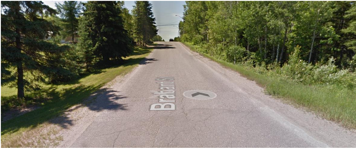
Figure 2: Brabant Street - Looking southbound near north limits of recommended parking restrictions