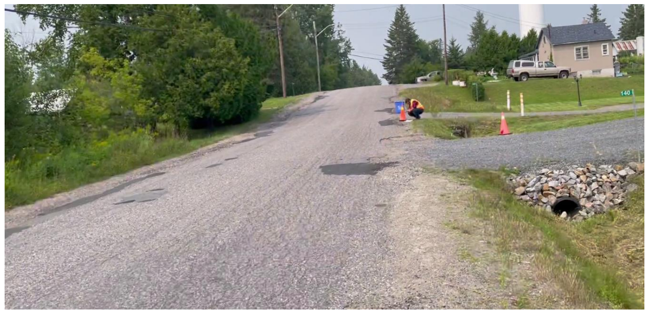
Figure 3: Brabant Street – Looking northbound at 140 Brabant Street

Near the mid-point of the road there is a steep hill which residents were concerned affected their ability to see vehicles over the hill. Staff conducted a sight line review of the area and found that the sight lines were in fact deficient in the area of concern. Staff also reviewed the collision history from January 2008 to August 2021 and did not find any reported collisions in the area.