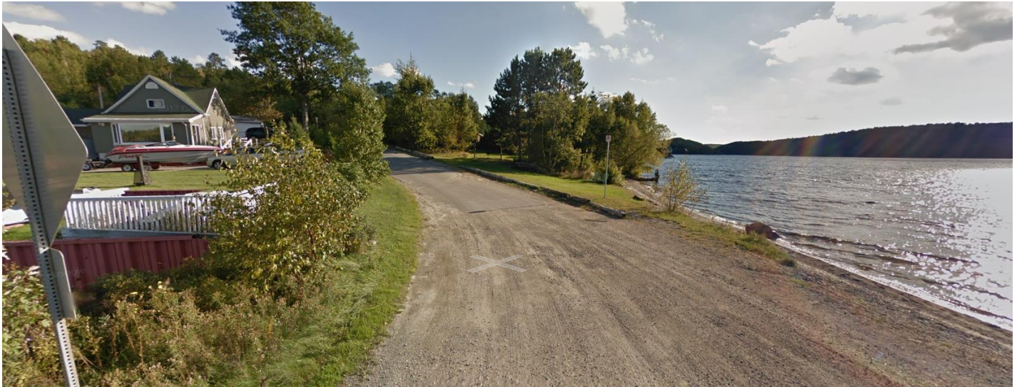
Figure 3: Poupore Road West Turnaround – Facing South

The City had previously taken steps to address parking concerns related to the unofficial boat launch. In 2011, residents of Delores Street expressed concerns with users of the unofficial public boat launch parking their vehicles and trailers on Delores Street while using their boats on Lake Wanapitei. With vehicles parked on both sides of the road, it was difficult for residents and emergency vehicles to access the homes on Delores Street. As a result of these concerns, parking was restricted on the entire length of Delores Street.