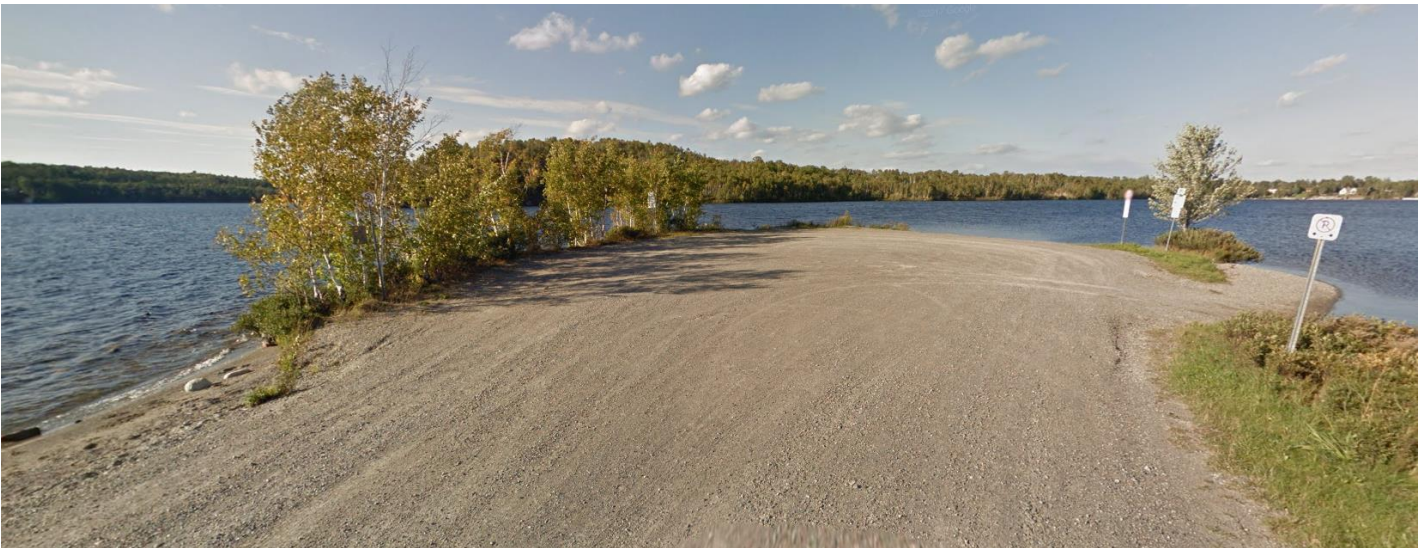
Figure 2: Poupore Road West Turnaround – Facing North