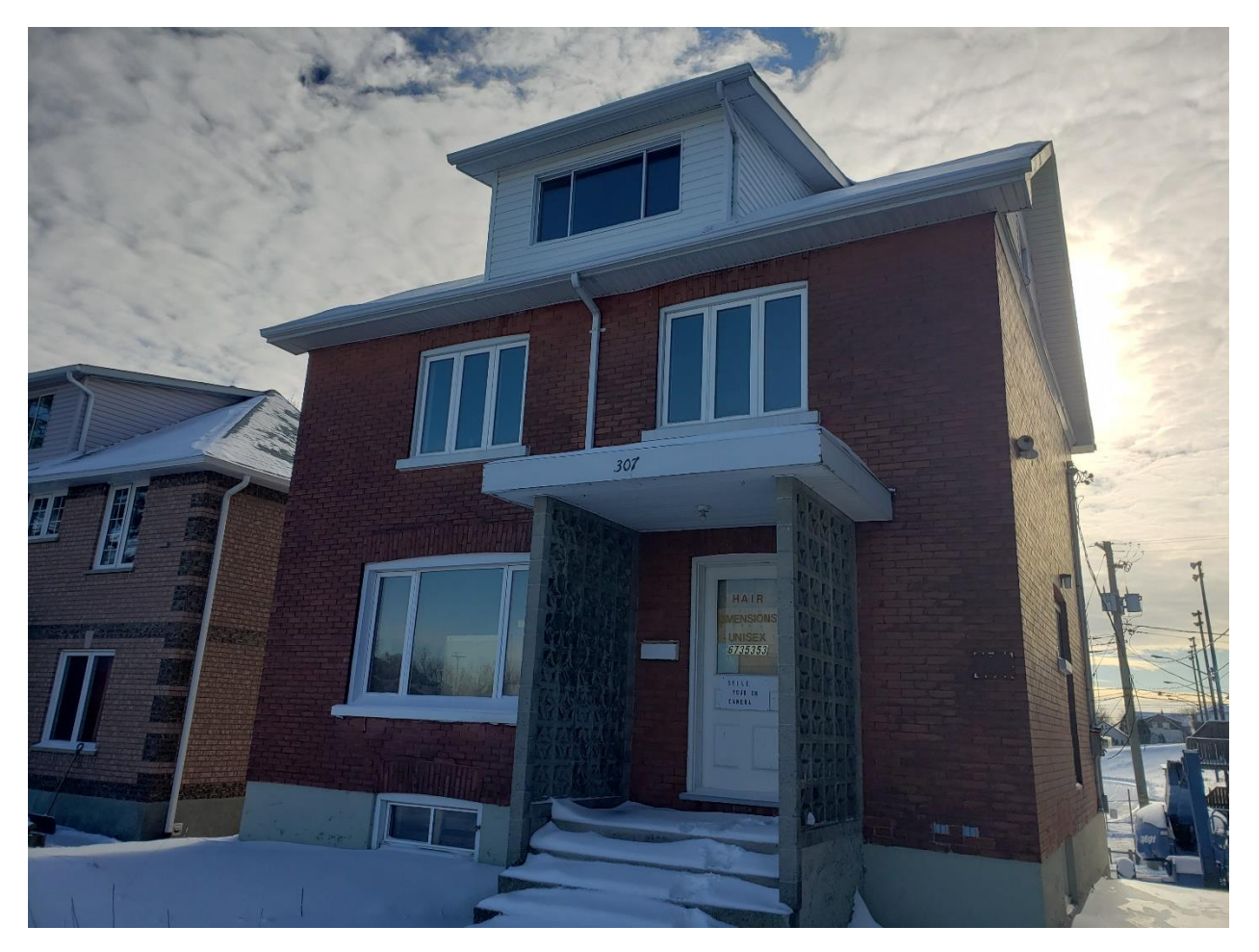
Photo 1: 307 Elm Street, Sudbury View of north-facing elevation Photo Supplied.