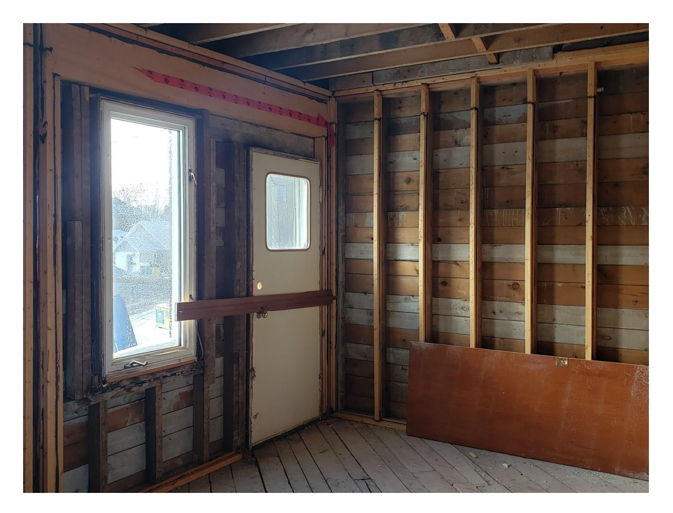
Photo 3: 307 Elm Street, Sudbury View of main level interior