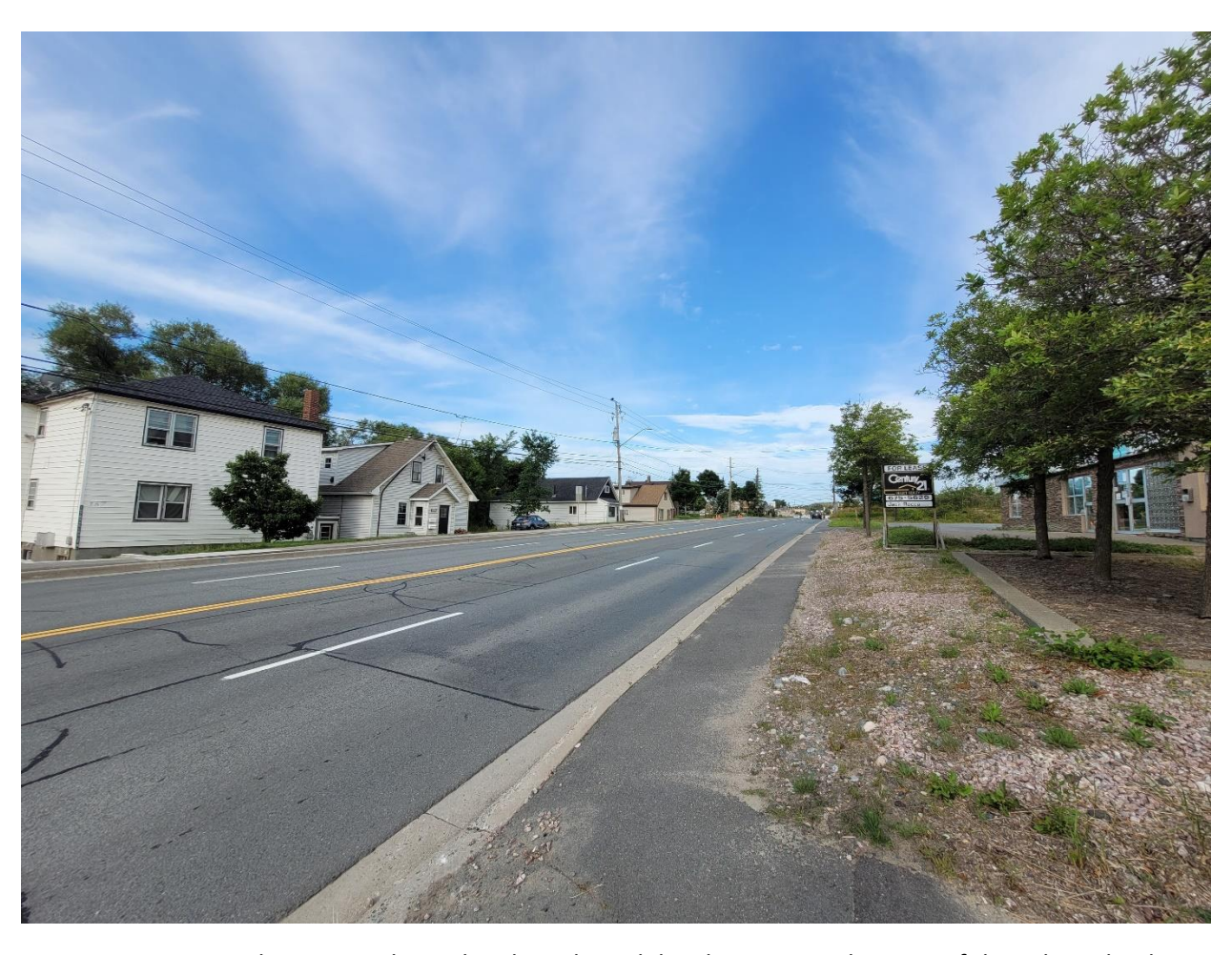
PHOTO #2 – Existing business industrial and residential development to the west of the subject lands.