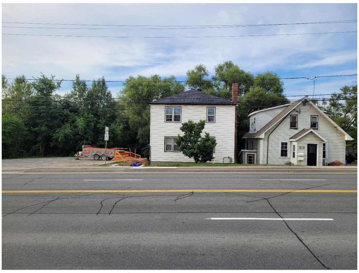
PHOTO #1 – Subject lands as viewed from Douglas Street West. The photo shows the existing legal non-conforming multiple unit building with it's associated parking lot, as well as the adjacent development.