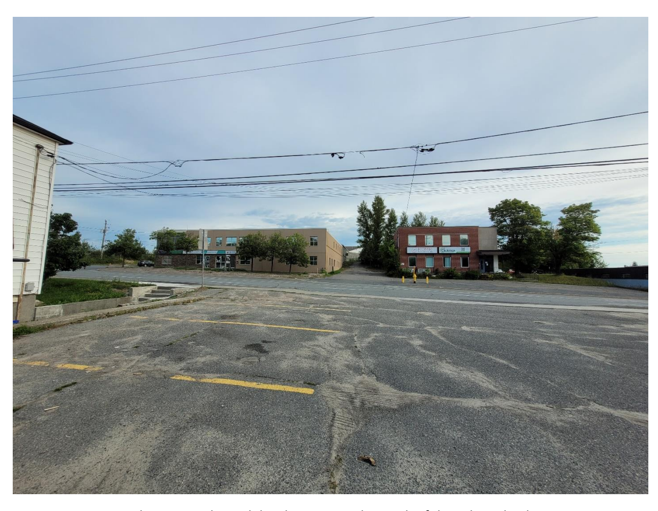
PHOTO #3 – Existing business industrial development to the north of the subject lands.