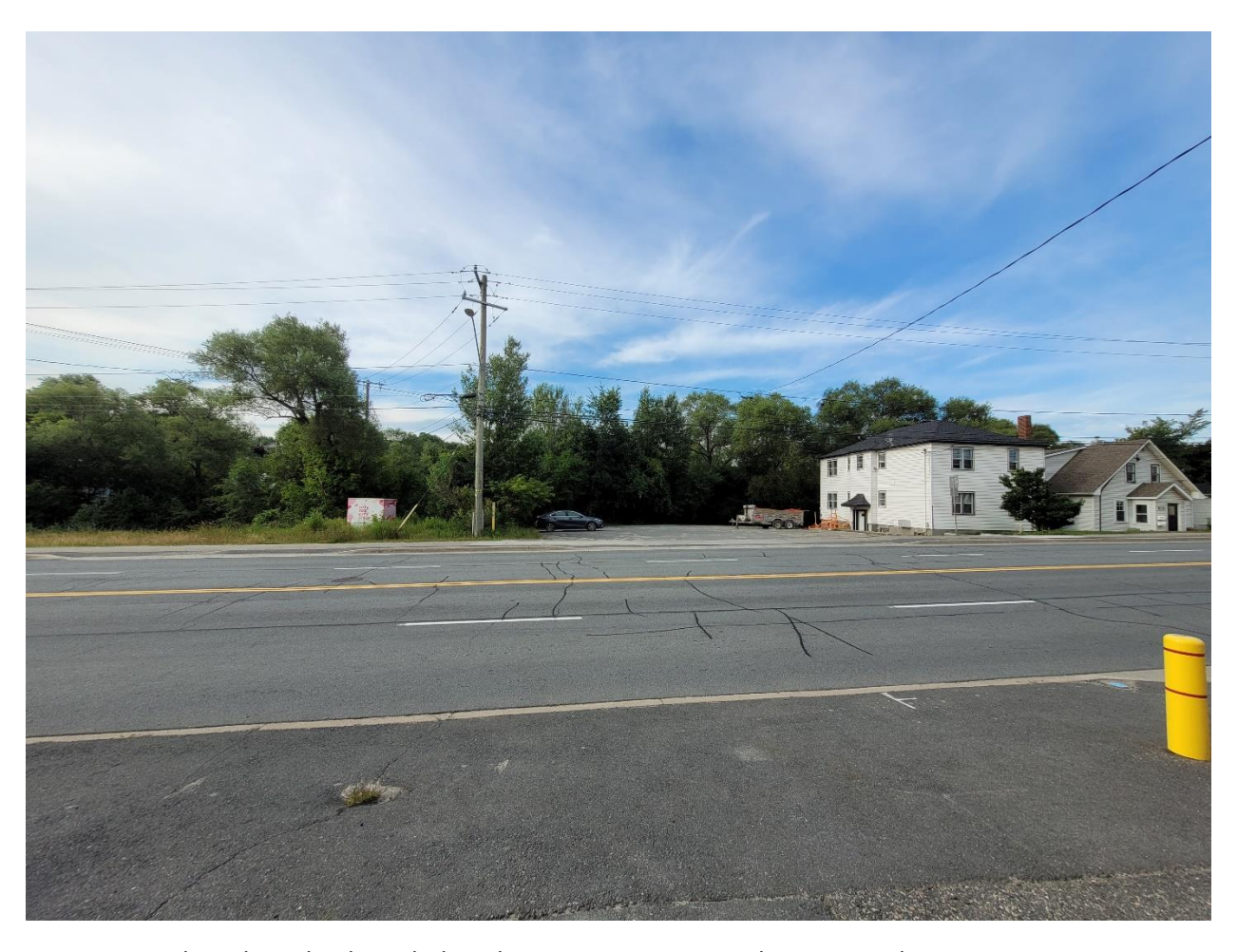
PHOTO #5 – The subject lands, including the mature vegetation that surrounds.