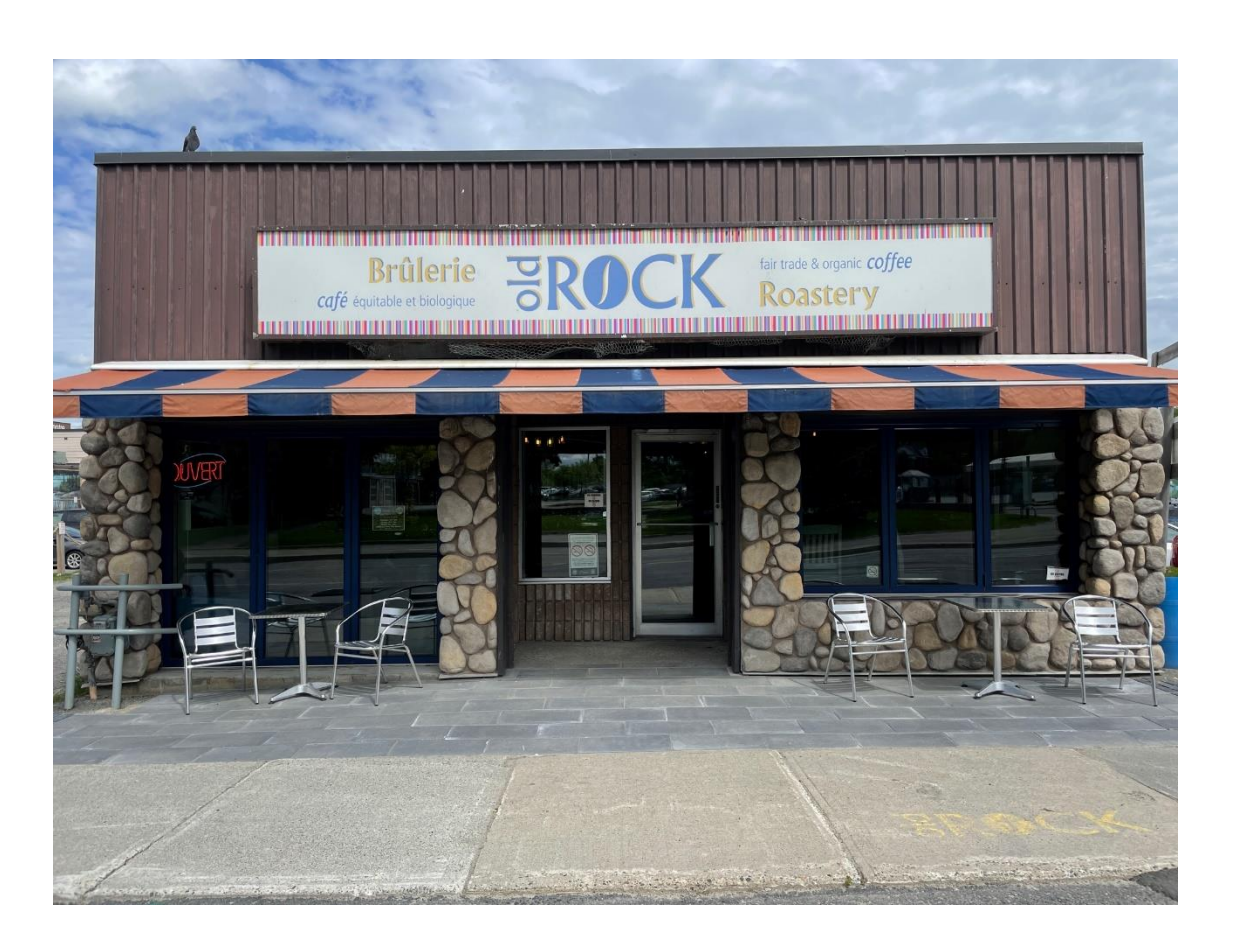
Photo 2: 212 Minto Street, Sudbury View of existing west-facing elevation