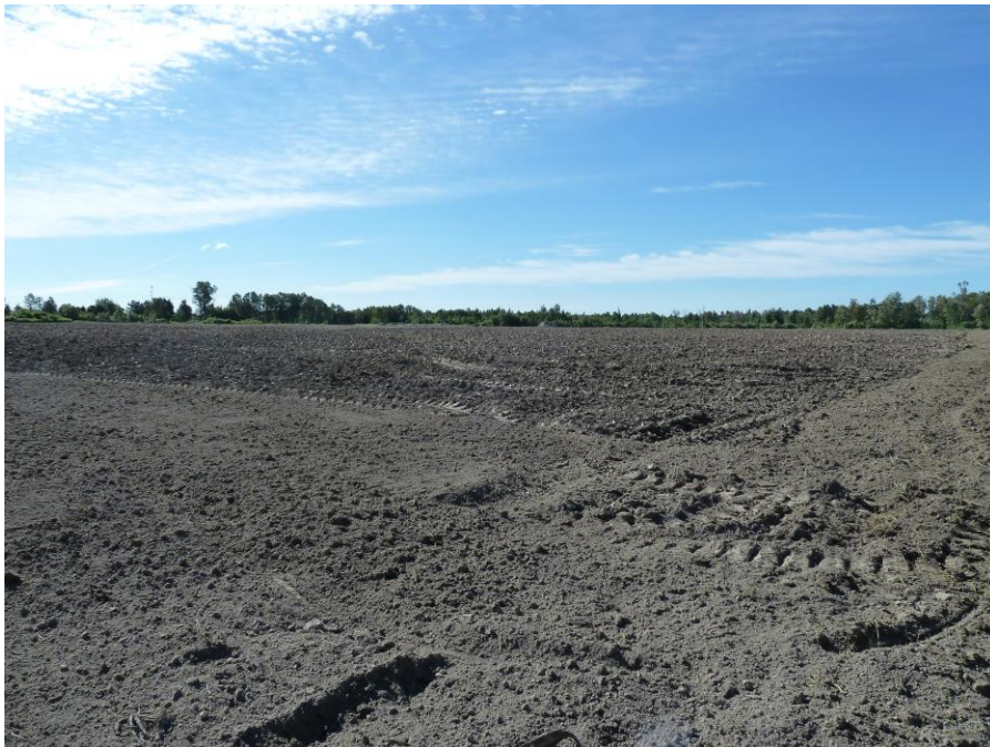
Photo 2: Errington Avenue, Chelmsford View of subject land facing southeast in vicinity of Lot 31 Files 751-5/22-001 & 780-5/12005 Photography: July 8, 2022