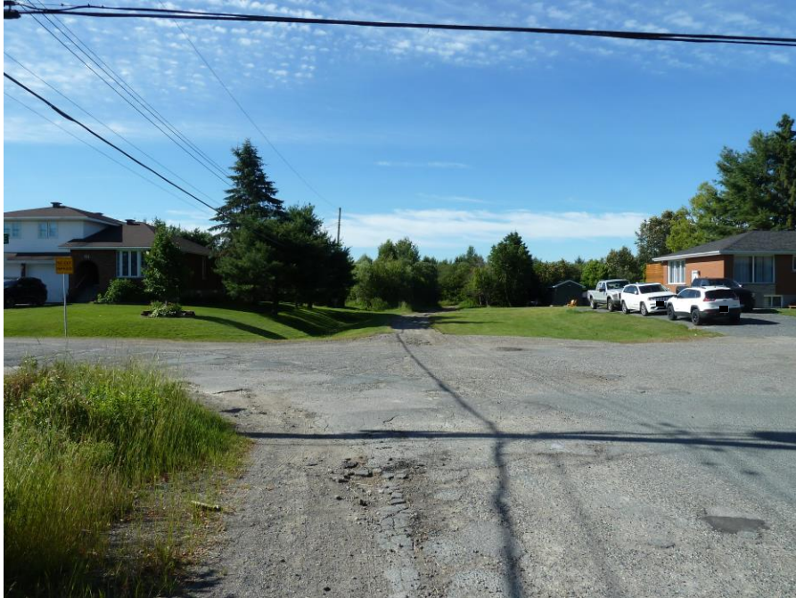
Photo 1: Isidore Street, Chelmsford View of Isidore Street unopened road allowance facing south Files 751-5/22-001 & 780-5/12005 Photography: July 8, 2022