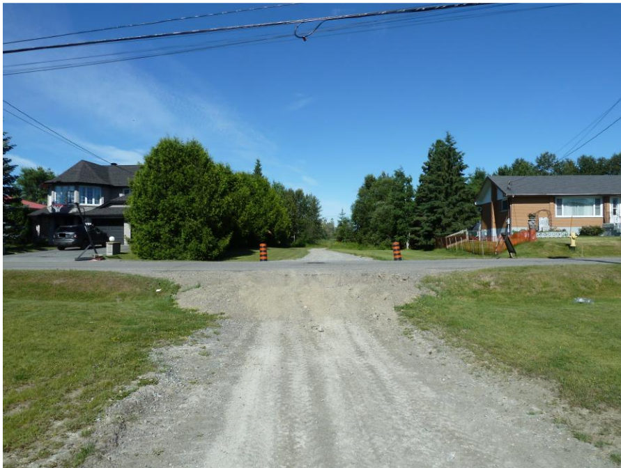
Photo 6: Errington Avenue, Chelmsford View of proposed southerly access on Errington Avenue facing west Files 751-5/22-001 & 780-5/12005 Photography: July 8, 2022