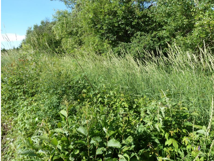
Photo 3: Laurette Street, Chelmsford Whitson River Tributary III along westerly limit of subject land abutting 115 Laurette Street Files 751-5/22-001 & 780-5/12005 Photography: July 8, 2022