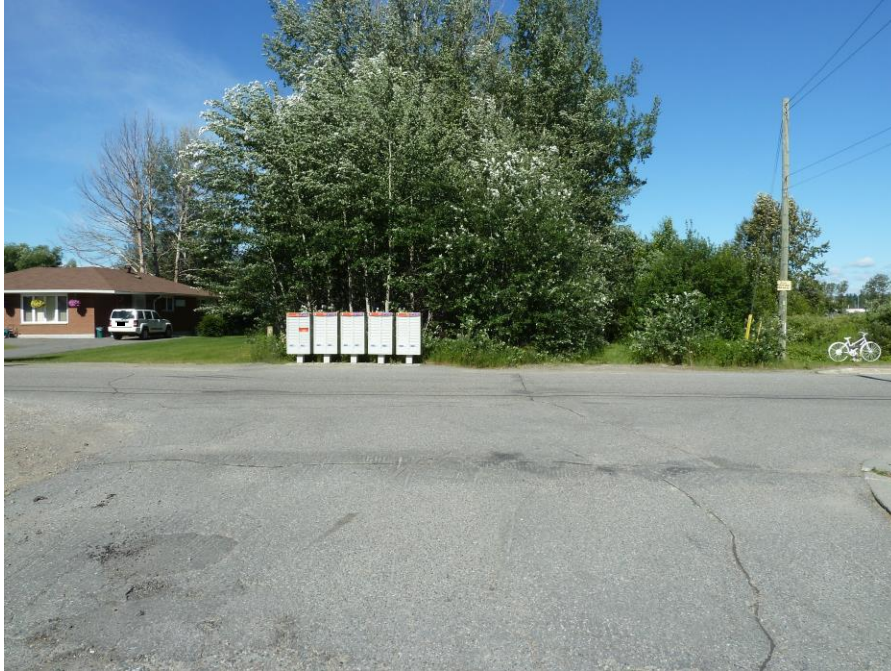
Photo 5: Mainville Street, Chelmsford Proposed Mainville Street access at Errington Avenue Files 751-5/22-001 & 780-5/12005 Photography: July 8, 2022