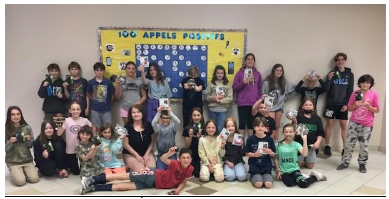
Figure 1 Students from École Catholique Sainte-Marie showing their prizes

To kick off Bike Month, during the week of May 30 to June 3, students and staff from various schools were challenged to bike or scoot to school as many days as they could and add up the kilometres and see how far their school can travel in a week!