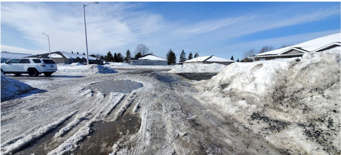
Figure 3: Intersection of Edna Street at St. Albert Street (On Edna St. looking westbound at the intersection)

Uncontrolled intersections have no stop or yield signs and operate under the “Right of Way Rule.” Under this rule, when vehicles approach the intersection at the same time the driver on the left yields right of way to the vehicle on the right. Uncontrolled intersections are becoming less common in urban areas as unnecessary conflicts may be created.