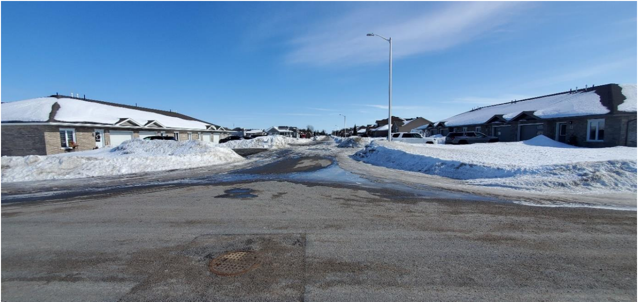
Figure 2: Intersection of St. Albert Street at Edna Street (On St. Albert St. looking eastbound, down Edna St.)

As a result, an uncontrolled “T” intersection has been created as shown in Figures 2 and 3 below.