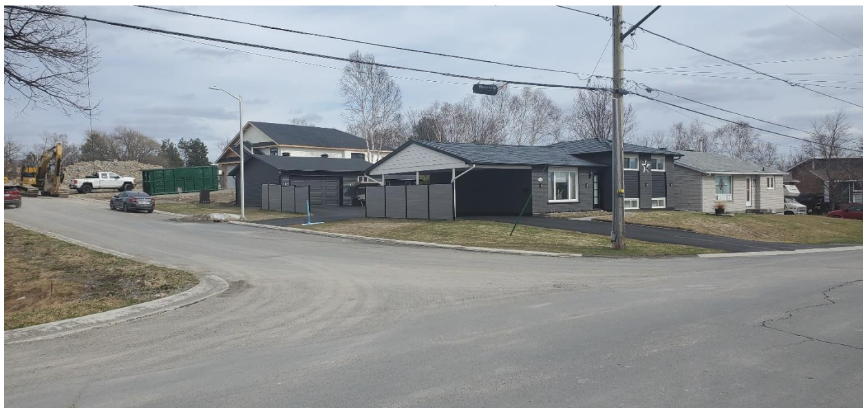
Figure 2: Intersection of Estelle Street and Eclipse Crescent

As a result, an uncontrolled "T" intersection has been created as shown in Figures 2 and 3 below.