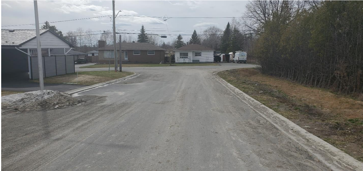
Figure 3: Eclipse Crescent looking west towards Estelle Street

Uncontrolled intersections have no stop or yield signs and operate under the “Right of Way Rule.” Under this rule, when vehicles approach the intersection at the same time the driver on the left yields right of way to the vehicle on the right. Uncontrolled intersections are becoming less common in urban areas as unnecessary conflicts may be created.