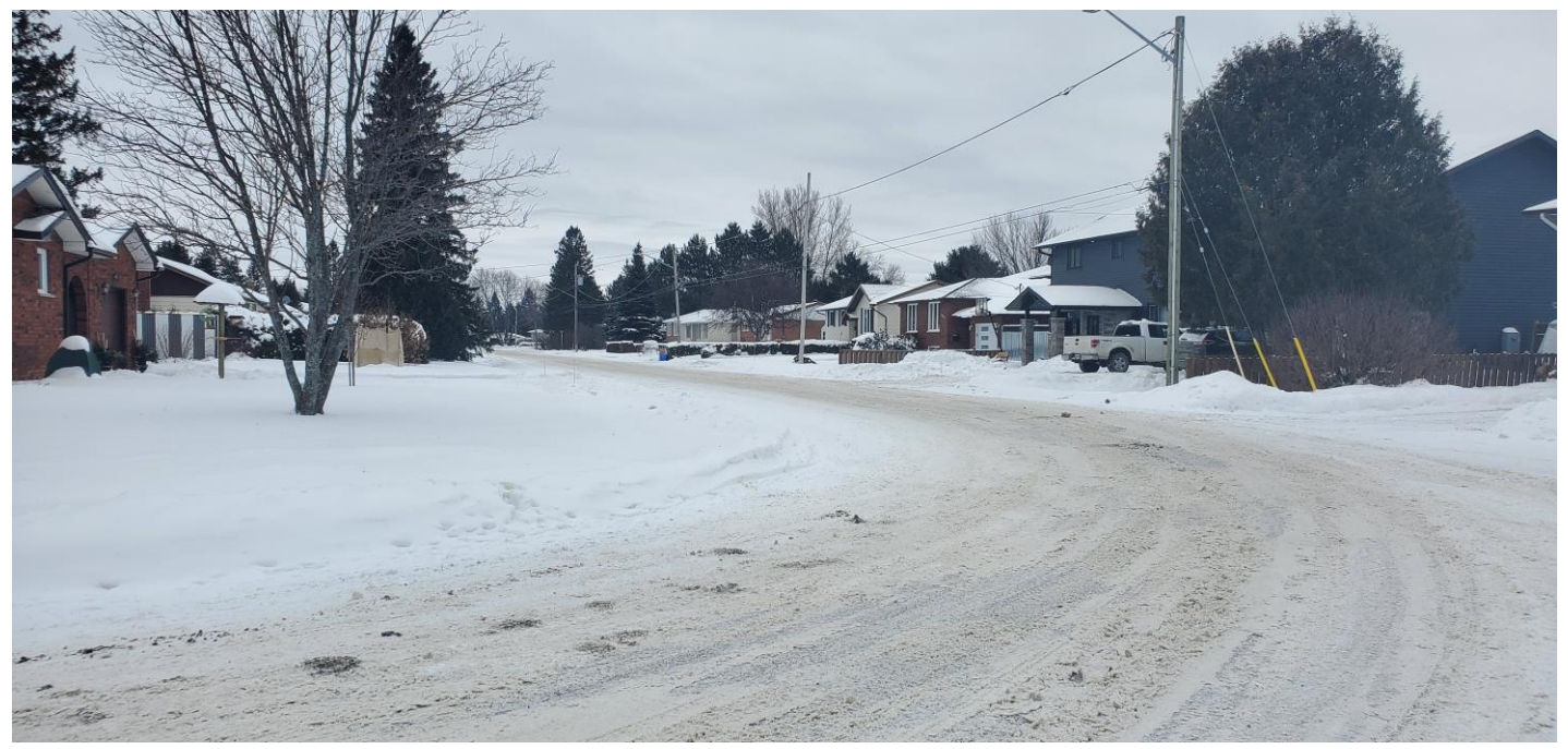
Figure 2: Intersection of Labelle Street and Noel Street looking south