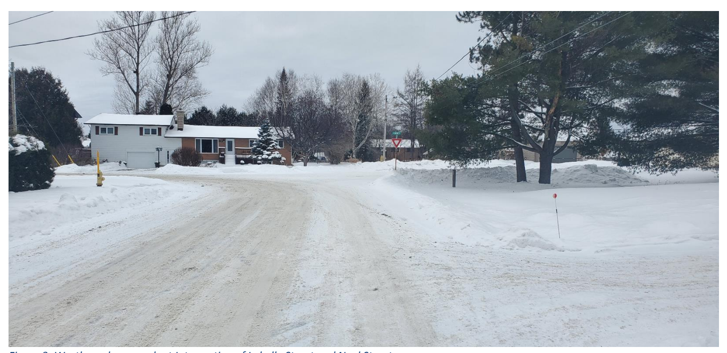
Figure 3: Westbound approach at Intersection of Labelle Street and Noel Street