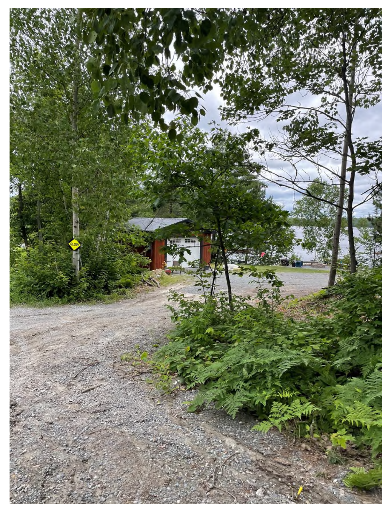
Photo 1. Existing driveway and accessory building. Photo taken June 30<sup>th</sup>, 2024. CGS file 751-3/24-02.