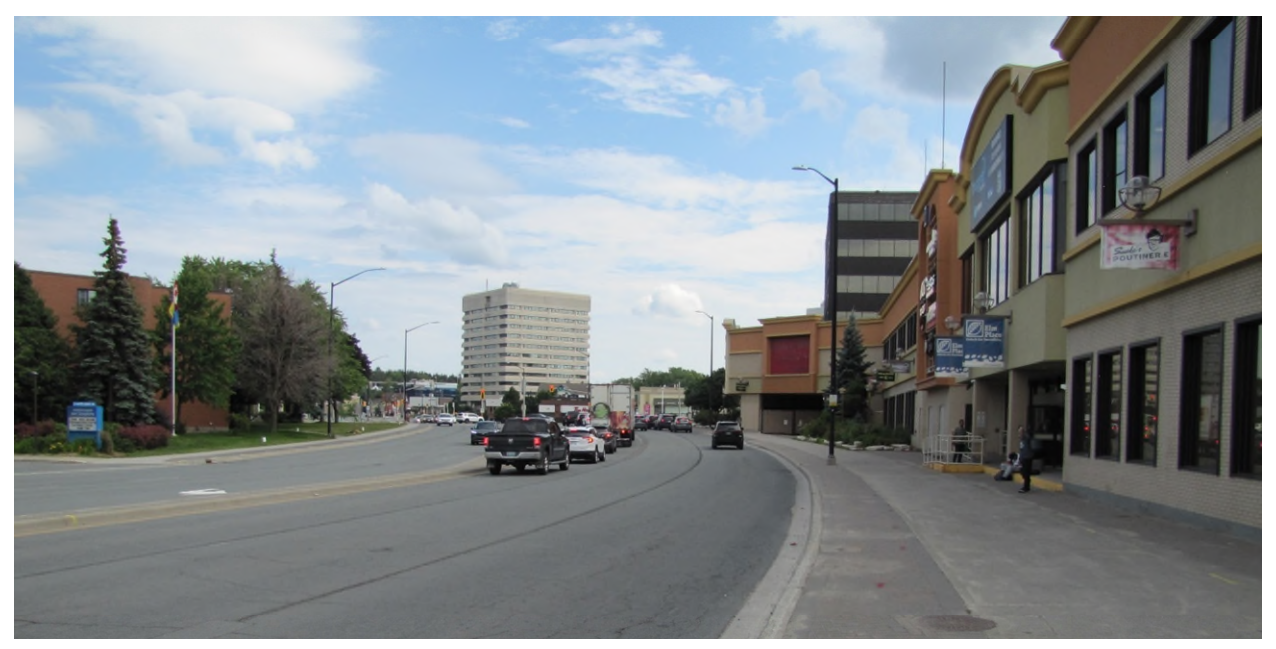
Photo 6. Subject lands at 40 Elm Street showing the east side of the existing building along Notre Dame Avenue, facing south. Photo taken July 8, 2024. CGS File 701-6/24-05 & 751-6/24-08.