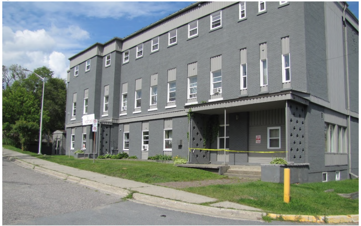
Photo 8. Adjacent residential use to the northwest of the subject lands, facing northeast. Photo taken July 8, 2024. CGS File 701-6/24-05 & 751-6/24-08.