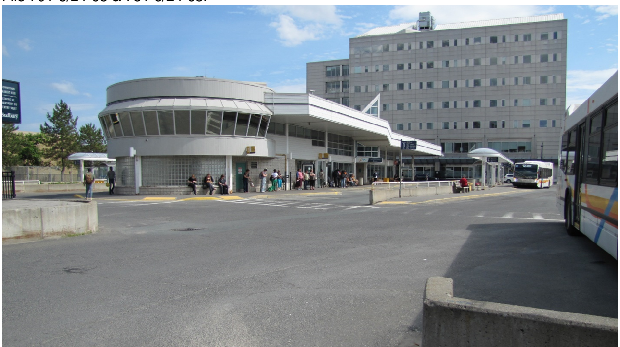
Photo 11. Transit terminal to the south of the subject lands, on the south side of Elm Street, facing south. Photo taken July 8, 2024. CGS File 701-6/24-05 & 751-6/24-08.