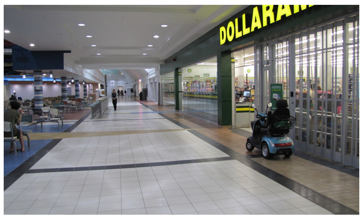
Photo 12. Indoor commercial concourse (photo 1 of 3). Photo taken July 8, 2024. CGS File 701-6/24-05 & 751-6/24-08.