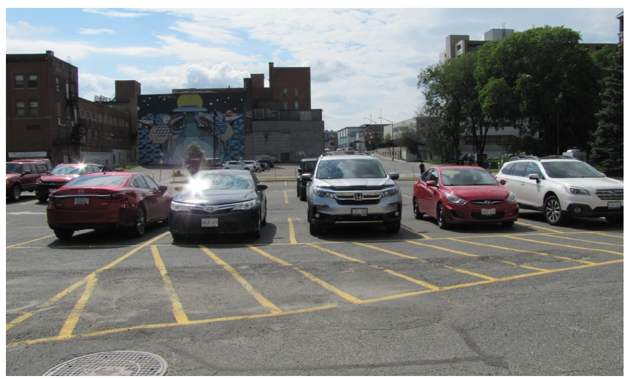
Photo 10. Parking area on the west side of the subject lands, showing Durham Street and commercial use to the west of the subject lands, facing west. Photo taken July 8, 2024. CGS File 701-6/24-05 & 751-6/24-08.