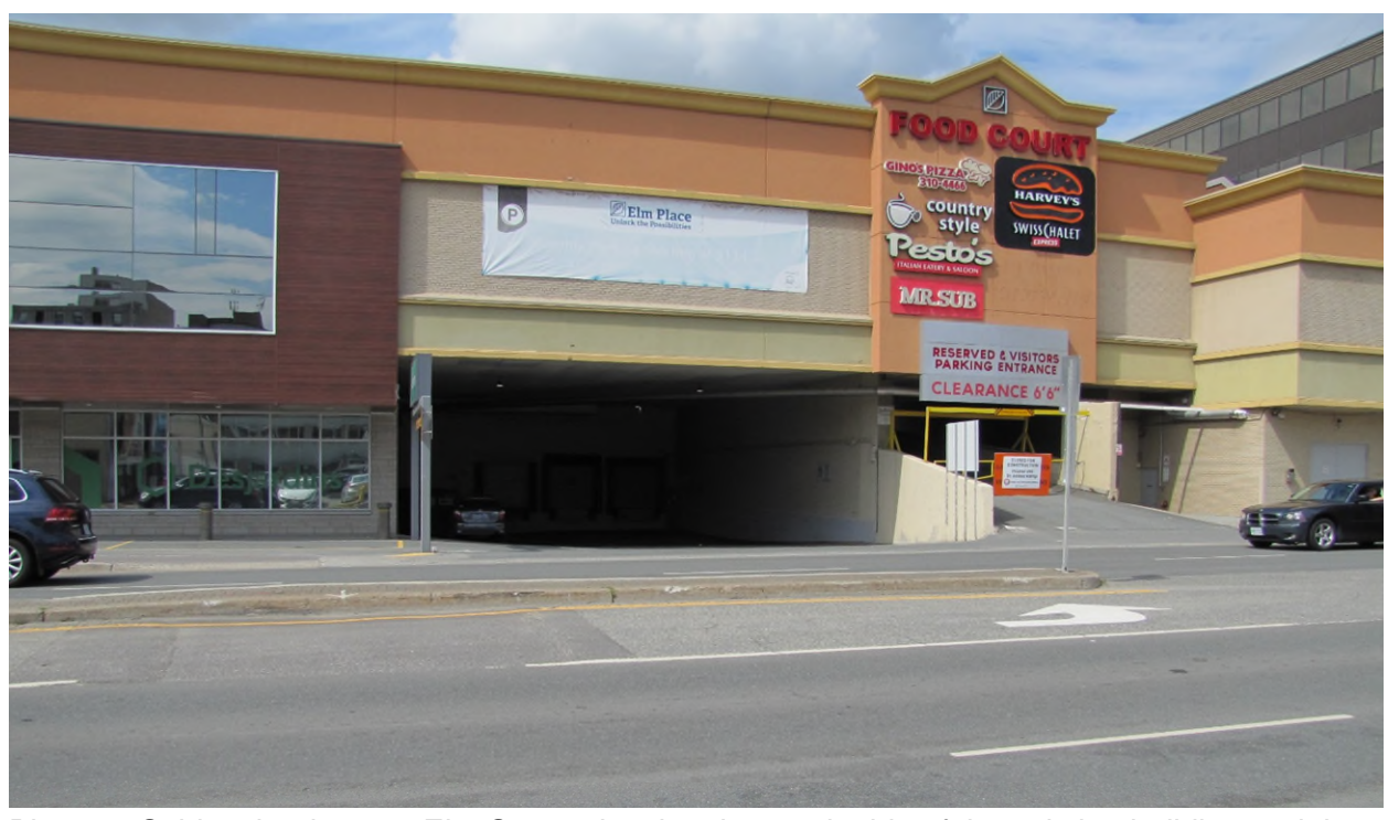
Photo 2. Subject lands at 40 Elm Street showing the south side of the existing building and the loading dock extending from Elm Street, facing north. Photo taken July 8, 2024. CGS File 701-6/24-05 & 751-6/24-08.