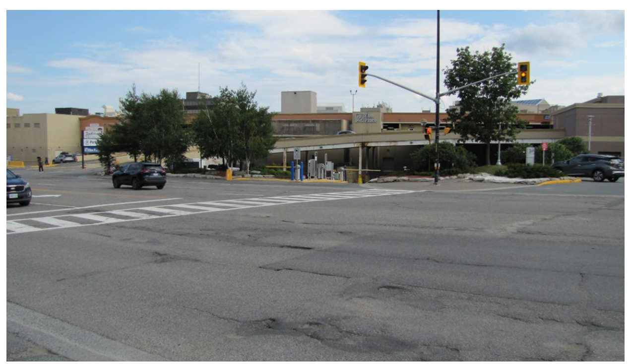
Photo 5. Subject lands at 40 Elm Street showing the north side of the existing building and the loading dock extending from Ste. Anne Road, facing south. Photo taken July 8, 2024. CGS File 701-6/24-05 & 751-6/24-08.