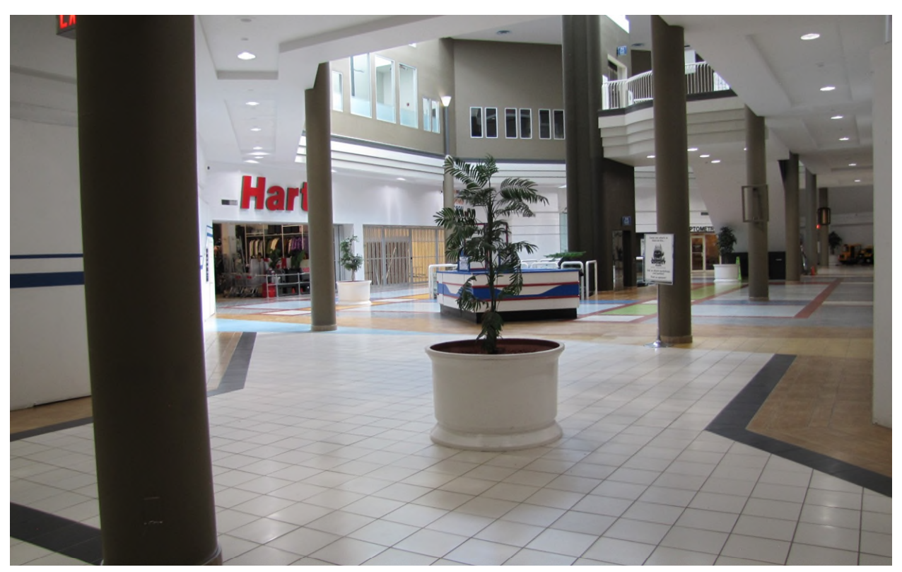
Photo 13. Indoor commercial concourse (photo 2 of 3). Photo taken July 8, 2024. CGS File 701-6/24-05 & 751-6/24-08.