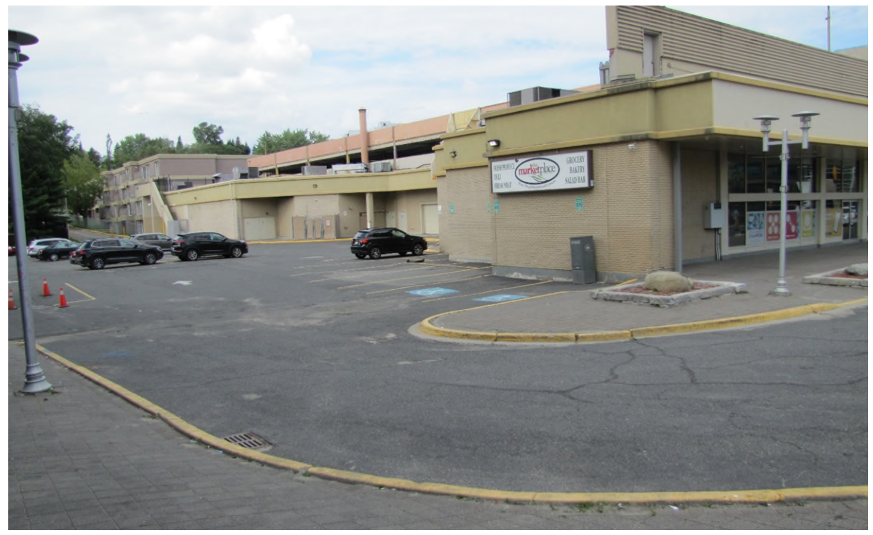
Photo 4. Subject lands at 40 Elm Street showing the driveway extending from Elm Street and parking area on the west side of the building, facing northeast. Photo taken July 8, 2024. CGS File 701-6/24-05 & 751-6/24-08.