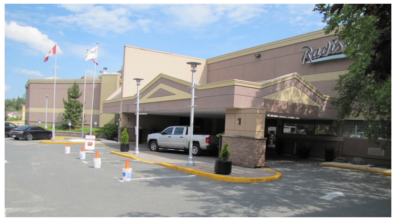
Photo 7. Adjacent hotel use to the northwest of the subject lands, facing east. Photo taken July 8, 2024. CGS File 701-6/24-05 & 751-6/24-08.