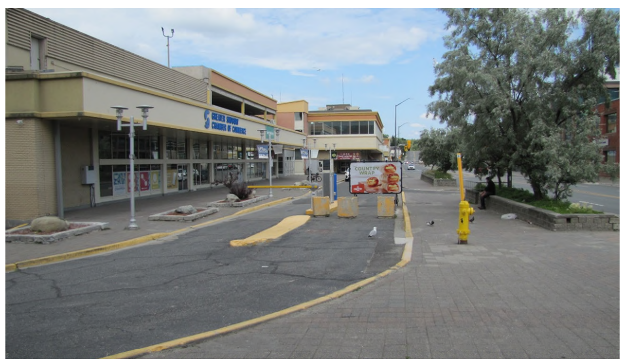
Photo 3. Subject lands at 40 Elm Street showing the driveway extending from Elm Street and south side of the existing building, facing east. Photo taken July 8, 2024. CGS File 701-6/24-05 & 751-6/24-08.