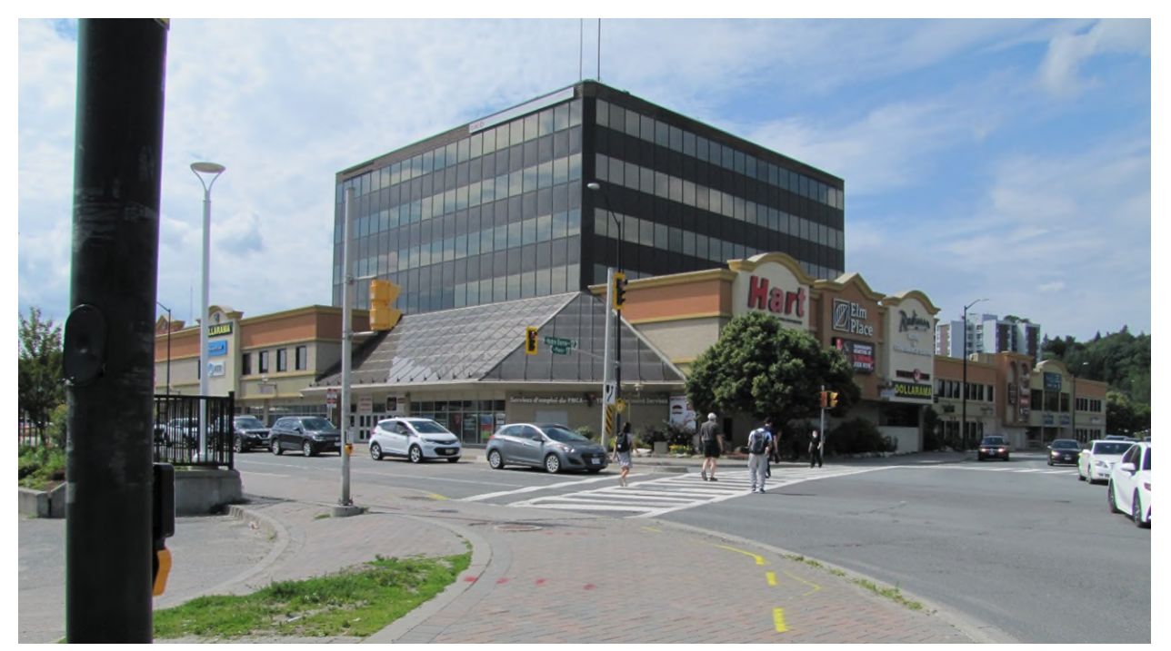
Photo 1. Intersection of Elm Street and Notre Dame Avenue, showing the subject lands at 40 Elm Street which excludes the corner with the office tower, facing northwest. Photo taken July 8, 2024. CGS File 701-6/24-05 & 751-6/24-08.