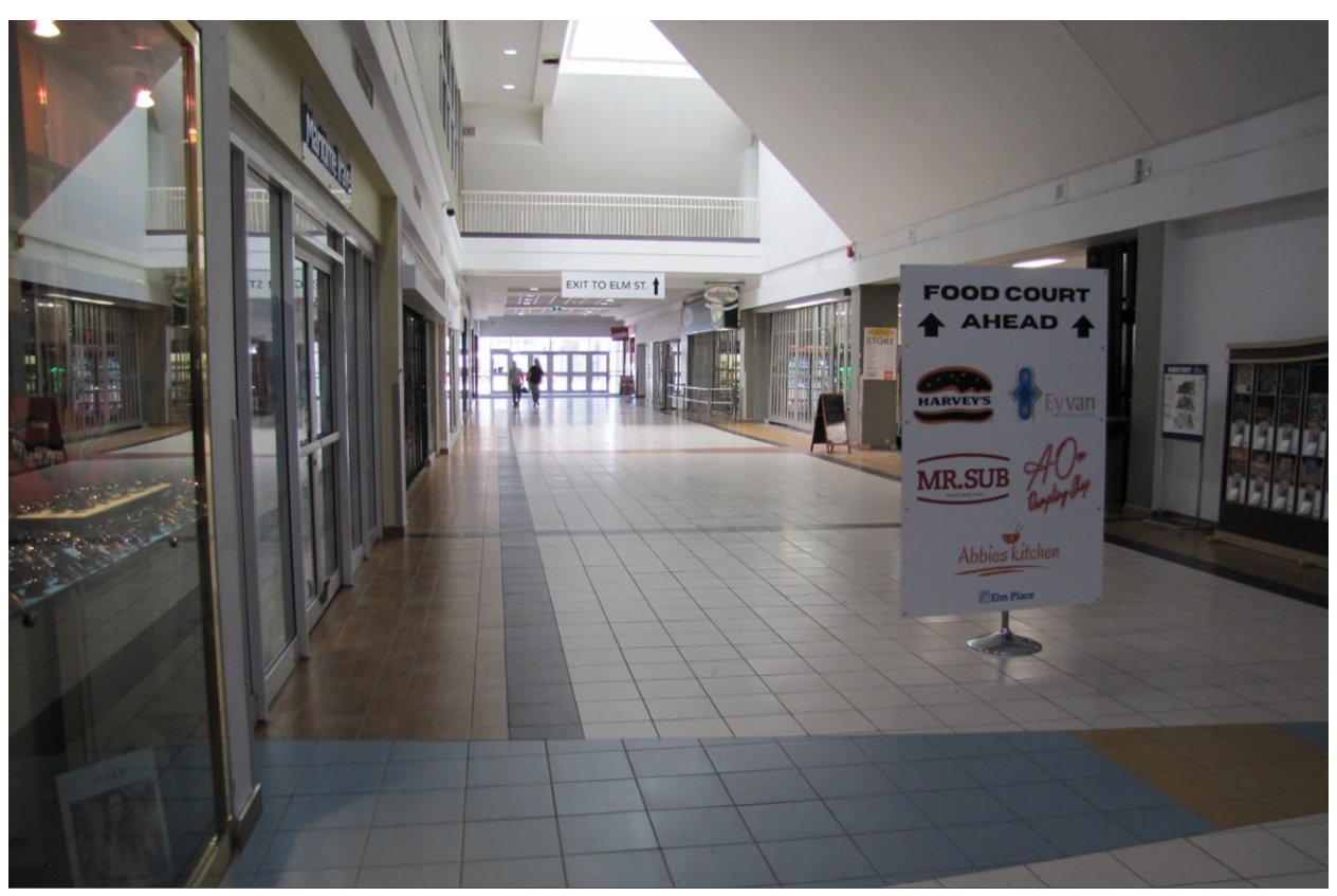
Photo 14. Indoor commercial concourse (photo 3 of 3). Photo taken July 8, 2024. CGS File 701-6/24-05 & 751-6/24-08.