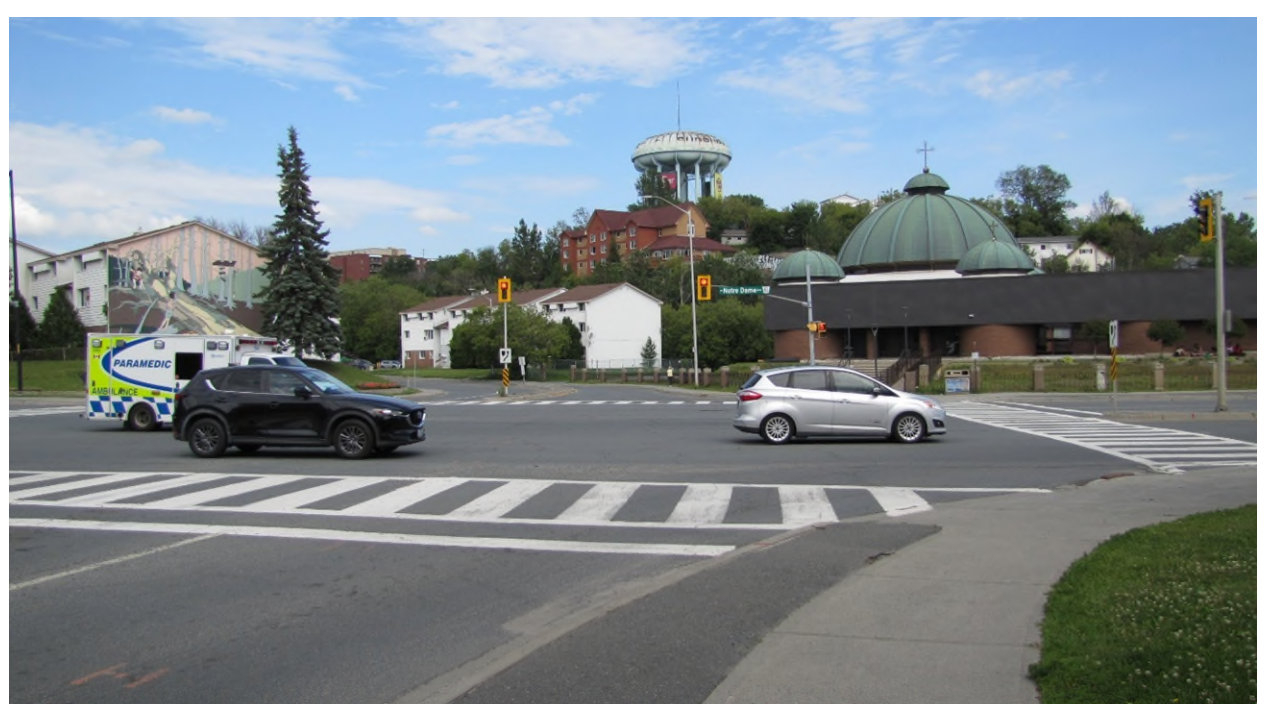
Photo 9. Intersection of Ste. Anne Road and Notre Dame Avenue, showing residential and institutional use to the east of the subject lands, facing east. Photo taken July 8, 2024. CGS File 701-6/24-05 & 751-6/24-08.