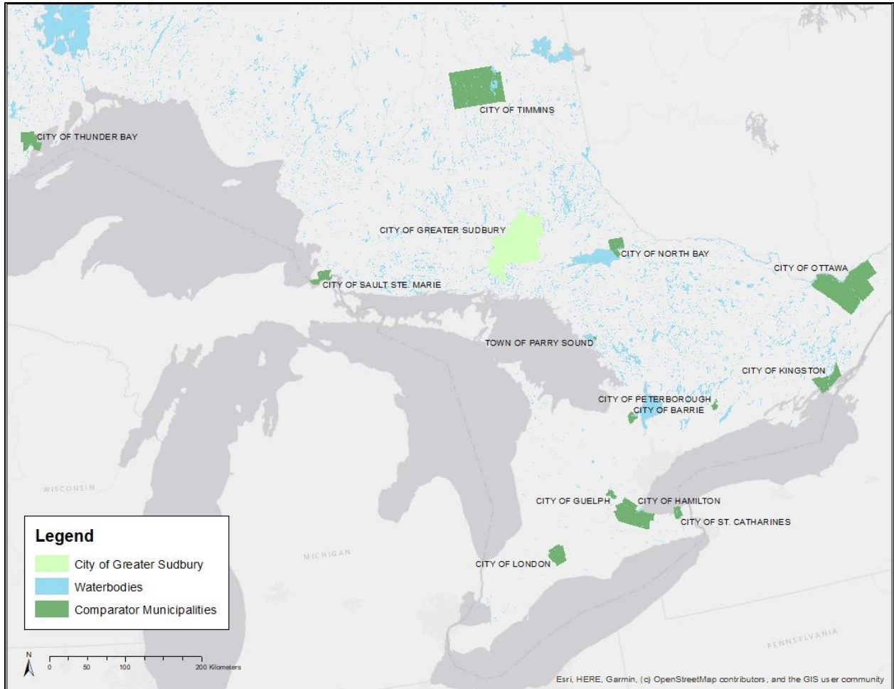
Figure 1 Map of comparator municipalities selected for best practice review