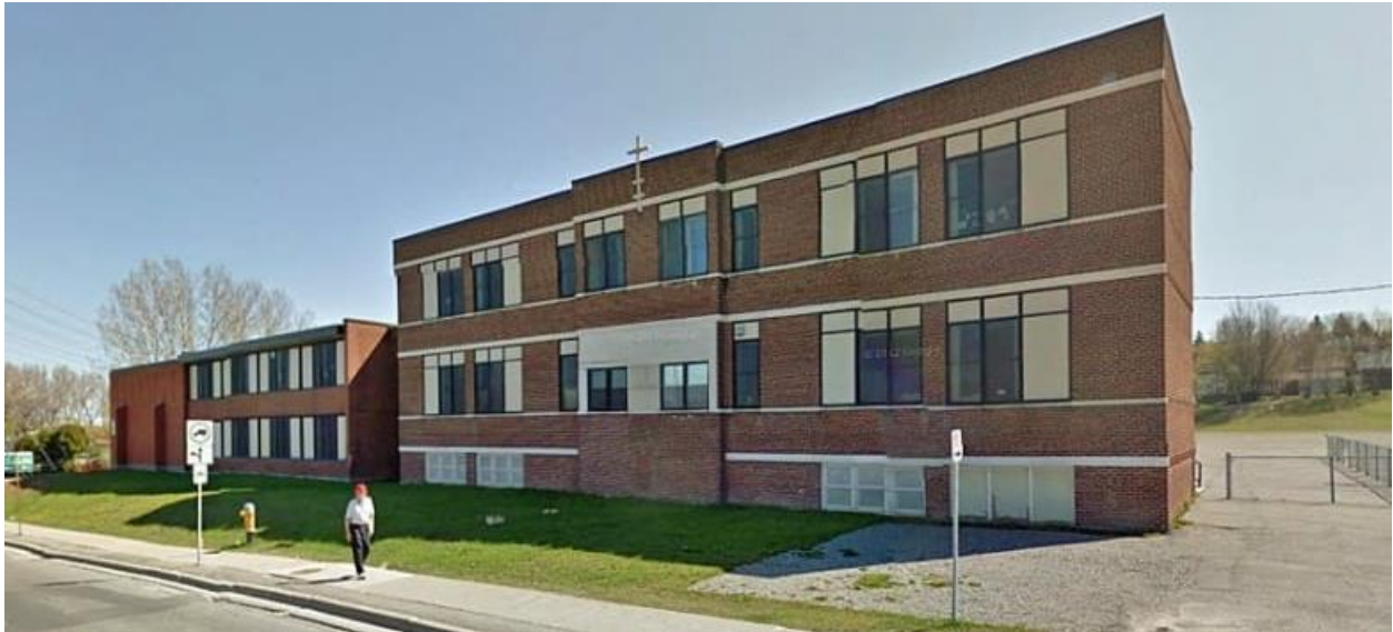
Former Ecole St. Denis School on Regent Street, redeveloped for housing

What parameters can be set out as to residential uses on institutional lands as-of-right?