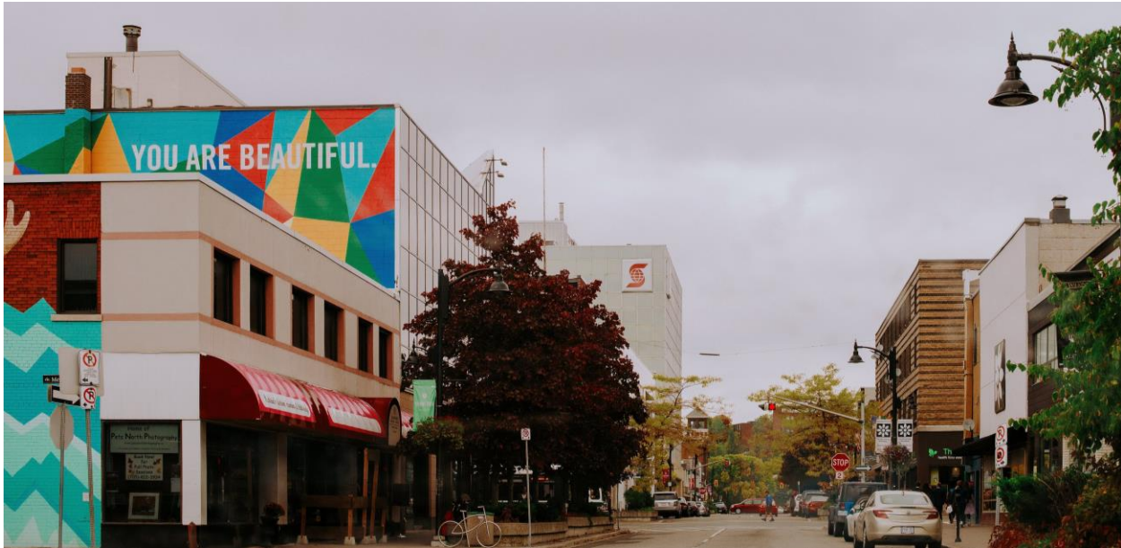
Mixed-use commercial buildings in downtown Sudbury

How can the CGS Official Plan and Zoning By-law facilitate the increased supply of housing through mixed use development with residential components in commercial zones?