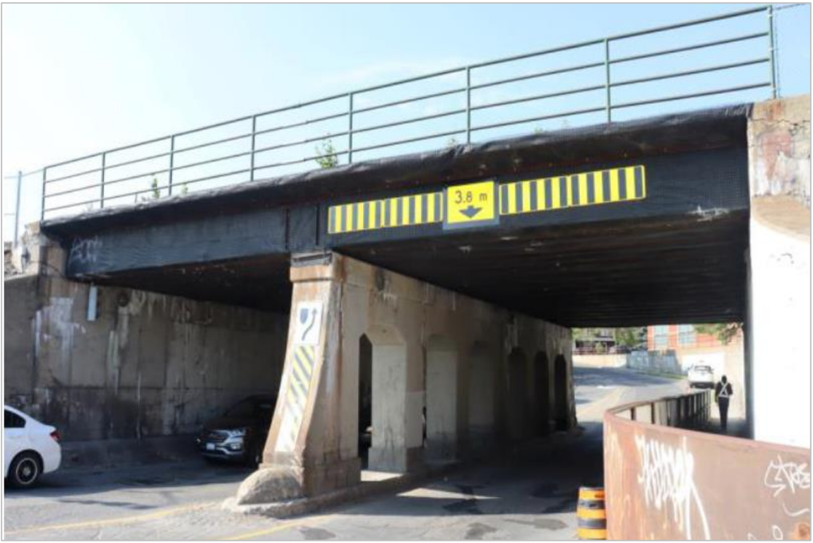
Figure 1. College Street Underpass, looking southbound (from 2022 Inspection Report)