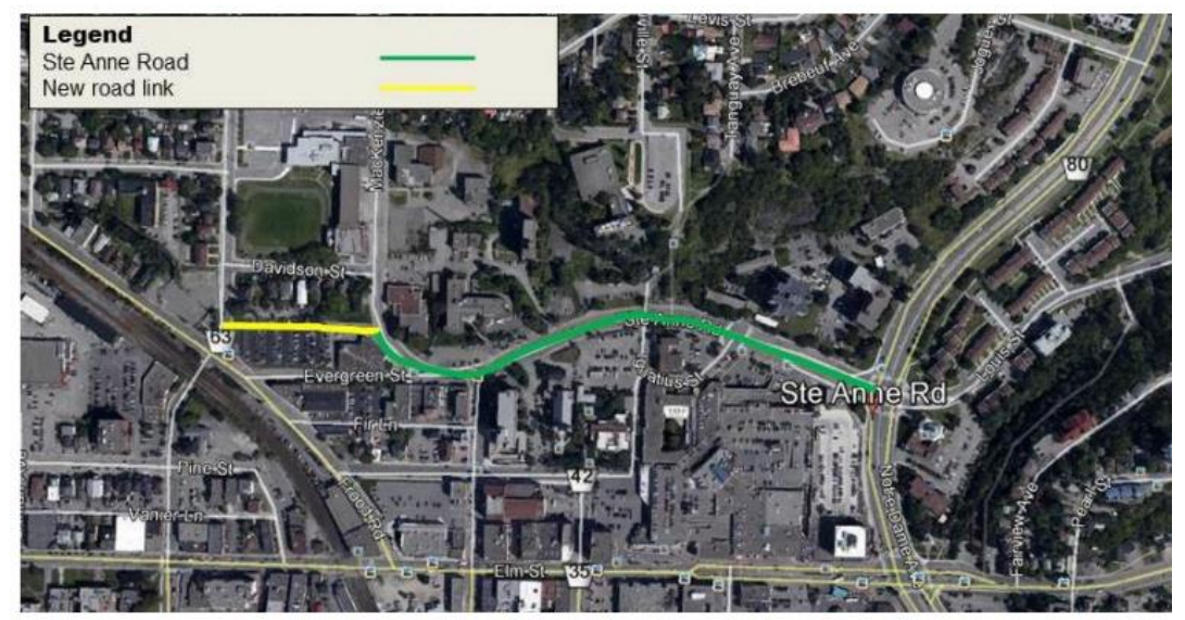
Figure 2. Recommended Ste. Anne Road Extension (Transportation Master Plan 2018, p.161)