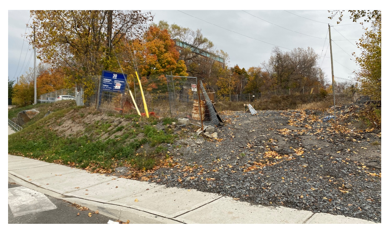
Photo 2. Undeveloped parking area adjacent to Ste. Anne Road shown as 'Area 3' on the applicant's concept plan, to be severed from 38 Xavier Street and added to 20 St. Anne Road (Red Oak Villa), facing northeast. Photo taken October 30, 2024. CGS File 751-6/24-19.

Photo 1. Parking area in the centre foreground adjacent to Mackenzie Street shown as 'Area 1' on the applicant's concept plan, to be severed from 30 Ste. Anne Road and added to 20 St. Anne Road (Red Oak Villa), facing east. Photo taken October 30, 2024. CGS File 751-6/24-19.