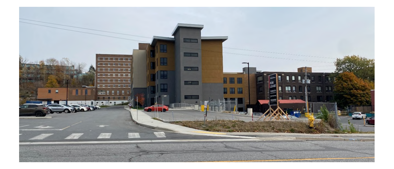
Photo 1. Parking area in the centre foreground adjacent to Mackenzie Street shown as 'Area 1' on the applicant's concept plan, to be severed from 30 Ste. Anne Road and added to 20 St. Anne Road (Red Oak Villa), facing east. Photo taken October 30, 2024. CGS File 751-6/24-19.