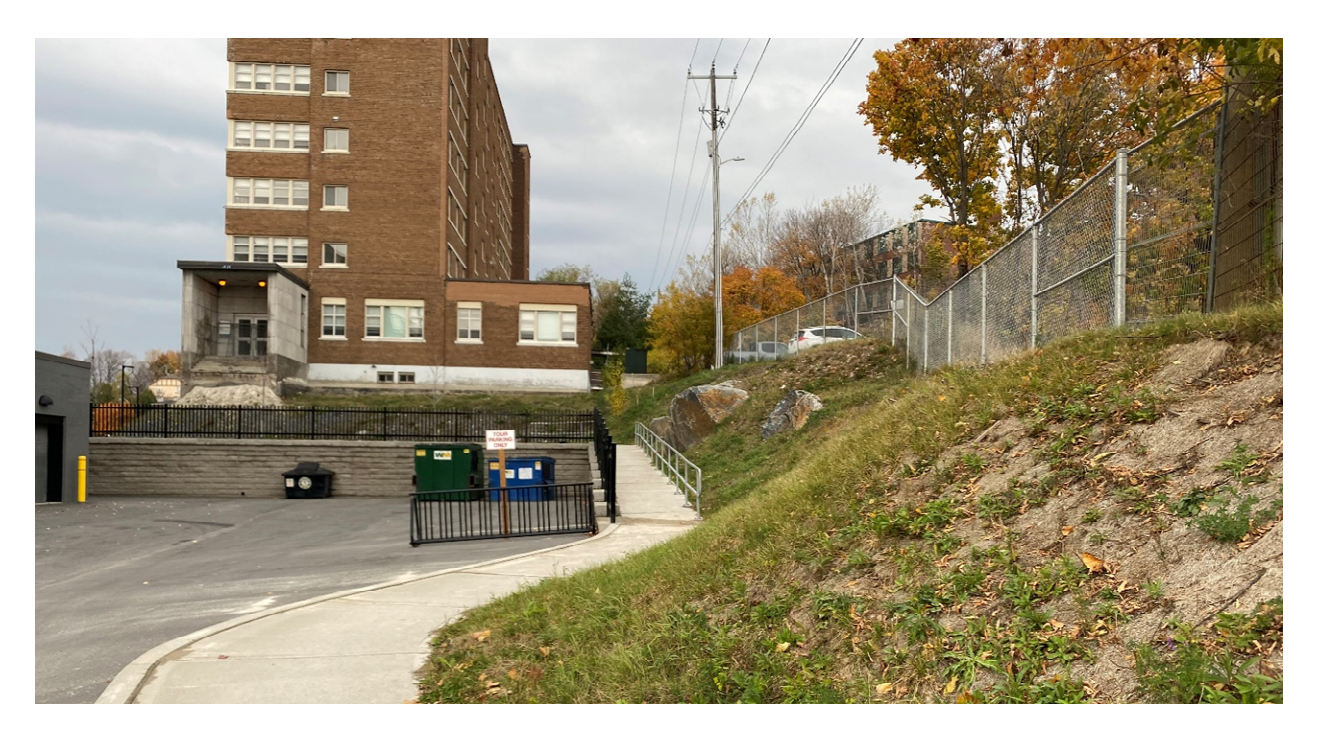
Photo 3. Pedestrian pathway in the centre of the photo and extending from Mackenzie Street shown as 'Area 2' on the applicant's concept plan, to be severed from 30 Ste. Anne Road and added to 20 St. Anne Road (Red Oak Villa), facing north. Photo taken October 30, 2024. CGS File 751-6/24-19.