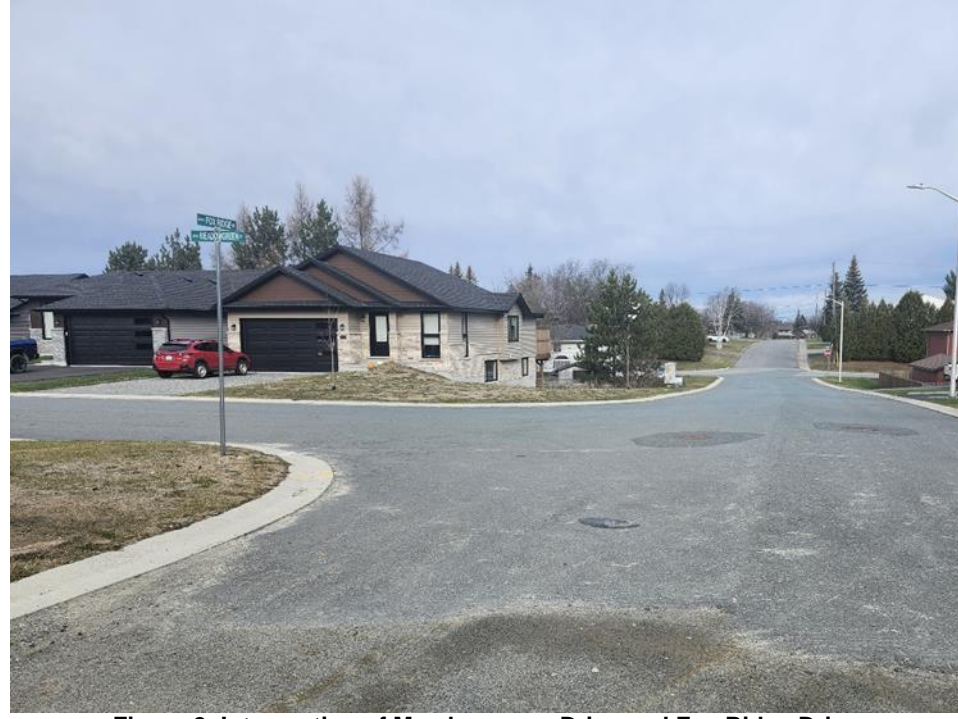
Figure 2: Intersection of Meadowgreen Drive and Fox Ridge Drive

The standard form of traffic control at a "T" intersection is to have a yield sign facing incoming traffic on the intersecting road. According to Book 5 of the Ontario Traffic Manual, a yield sign is appropriate when traffic volumes are low, sight lines are good, and stopping is not always required. All of these conditions are met at this intersection.