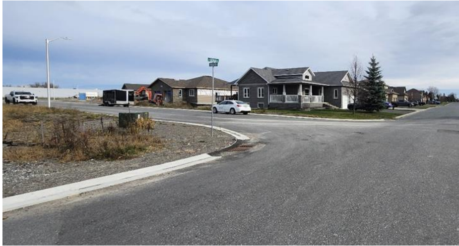
Figure 2 – Intersection of Windstar Avenue and Edna Street