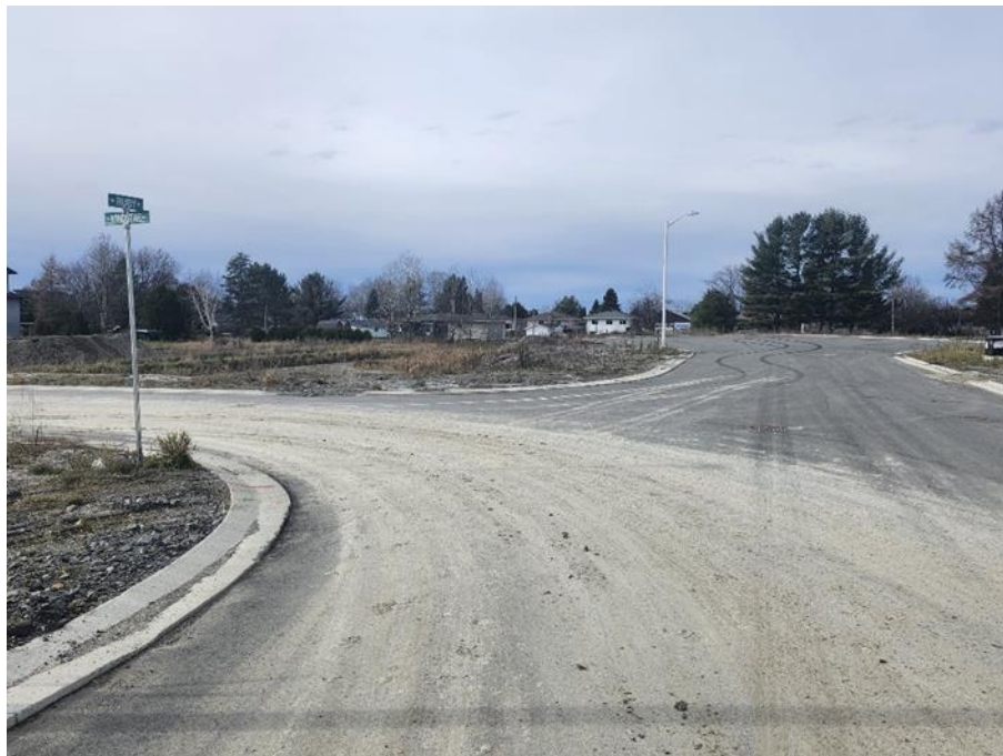
Figure 2: Intersection of Windstar Avenue and Ruby Street