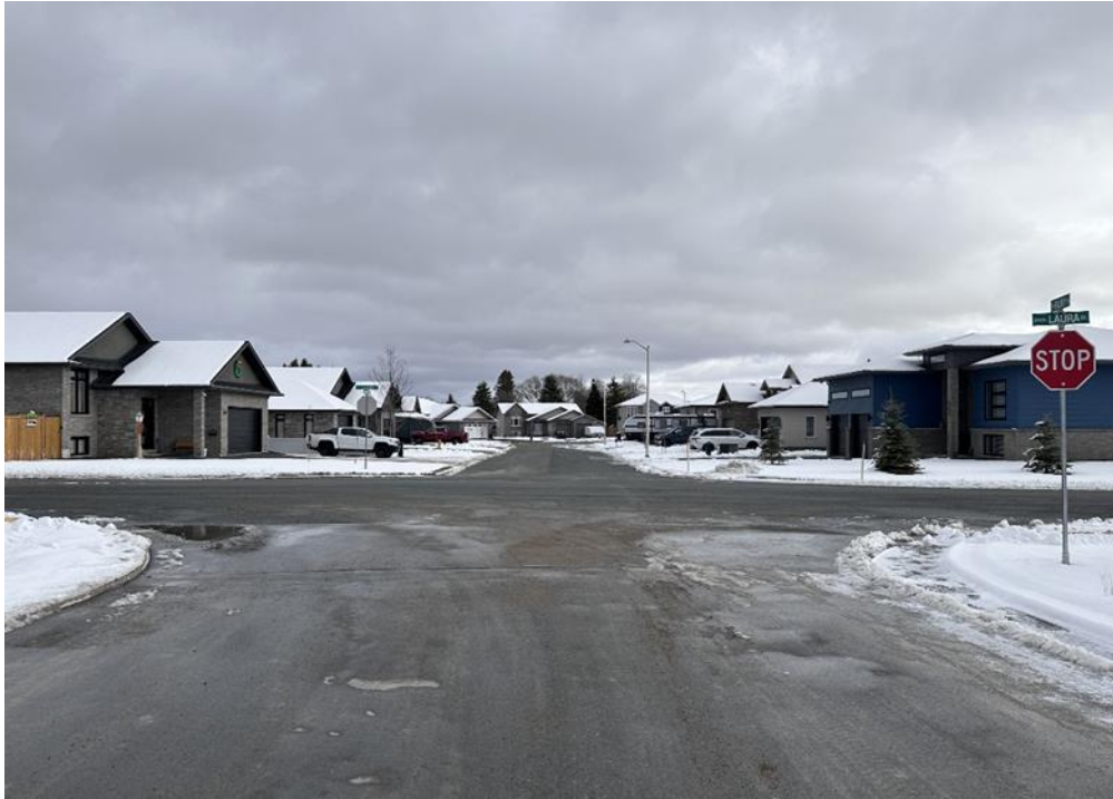
Figure 4: A look at the intersection of Emerald Crescent at Laura Drive from Ruby Street