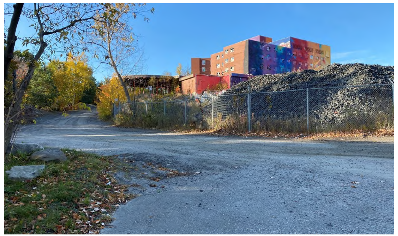
Photo 7. East side of subject lands showing the east side of the existing building, with Bell Park Road on the left, taken from Facer Street facing southwest. Photo taken October 17, 2024. CGS Files 701-6/23-04 & 751-6/23-25.