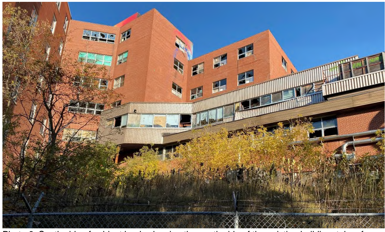
Photo 6. South side of subject lands showing the south side of the existing building, taken from Bell Park Road facing north. Photo taken October 17, 2024. CGS Files 701-6/23-04 & 751-6/23-25.