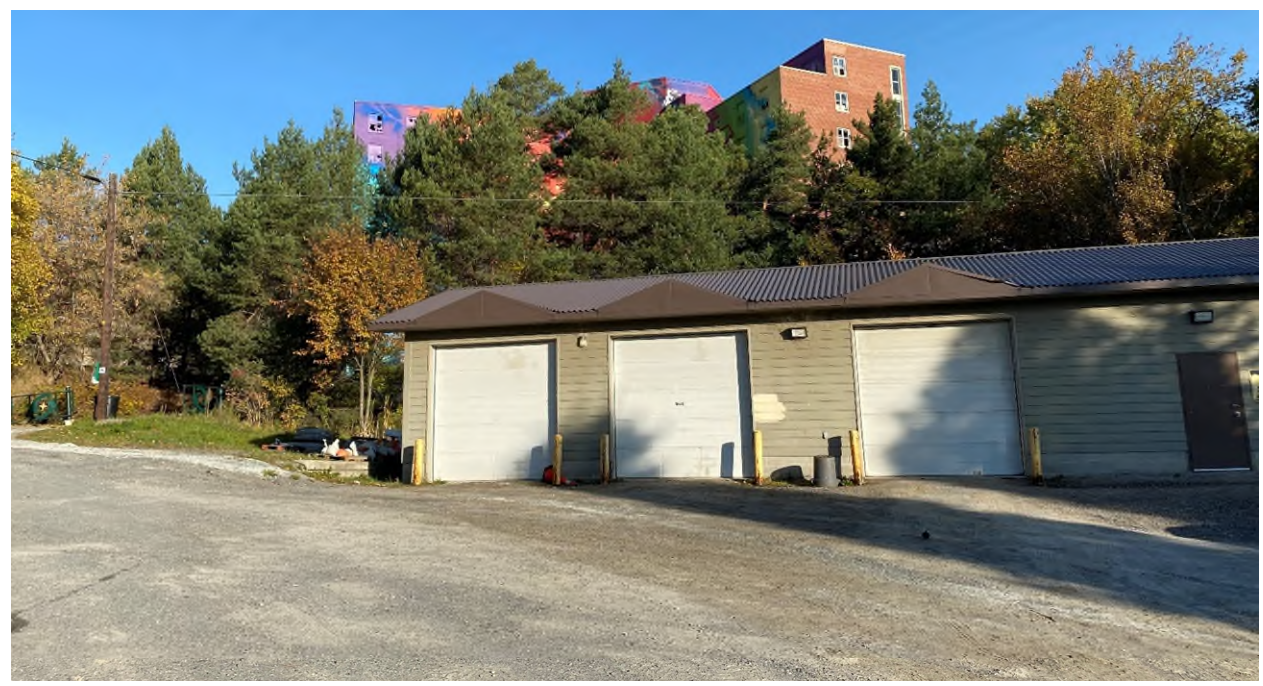
Photo 5. South of subject lands showing Bell Park Road on the left and City park maintenance building in the foreground, with the south side of the existing building on the subject lands in the background, facing north. Photo taken October 17, 2024. CGS Files 701-6/23-04 & 751-6/23-25.