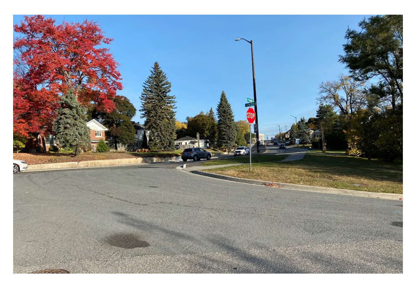
Photo 9. Intersection of Paris Street and Facer Street, showing Facer Street in the foreground and low density residential use in the background, facing north. Photo taken October 17, 2024. CGS Files 701-6/23-04 & 751-6/23-25.