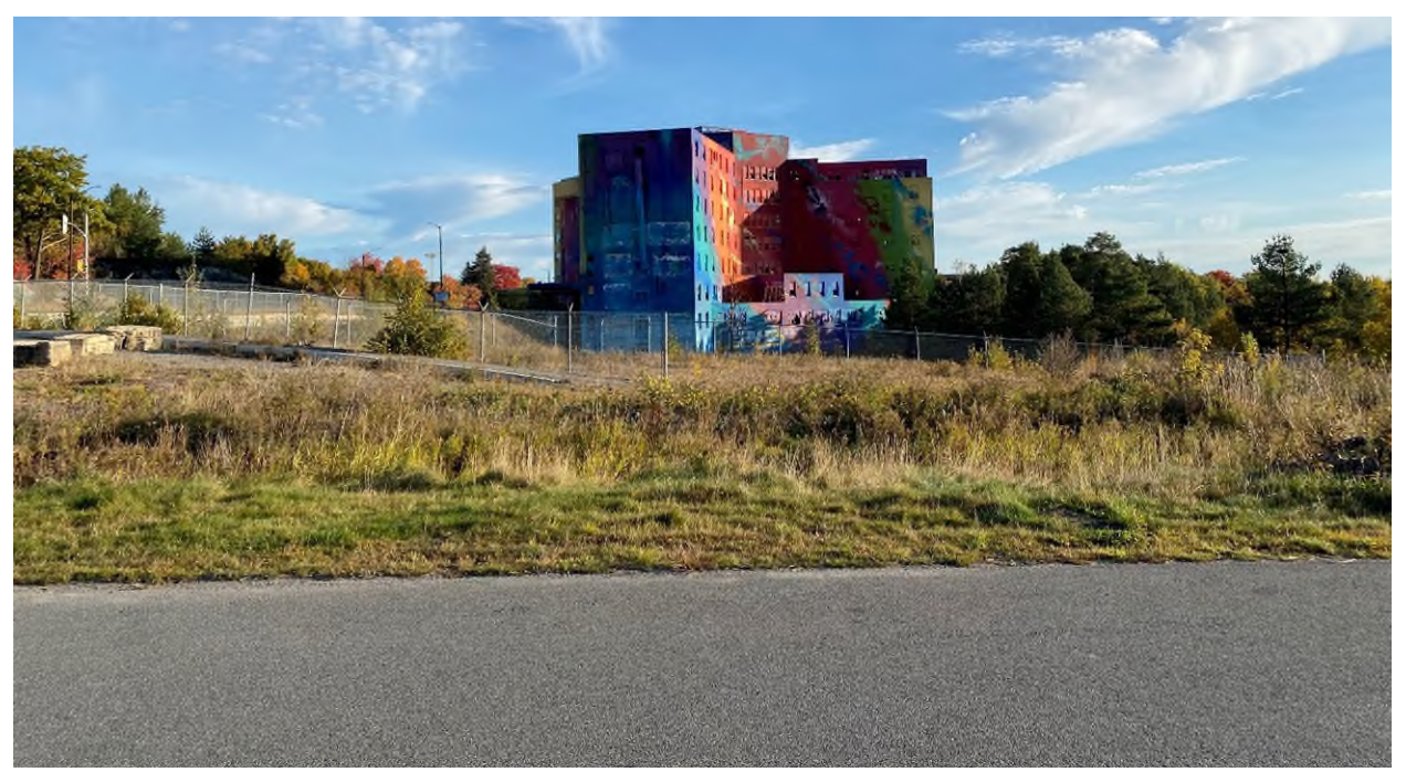
Photo 1. Subject lands at 700 Paris Street showing the west side of the existing building, with Paris Street on the left, facing northeast. Photo taken October 17, 2024. CGS Files 701-6/23-04 & 751-6/23-25.