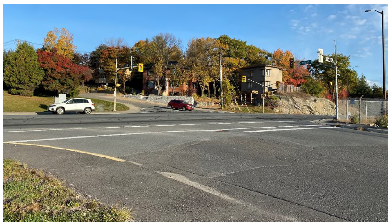
Photo 3. Intersection of Paris Street and Boland Avenue showing the current driveway into the site and City-owned parking lot in the foreground and low density residential use in the background, looking north. Photo taken October 17, 2024. CGS Files 701-6/23-04 & 751-6/23-25.