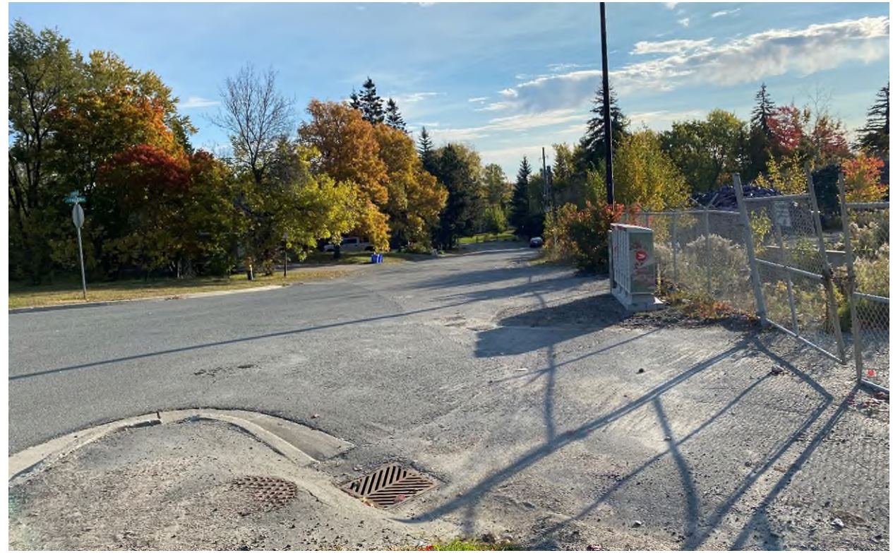
Photo 8. Facer Street showing the subject lands on the right and low density residential use on the left, taken from Paris Street facing east. Photo taken October 17, 2024. CGS Files 701-6/23-04 & 751-6/23-25.