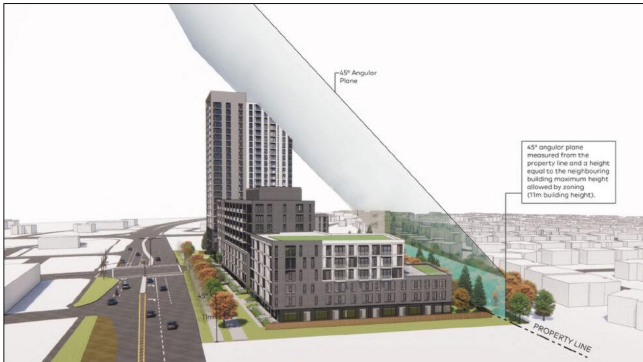
Illustration of the 45° angular plane.

Of importance is the discussion of the height of the proposed buildings and their compatibility with the existing neighbourhood, which is comprised of single detached dwellings. The need for compatible built forms is noted through the Official Plan (2.3.3. and 3.2.3. in particular). The proposed buildings are 9 storeys in height (approximately 30 metres) while the surrounding neighbourhood is mostly two storeys in height (approximately 6-8 metres in height). As noted earlier in the report, Building 1 is proposed to be approximately 58 metres from the nearest single detached dwelling, while Buildings 2 & 3 are proposed to be approximately 52 metres from the nearest existing single detached dwelling. This distance is reduced if measuring to the property line of the nearest R1-5 zoned lot, whether existing or proposed. The separation distances to property lines for Building 1 is 52 metres, Building 2 is just over 30 metres, and Building 3 is just over 41 metres. When considering siting of buildings that are taller than adjacent buildings, staff rely on planning principles and submitted studies. A standard urban design principle is the 45° angular plane; this is the projection of a plane at 45° from the maximum height of the lower density property to determine an appropriate height for the adjacent taller development as shown generally in the figure below.