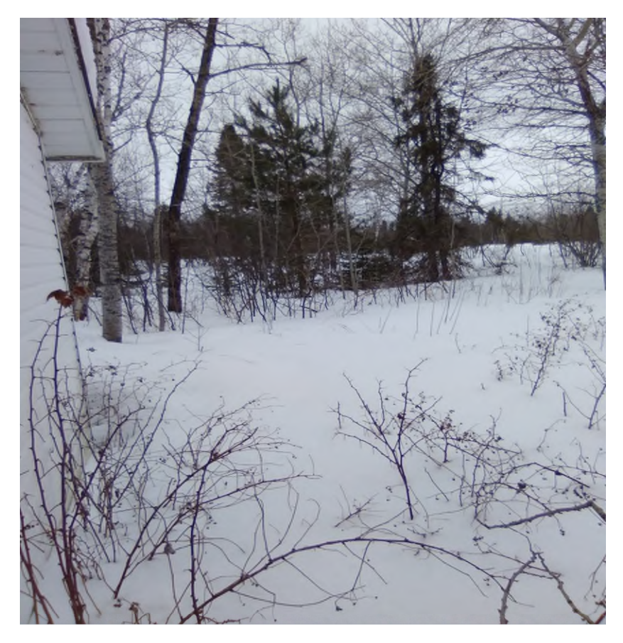
PHOTO # 5 Viewed from the rear of a property for lot addition looking west.