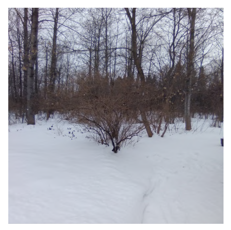
PHOTO # 3 Viewed from the rear of a property for lot addition looking west.