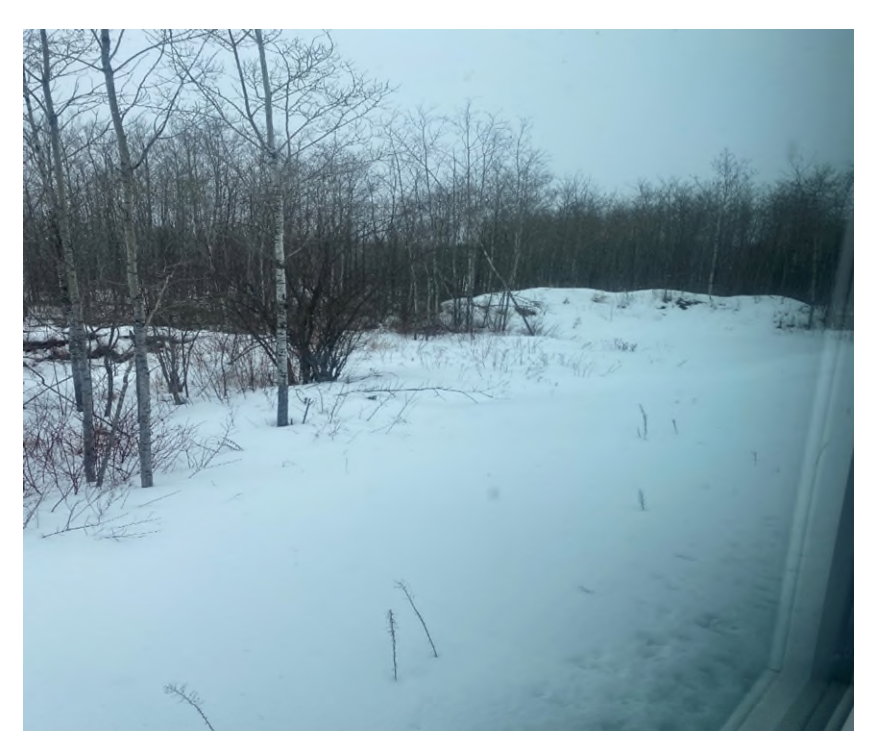
PHOTO # 2 Subject land, viewed from the rear of the single detached dwelling looking west to the lot addition.

PHOTO #1 Existing single detached dwelling on the subject lands.