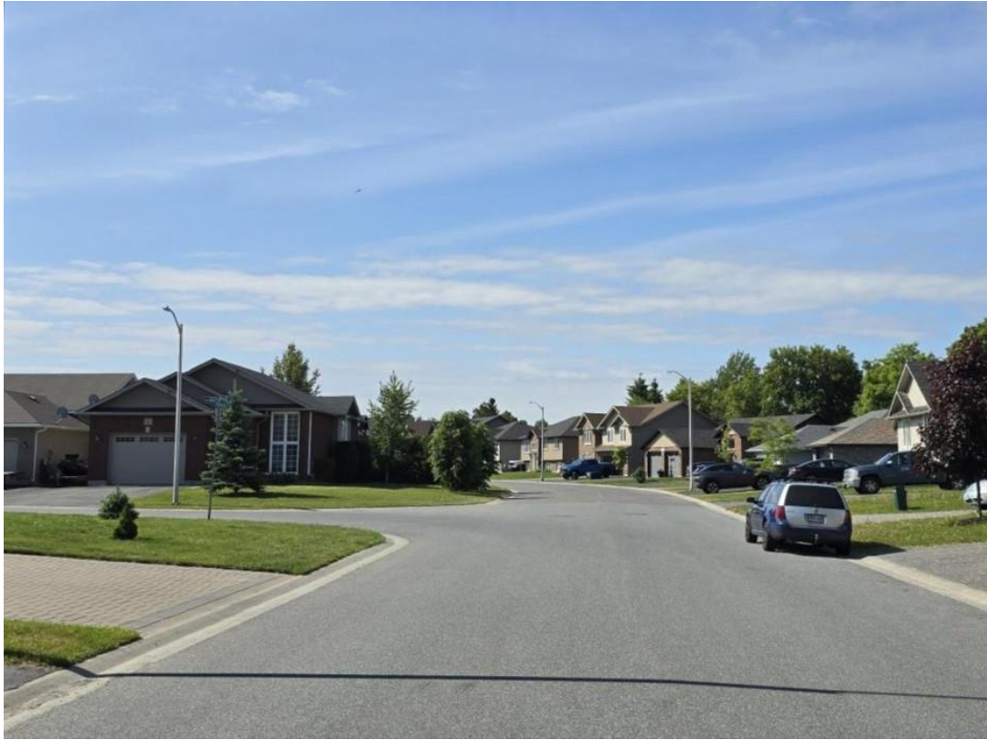
Figure 2: Solstice Street looking south with Eclipse Crescent to the east