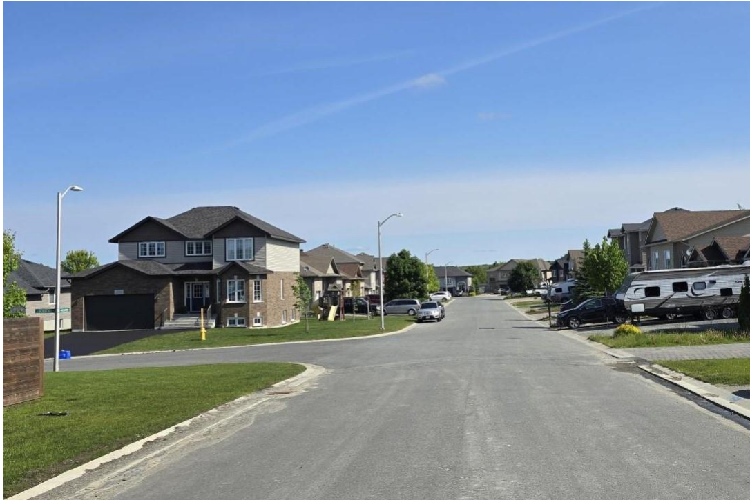
Figure 3: Eclipse Crescent looking North with Solstice Street on the west