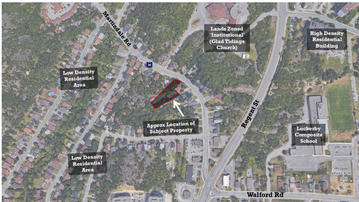
Figure 1 - Subject Property & Surrounding Context

WEST: Low density residential areas along Marcel Street & Southview Drive, Lands zoned Open Space Private (OSP)