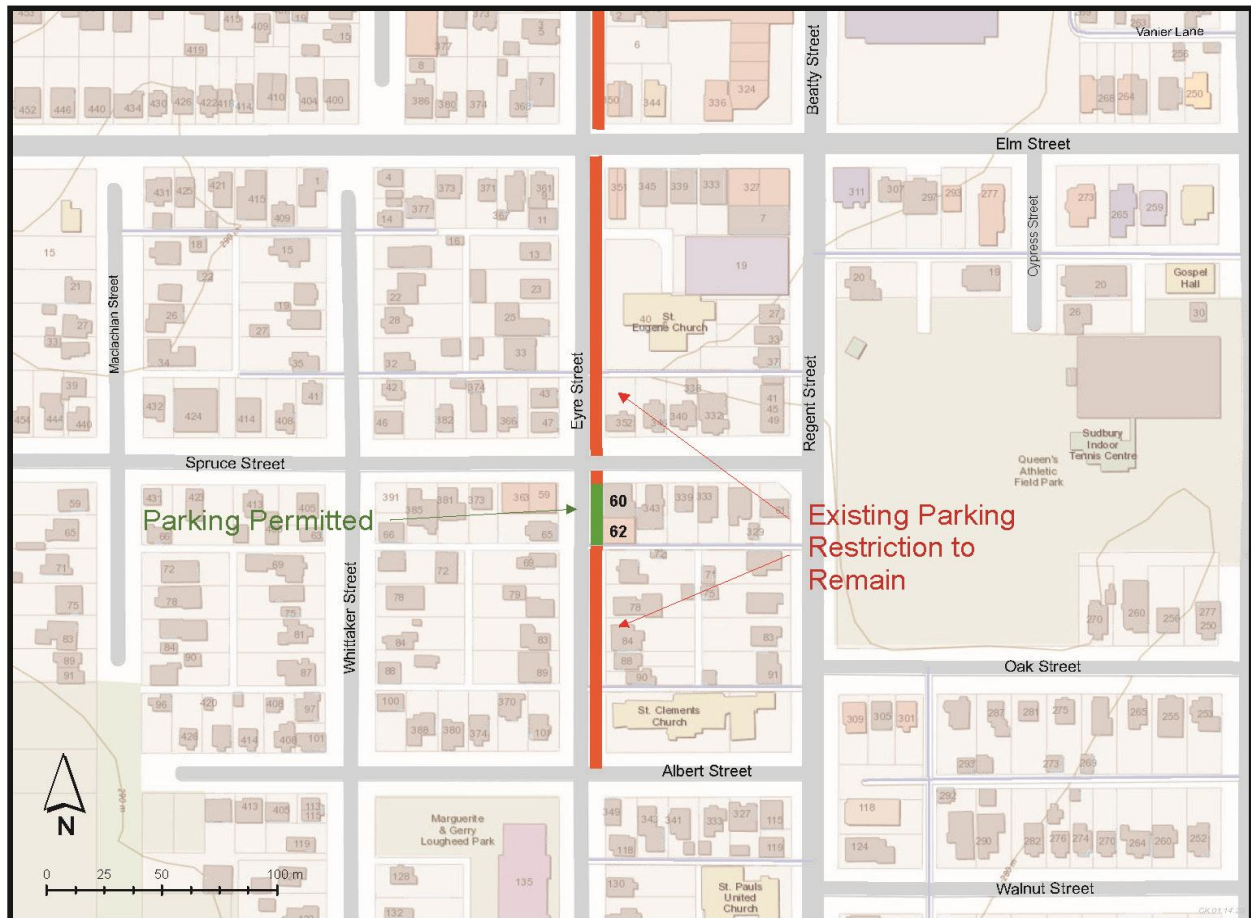
Figure 3 – Eyre Street Parking Recommendations

parking in this area, approximately 3 additional on-street parking spaces will be created. Figure 3, below, shows an overview of where parking is recommended to be permitted.