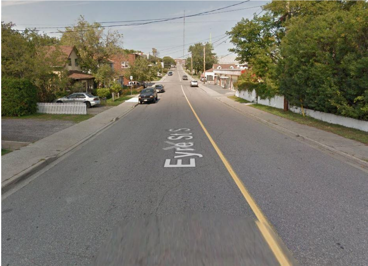
Figure 2 – Eyre Street Street View

The primary function of a public road is for the safe and efficient movement of traffic. On-street parking may be considered when this criteria is met.