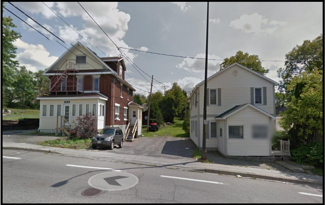
View looking south from Van Horne Street

Re: Lane Closure and Declaration of Surplus Land Van Horne Street, Sudbury