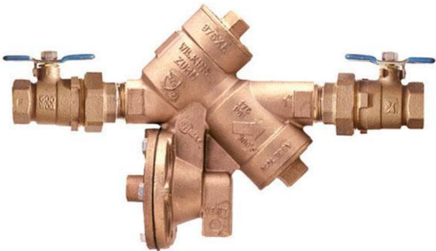
Double Check Valve