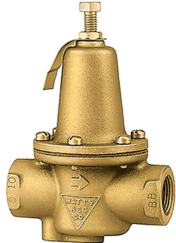
Reduced Pressure Valve