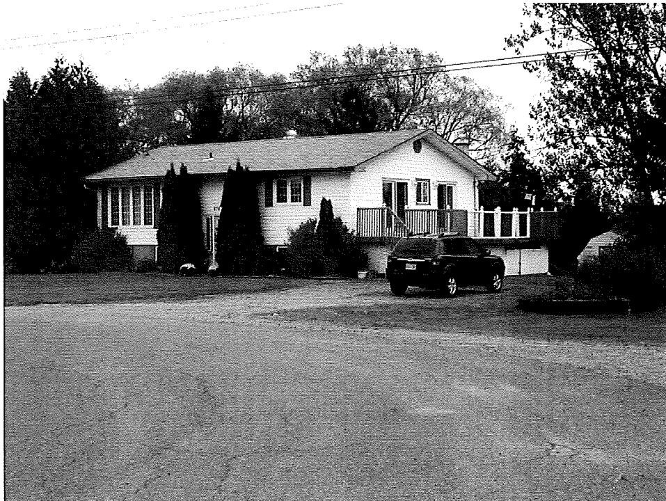
PHOTO 4 EXISTING SINGLE DETACHED DWELLING TO THE NORTH OF PROPOSED LOT (AREA C)