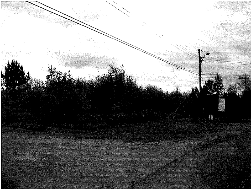
PHOTO 2 PROPOSED SINGLE DETACHED DWELLING LOT AT BATHURST STREET AND LEONARD STREET LOOKING SOUTH (AREA C ON SUBMITTED SKETCH)