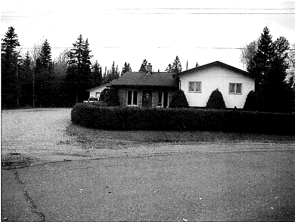
PHOTO 6 EXISTING SINGLE DETACHED DWELLING LOCATED TO THE NORTH OF PROPOSED LOT (AREA D)