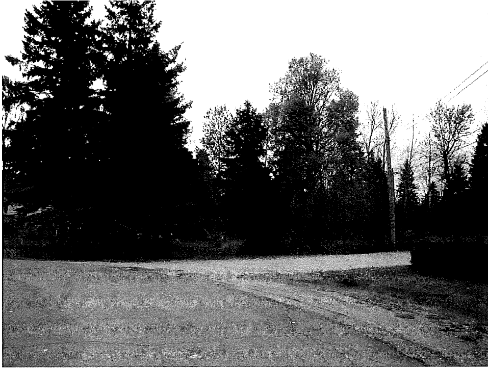
PHOTO 3 PROPOSED SINGLE DETACHED DWELLING LOT AT THE CORNER OF AURORE DRIVE AND LEONARD STREET LOOKING SOUTHWEST (AREA D ON SUBMITTED SKETCH)