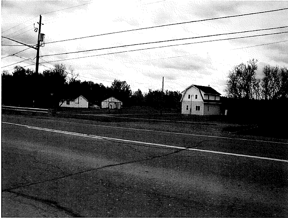
PHOTO 1 EXISTING SINGLE DETACHED DWELLINGS FRONTING HIGHWAY 144 LOOKING SOUTH (AREAS A & B ON SUBMITTED SKETCH)