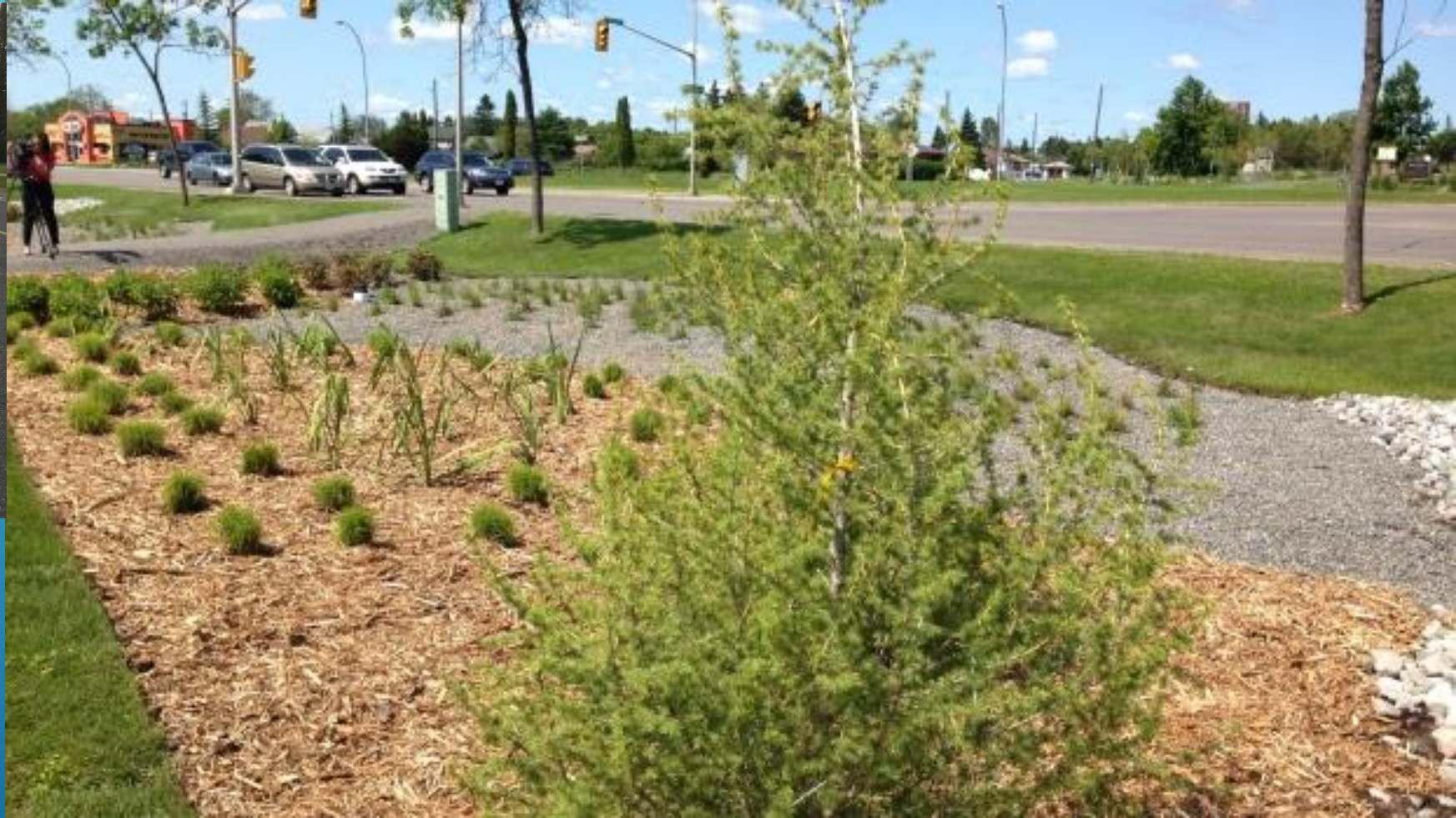
Thunder Bay has recently installed a series of rain gardens in prominent locations that filter and reduce stormwater run-off