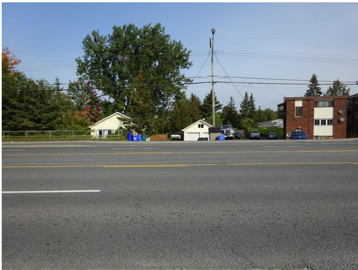
Photo #8: Residential lands on the north side of Falconbridge Road, looking north.