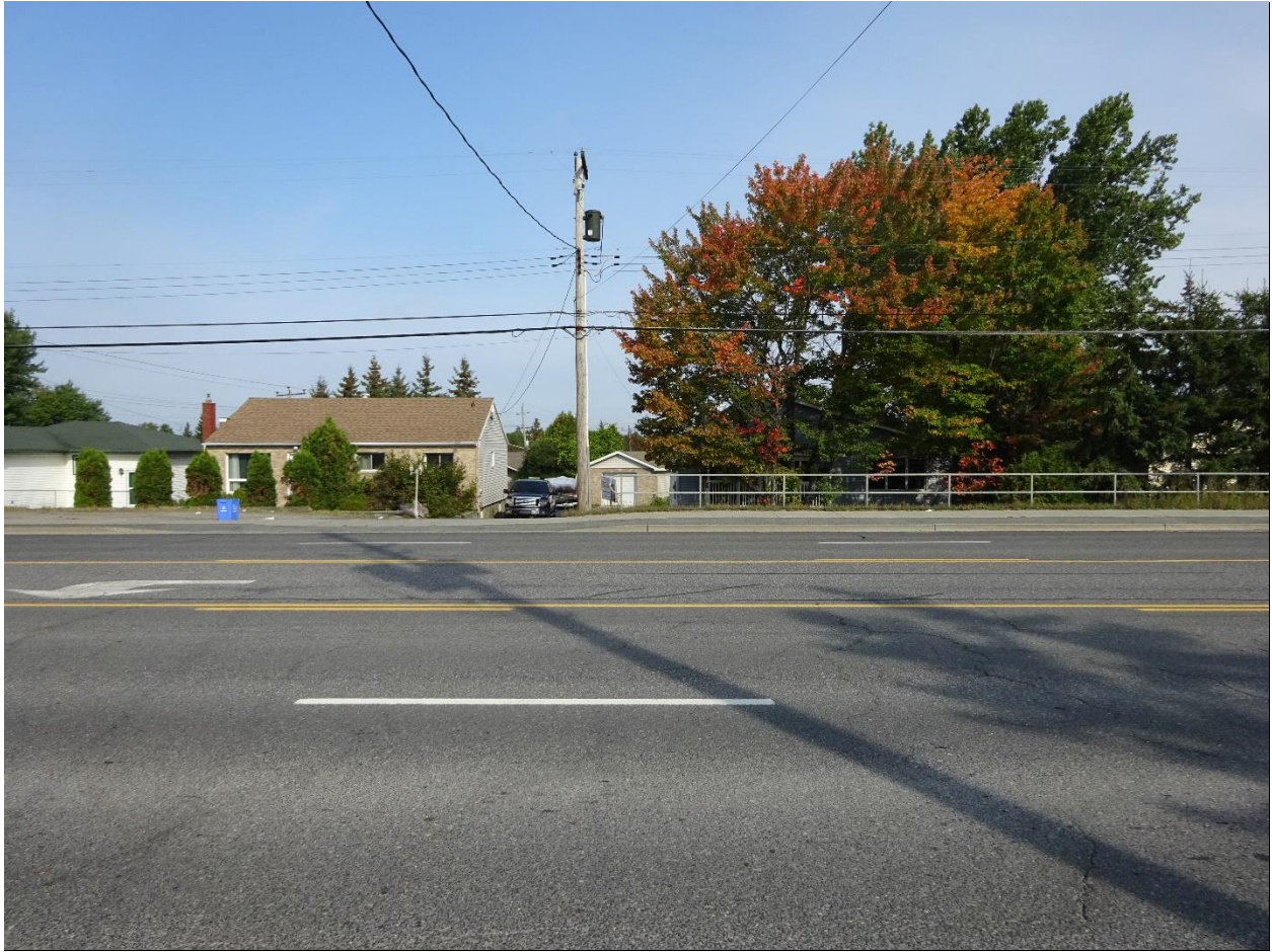
Photo #7: Residential lands on the north side of Falconbridge Road, looking north.