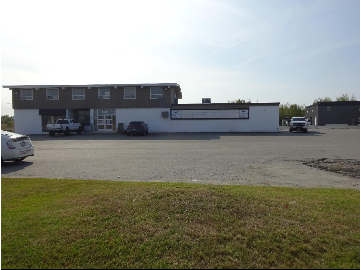
Photo #3: Commercial lands to the east of the subject lands on the south side of Falconbridge Road, looking south.