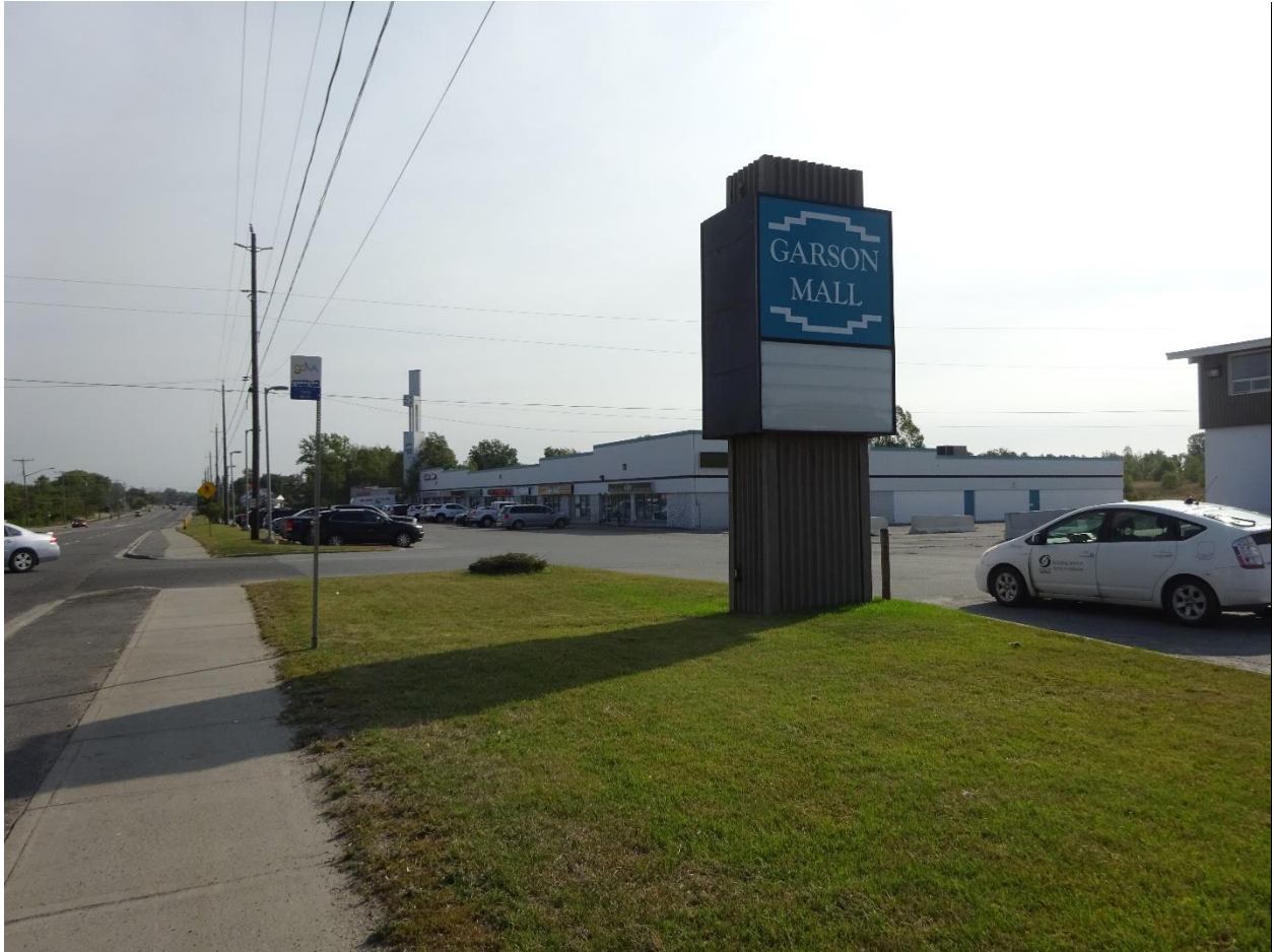
Photo #4: Commercial lands to the east of the subject lands on the south side of Falconbridge Road, looking east.