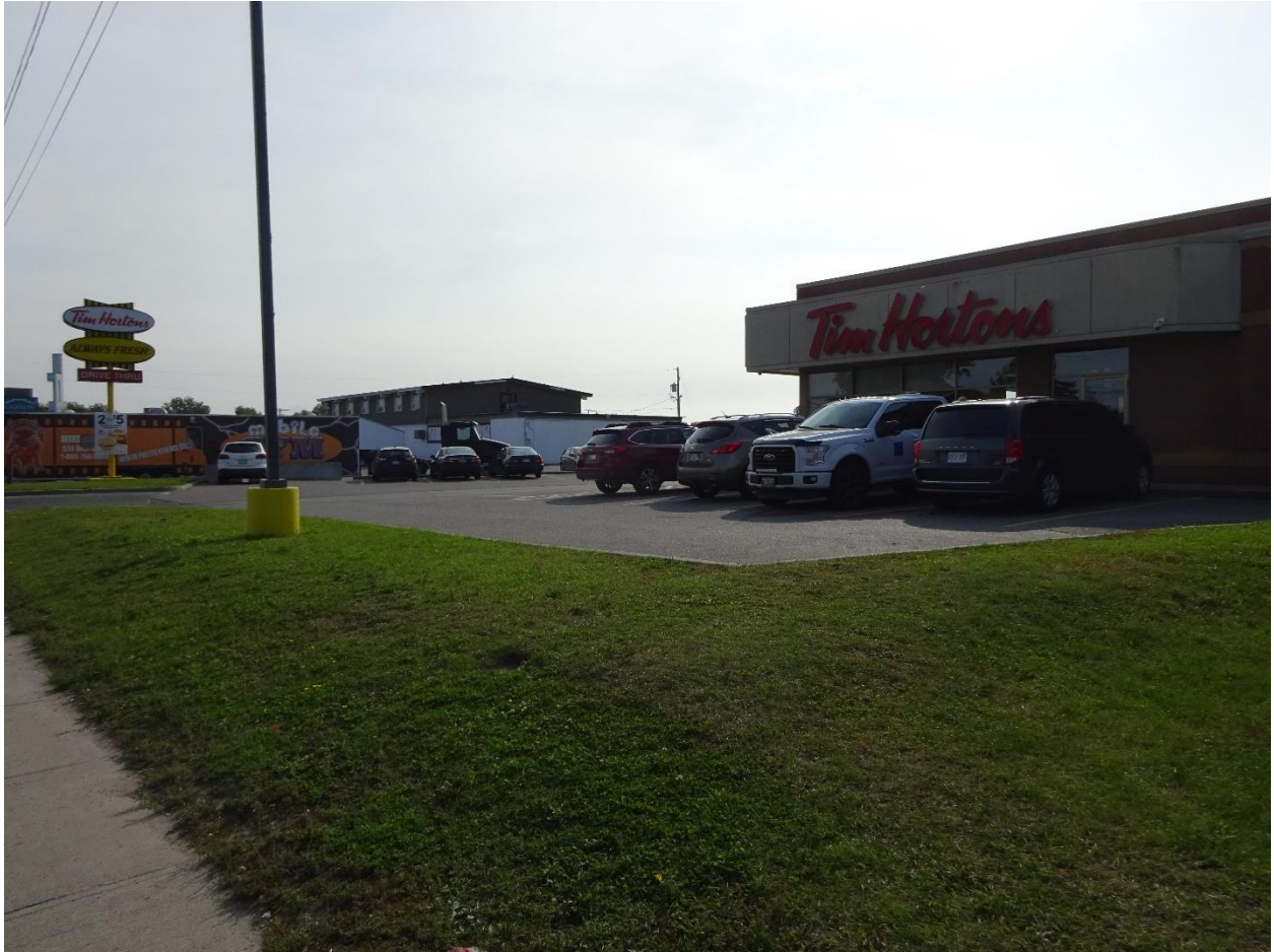
Photo #2: Commercial lands to the east of the subject lands on the south side of Falconbridge Road, looking east.