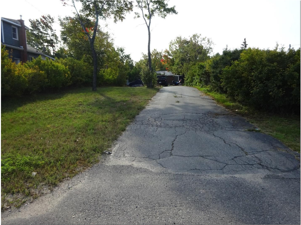
Photo #5: Residential lands to the immediate west of the subject lands on the south side of Falconbridge Road, looking south.