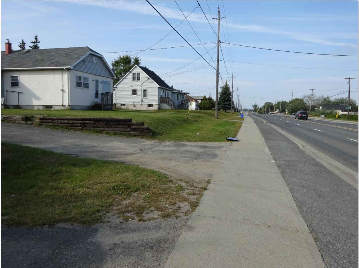
Photo #6: Residential lands to the west of the subject lands the south side of Falconbridge Road, looking west.