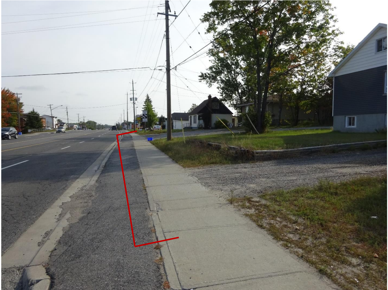
Photo #1: Existing residential use on the subject lands, looking east. Red line denotes the approximate extent of the frontage of the subject lands.