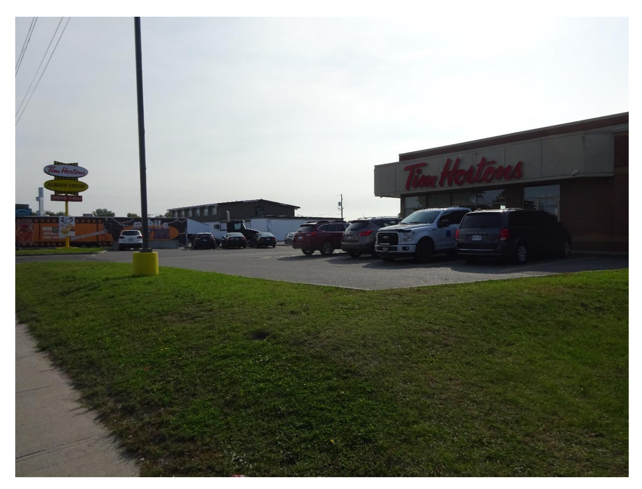
Photo #2: Commercial lands to the east of the subject lands on the south side of Falconbridge Road, looking east.