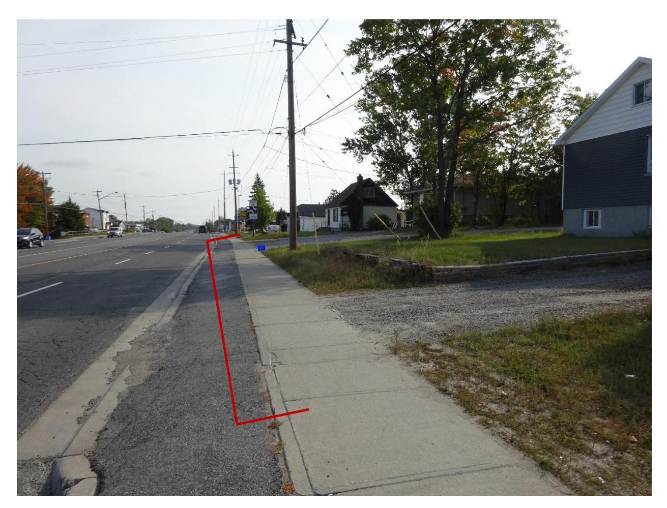
Photo #1: Existing residential use on the subject lands, looking east. Red line denotes the approximate extent of the frontage of the subject lands.