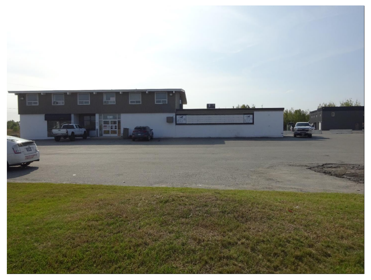
Photo #3: Commercial lands to the east of the subject lands on the south side of Falconbridge Road, looking south.