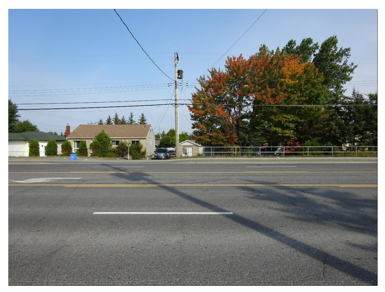
Photo #7: Residential lands on the north side of Falconbridge Road, looking north.