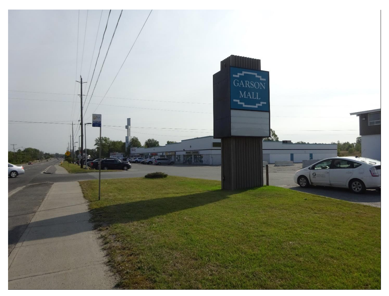
Photo #4: Commercial lands to the east of the subject lands on the south side of Falconbridge Road, looking east.