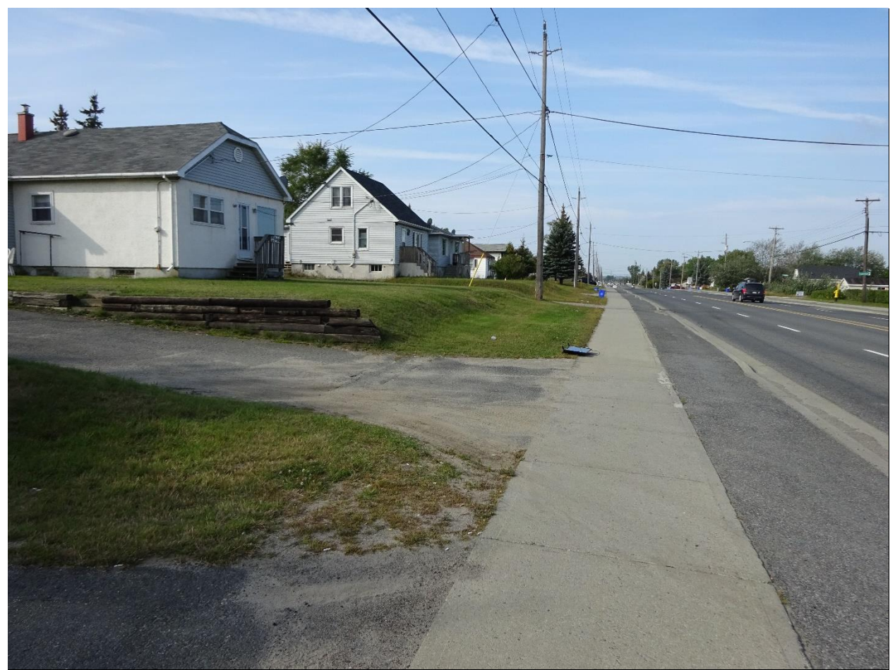
Photo #6: Residential lands to the west of the subject lands the south side of Falconbridge Road, looking west.