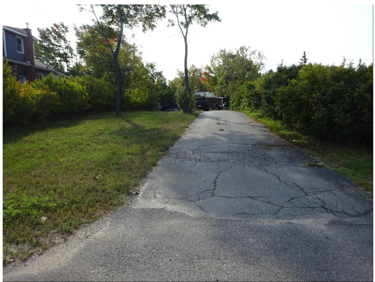
Photo #5: Residential lands to the immediate west of the subject lands on the south side of Falconbridge Road, looking south.