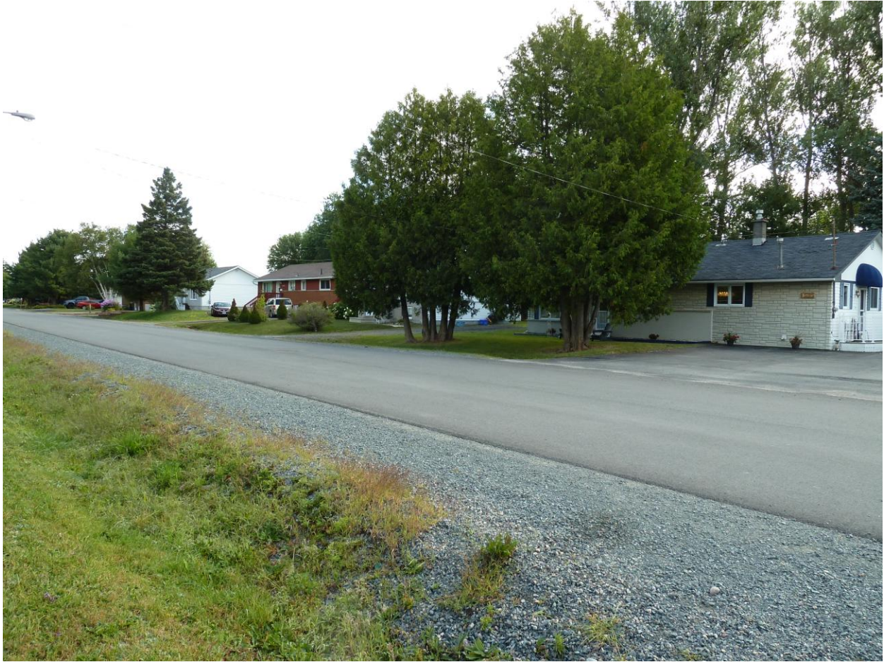
Photo 8: Lillian Street, Val Therese Single detached dwellings on east side of Lillian Street opposite subject property File 751-7/19-6 Photography August 22, 2019