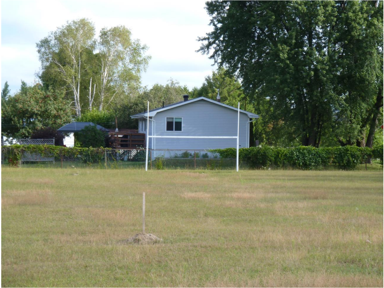
Photo 5: 4107 Lillian Street, Val Therese Single detached dwelling abutting northerly limit of subject property File 751-7/19-6 Photography August 22, 2019