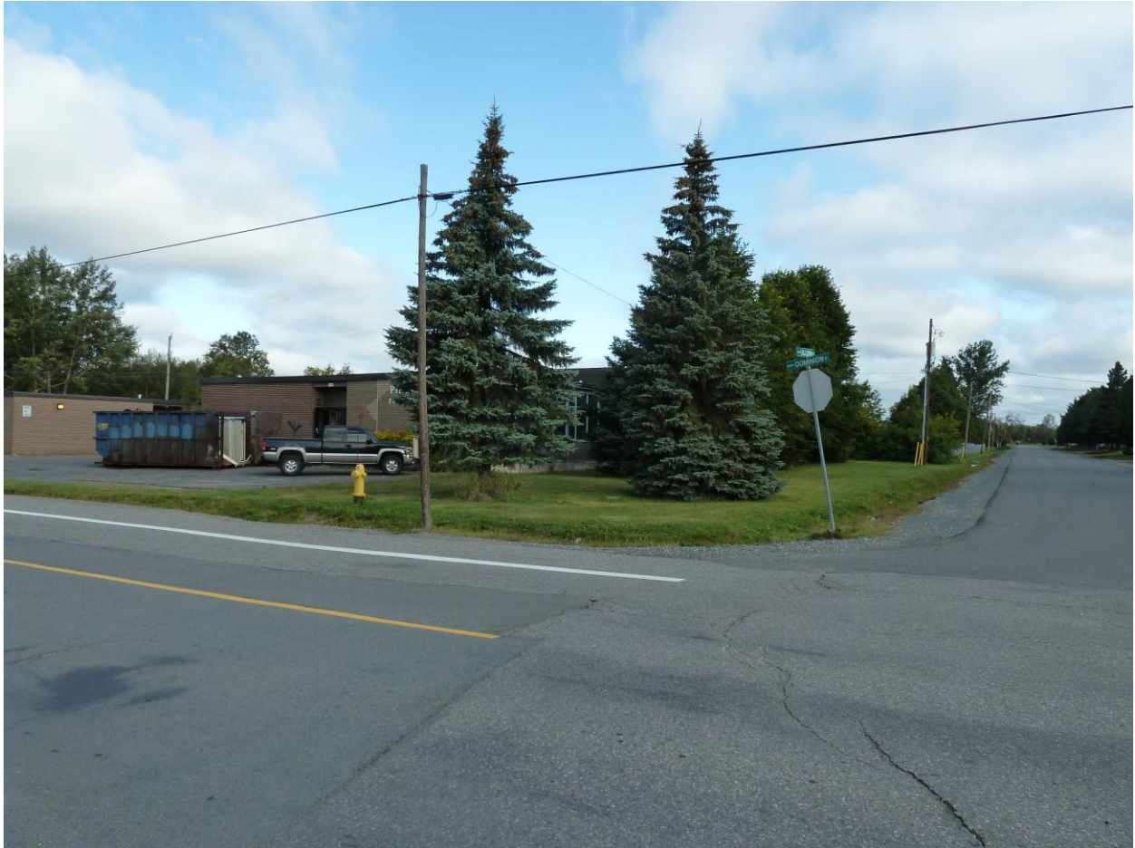
Photo 10: 1650 Dominion Drive, Val Therese Southeast corner of subject property at intersection of Dominion Drive and Lillian Street File 751-7/19-6 Photography August 22, 2019