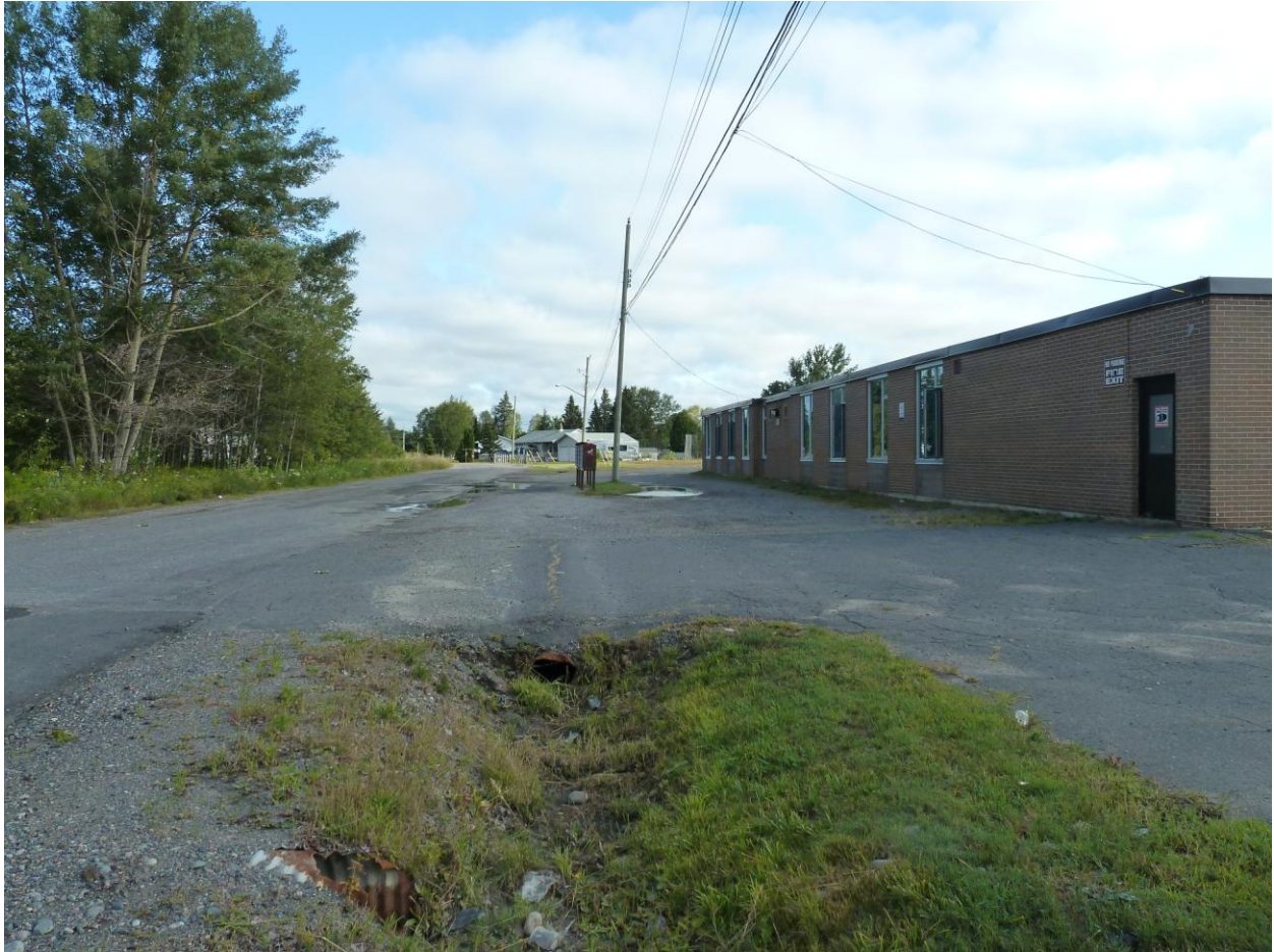
Photo 2: 1650 Dominion Drive, Val Therese View of westerly corner side yard and Larocque Avenue street line File 751-7/19-6 Photography August 22, 2019