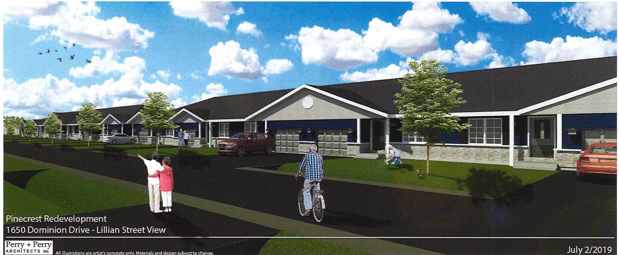
Pinecrest Redevelopment 1650 Dominion Drive - Lillian Street View

Perry + Perry ARCHITECTS Inc. All illustrations are artist's concepts only. Materials and design subject to change.