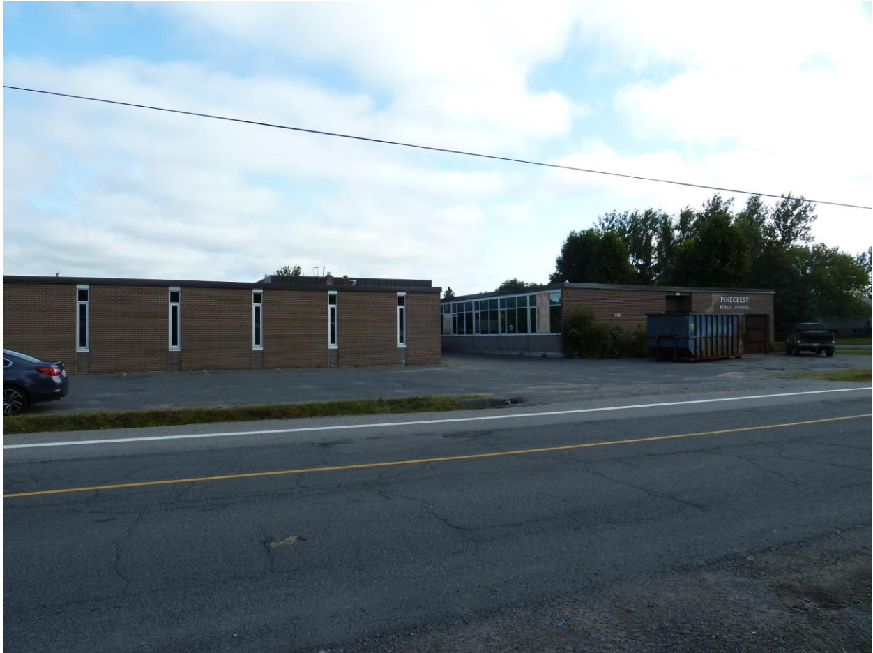
Photo 1: 1650 Dominion Drive, Val Therese View of former elementary school and Dominion Drive street line File 751-7/19-6 Photography August 22, 2019