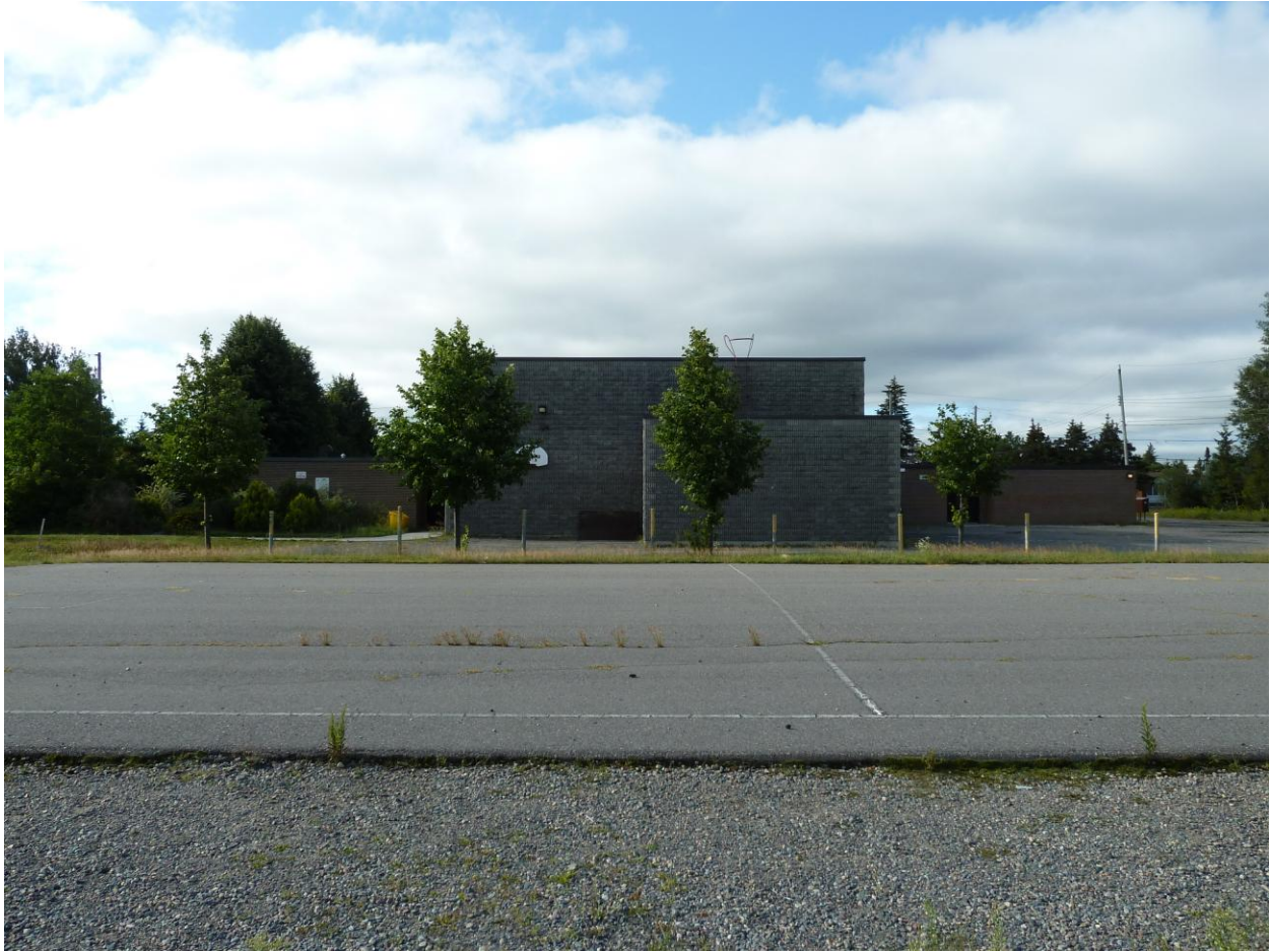
Photo 7: 1650 Dominion Drive, Val Therese View of school yard facing south towards former school building File 751-7/19-6 Photography August 22, 2019