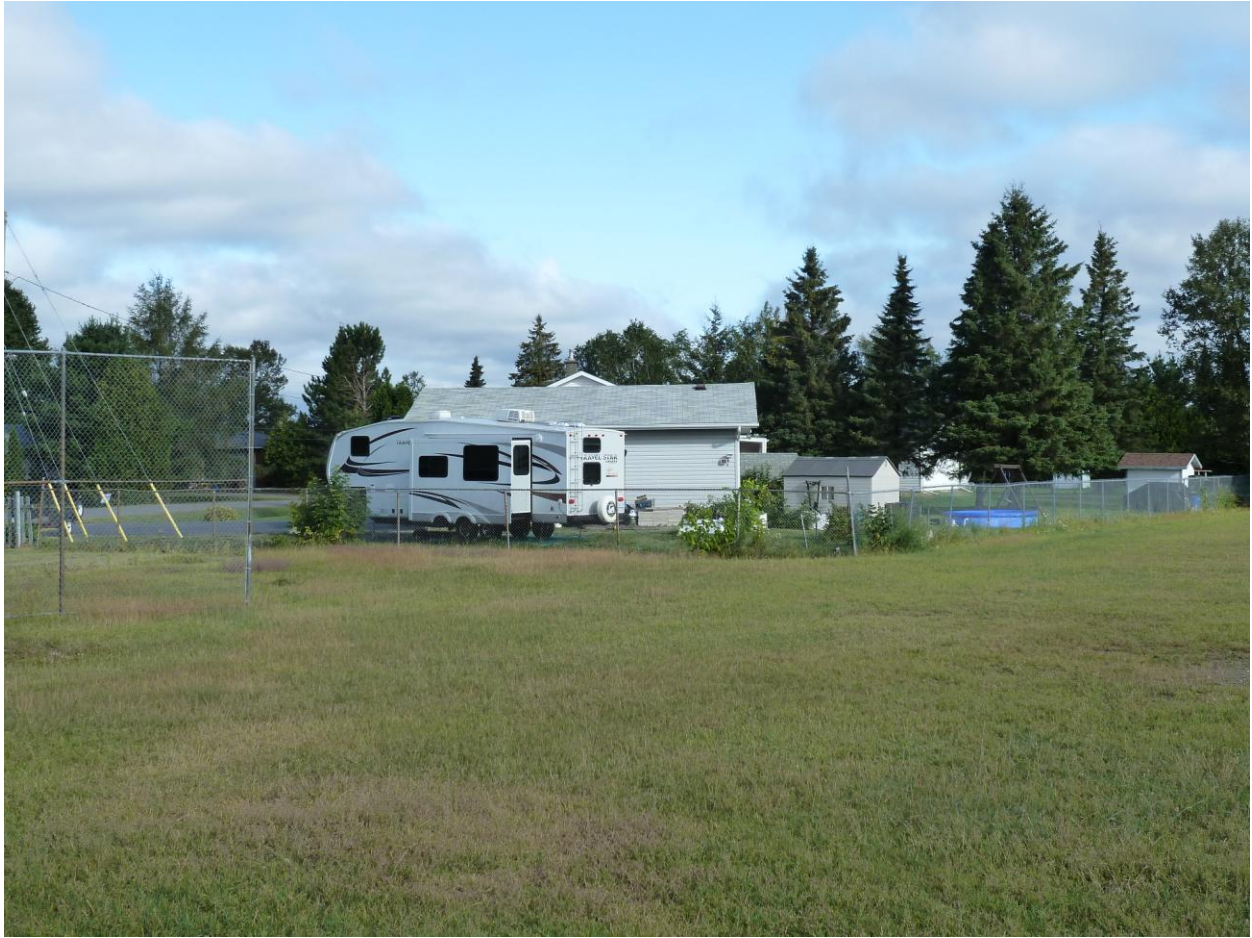
Photo 6: 4086 & 4098 Larocque Avenue, Val Therese Single detached dwellings abutting northwest corner of subject property File 751-7/19-6 Photography August 22, 2019