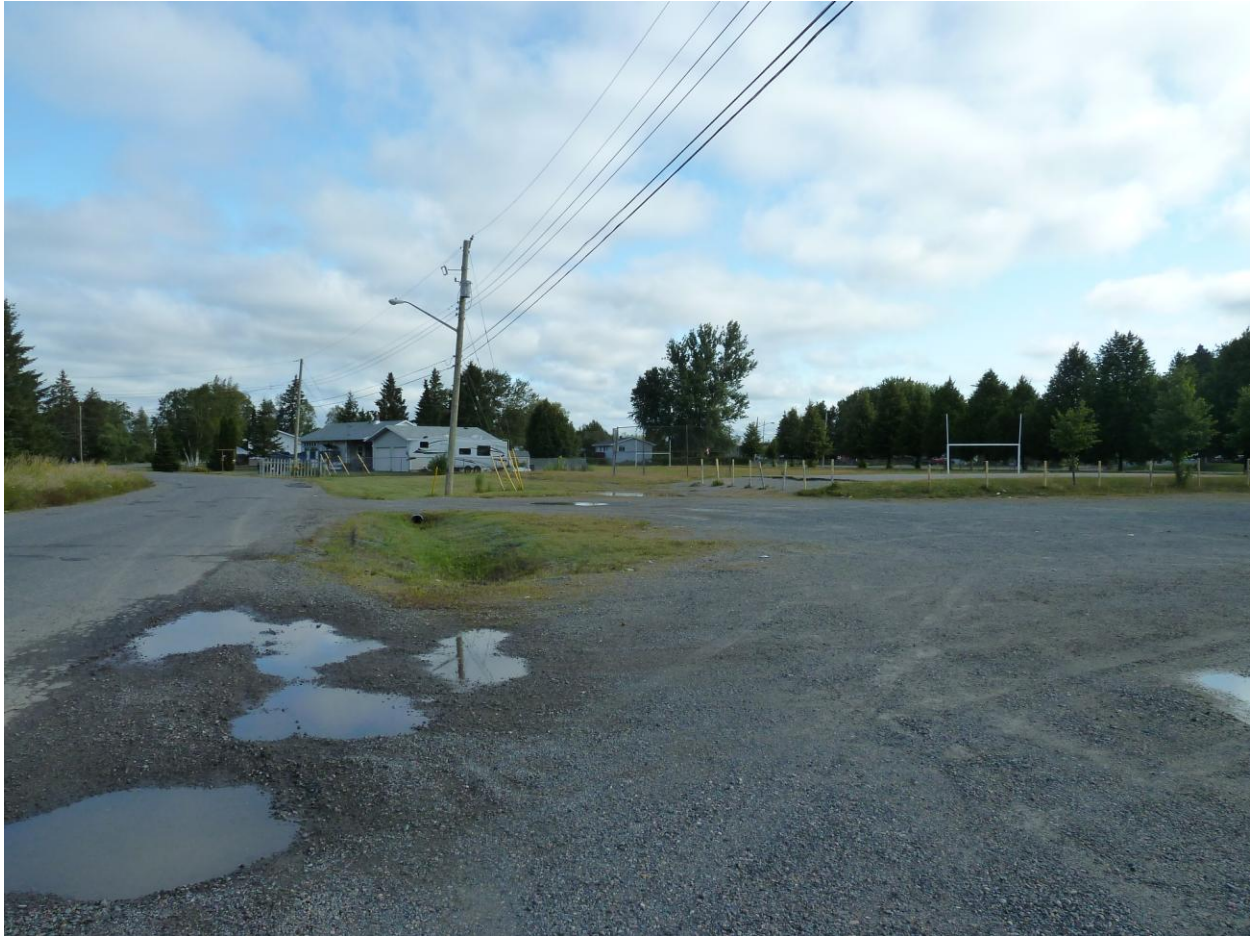
Photo 3: 1650 Dominion Drive, Val Therese View of northwesterly corner side yard and parking area off Larocque Avenue File 751-7/19-6 Photography August 22, 2019