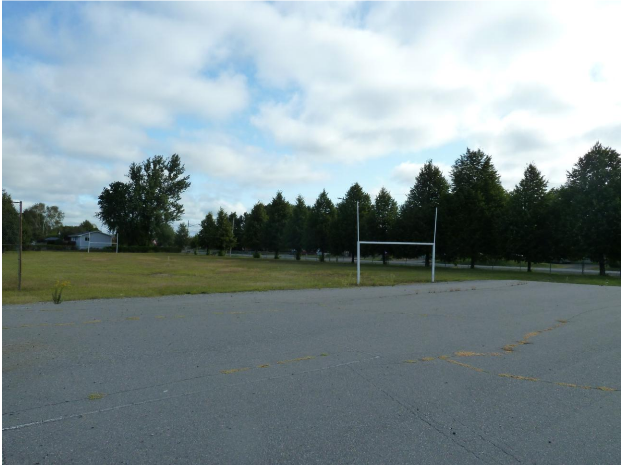
Photo 4: 1650 Dominion Drive, Val Therese View of school yard on northerly portion of property File 751-7/19-6 Photography August 22, 2019