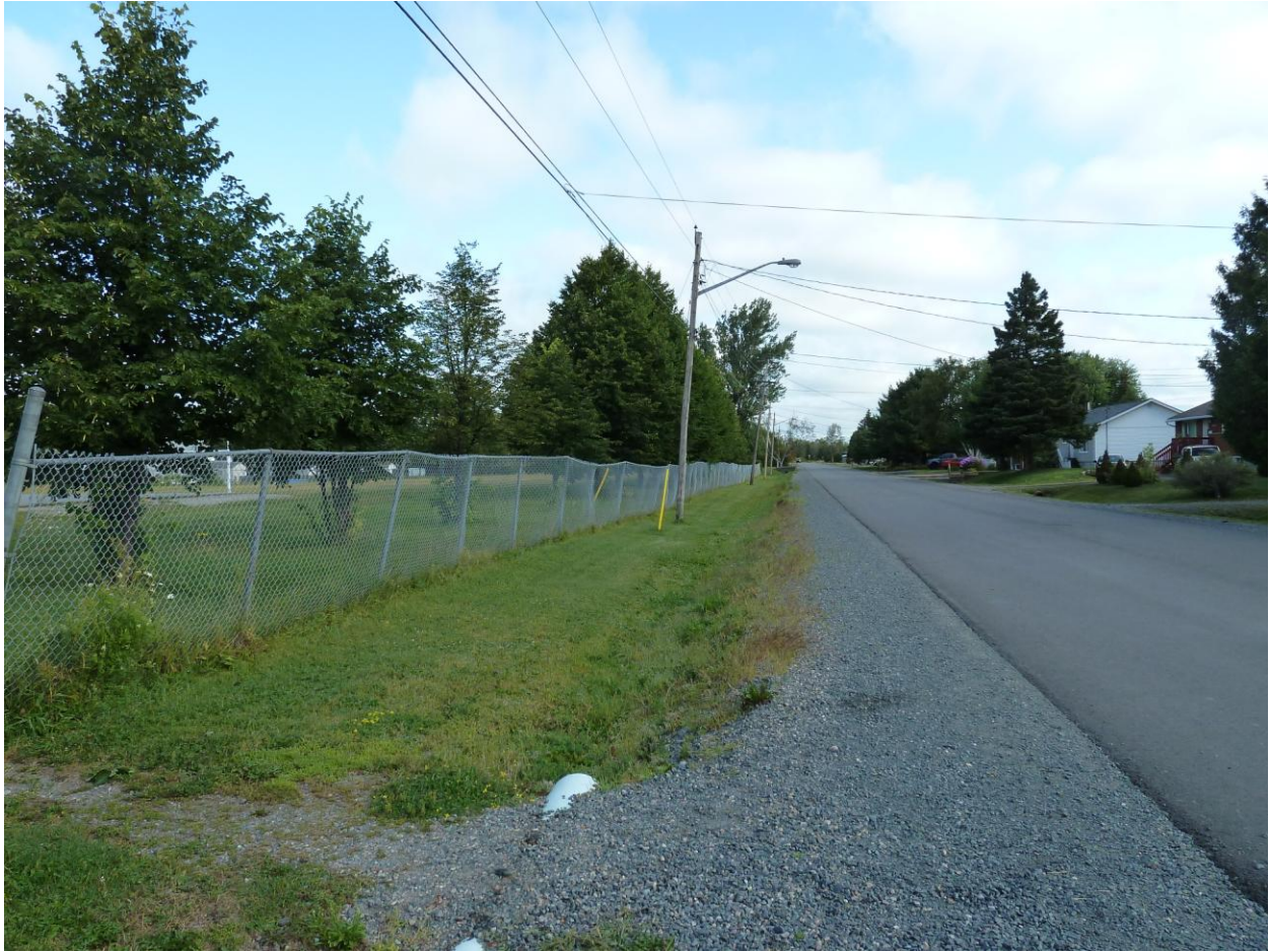
Photo 9: 1650 Dominion Drive, Val Therese View of street line along west side of Lillian Street File 751-7/19-6 Photography August 22, 2019