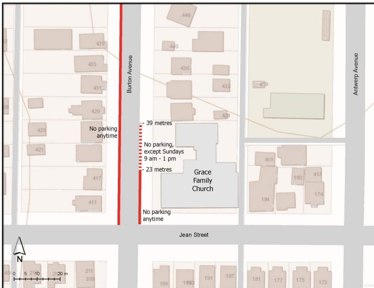
Figure 3 – Recommended Parking Restrictions

Staff therefore recommends revising the parking restriction to allow parking in the above mentioned location on Sundays between 9 a.m. and 1 p.m. to coincide with church services. Figure 3 below shows an overview of the recommended parking restrictions.