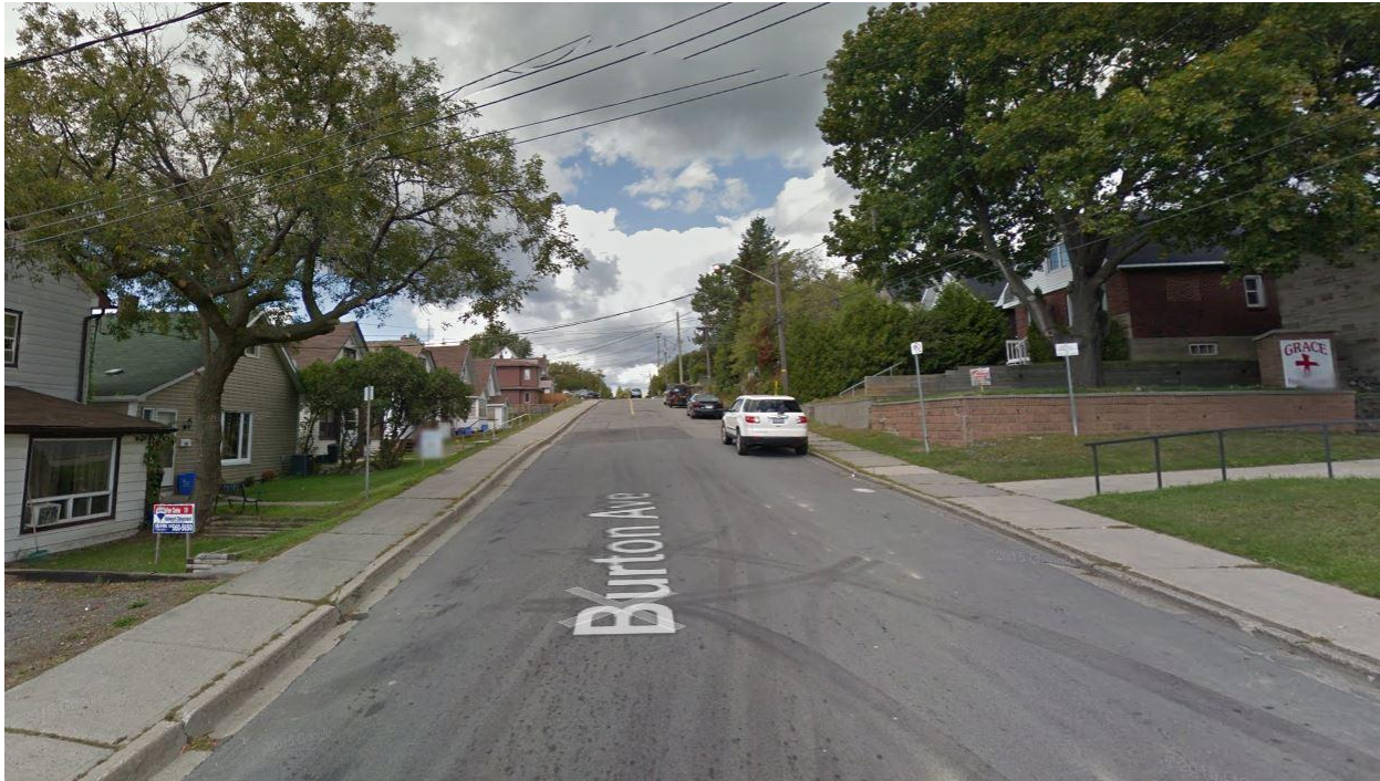
Figure 2 – Burton Avenue Street View

The primary function of a public road is for the safe and efficient movement of traffic. On-street parking may be considered when this criteria is met.