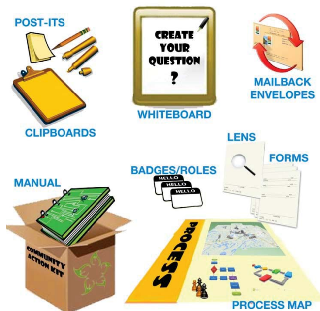
Figure 3 : The Community HIVE Action Kit Concept

The Action Kit is designed to be accessible, interactive and fun. Once you have your kit, you will have everything you need to develop your project.