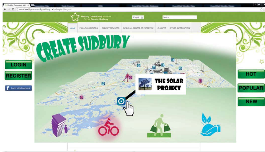
Figure 1 : Create Greater Sudbury Front Page Concept

The first thing you will see at the online hive is everything that's going on with Create Greater Sudbury through an interactive front page.