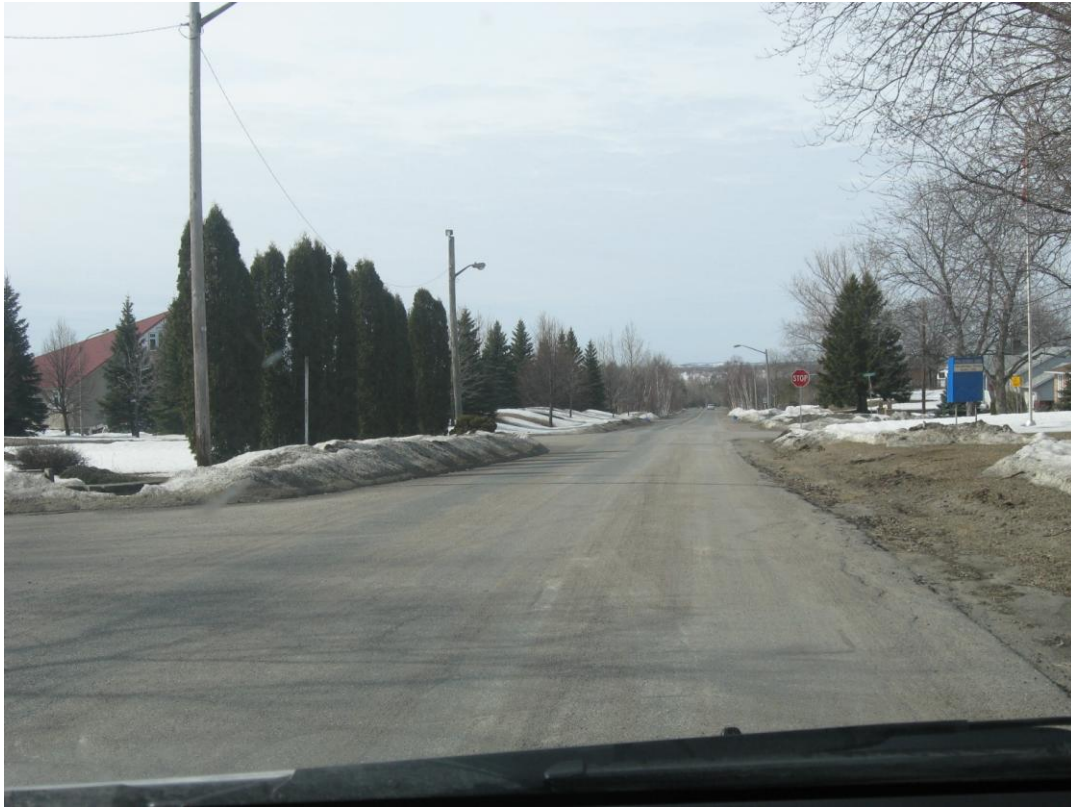
Photo 1 – Looking southwest towards Edison Road and Lindsley Street intersection. Tall cedar trees on southeast side of Edison Road.