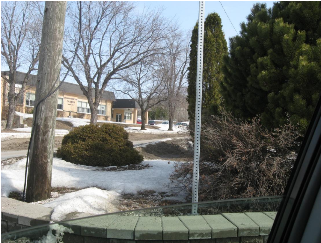
Photo 2 – Looking northeast from Lindsley Street while stopped at existing Stop sign.