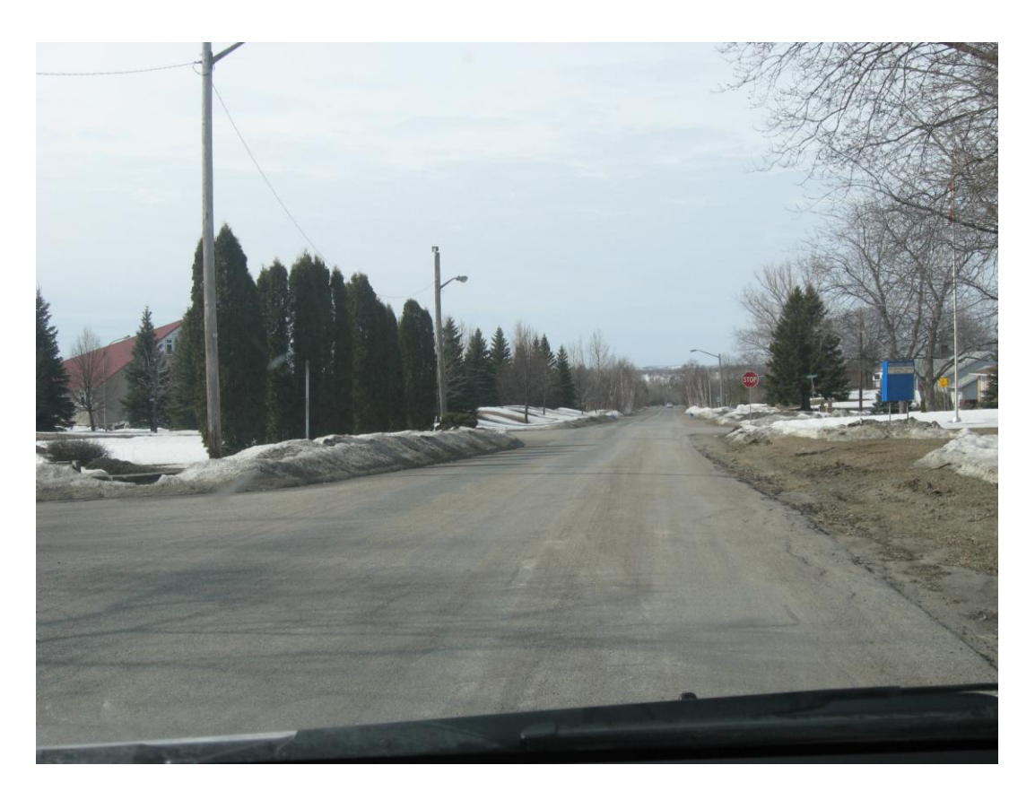
Photo 1 – Looking southwest towards Edison Road and Lindsley Street intersection. Tall cedar trees on southeast side of Edison Road.