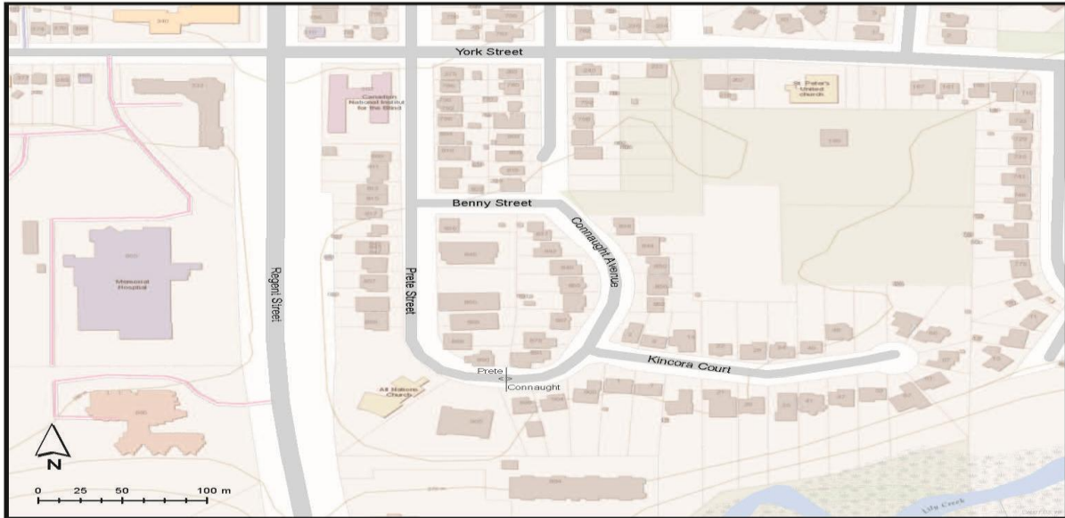
Figure 1 – Prete Street Overview

Transportation and Innovation Services staff received a request from an area resident to restrict on street parking on Prete Street in the area of the large hill south of York Street. Prete Street and Connaught Avenue are paved residential roadways with an operating width of approximately 9 metres, curb and gutter, no sidewalks and a posted speed limit of 50 km/h (Figure 1 & 2). Parking is currently permitted on both sides of the roadway.