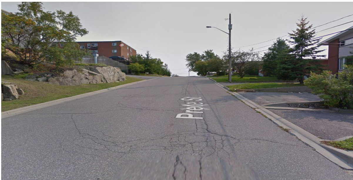
Figure 2 – Prete Street Street View