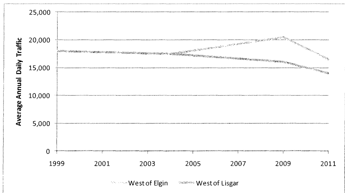
Exhibit 1: Historic AADT Levels

It is reasonable to expect that traffic levels have stabilized and that the most recent counts from 2011 are representative of near term future conditions.