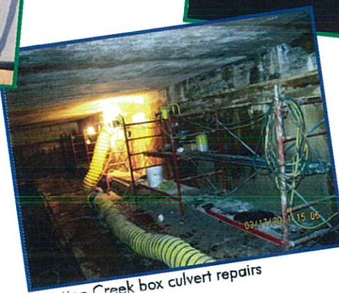
Junction Creek box culvert repairs