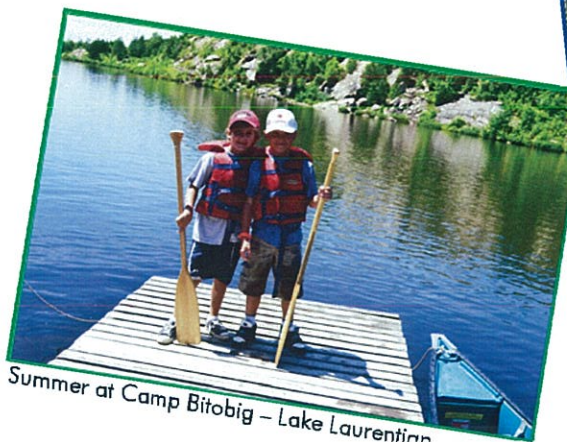
Summer at Camp Bitobig – Lake Laurentian