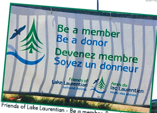
Friends of Lake Laurentian - Be a member, Be a donor