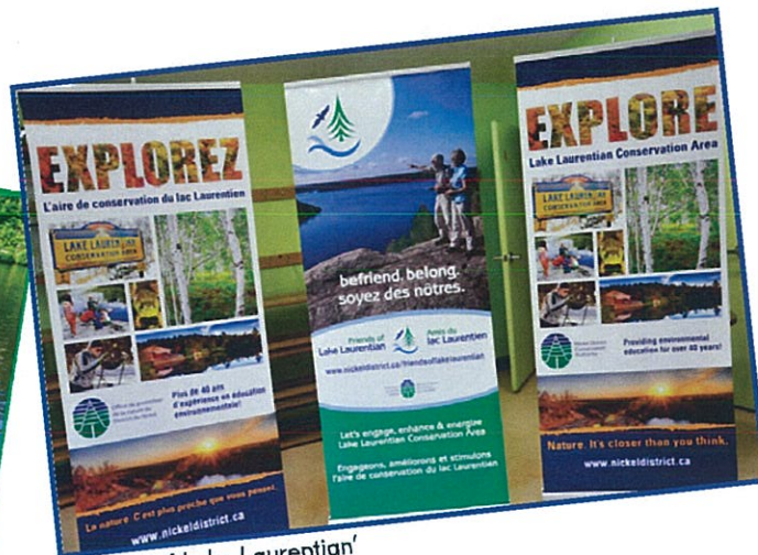
'Friends of Lake Laurentian'