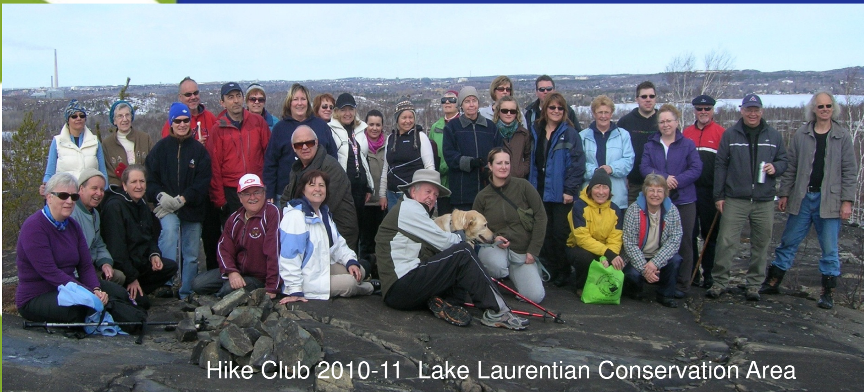
Hike Club 2010-11 Lake Laurentian Conservation Area