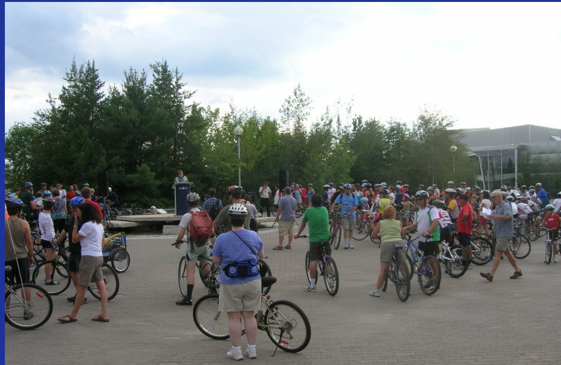
Share the Road Ride 2010