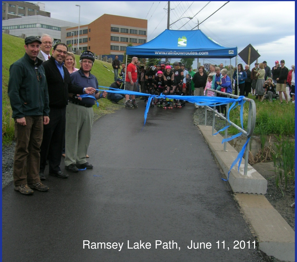
Ramsey Lake Path, June 11, 2011