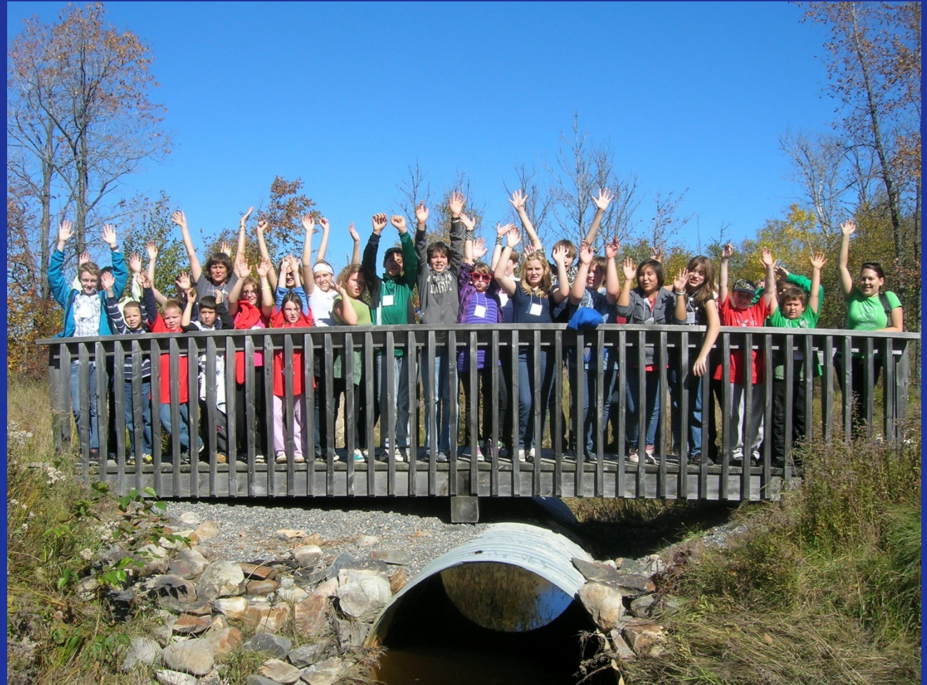
Roots and Shoots 2010, Kelly Lake Trail