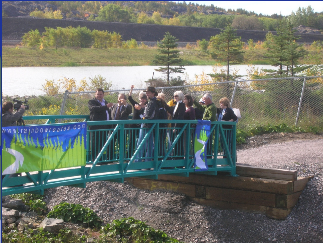
Copper Cliff Path Opening 2010