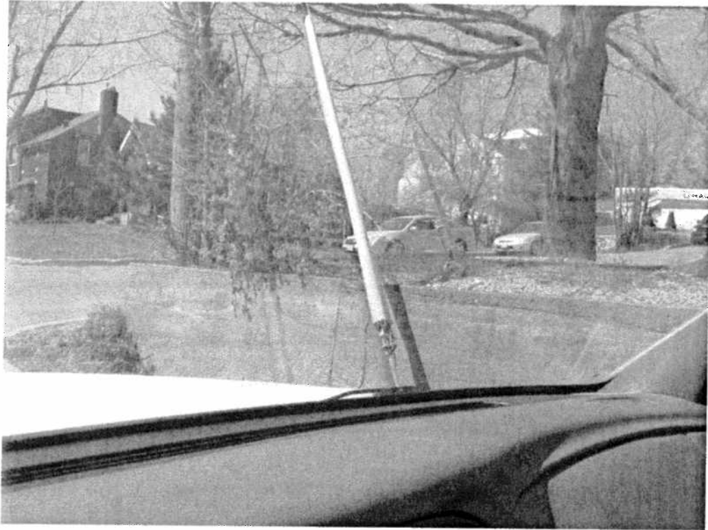
Northeast corner of the intersection