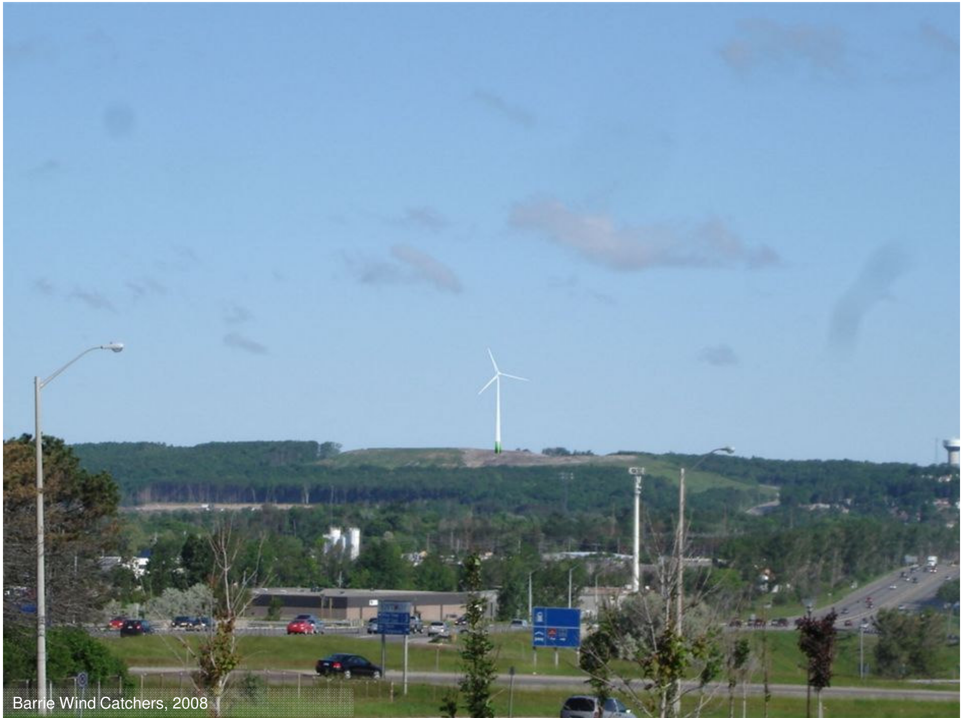
Barrie Wind Catchers, 2008