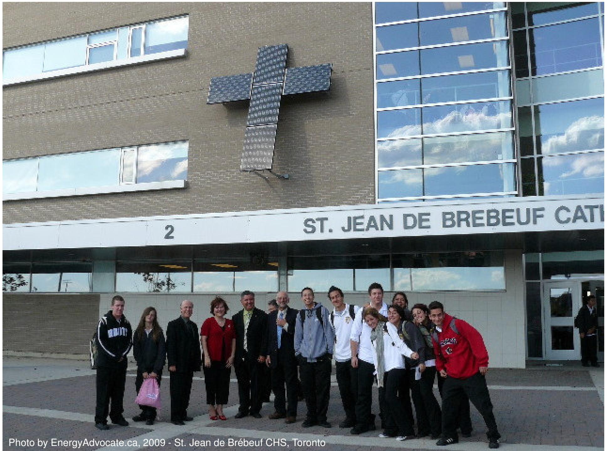
St. Jean de Brébeuf CHS, Toronto