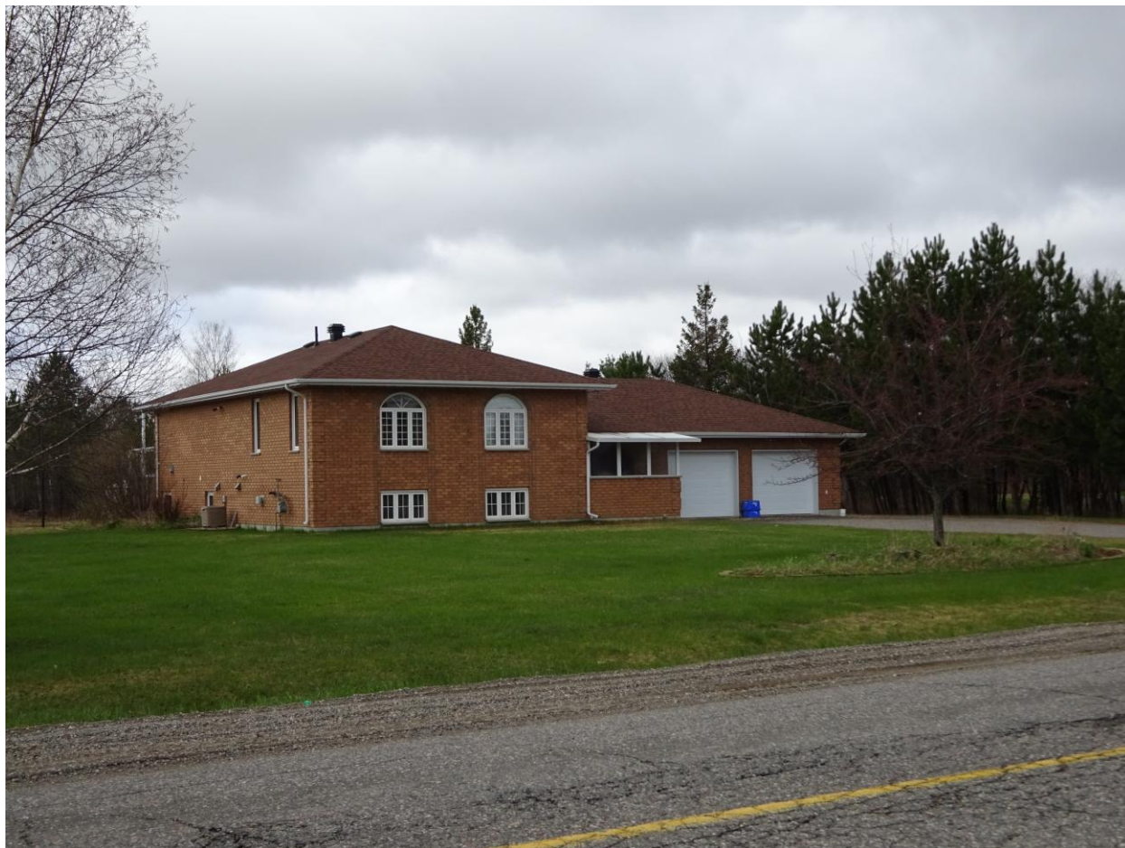
Photo 1: 327 Gravel Drive, Hanmer View of host dwelling File 751-7/19-3 Photography May 17, 2019