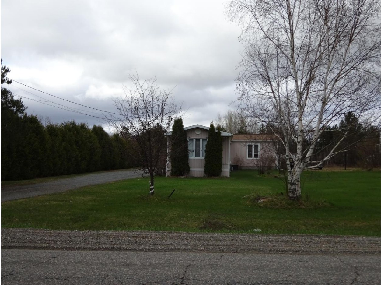
Photo 2: 327 Gravel Drive, Hanmer View of accessory garden suite abutting easterly File 751-7/19-3 Photography May 17, 2019