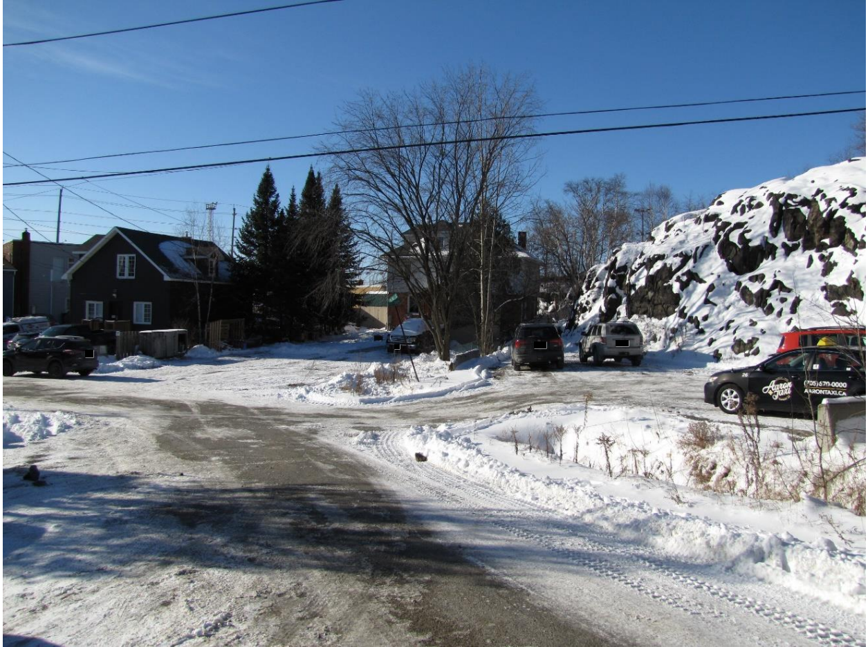
Photo 2: 0 Nelson Street on the right, and the adjacent residential dwelling to the south at 305-307 Nelson and 311 Nelson (also owned by the applicant), looking southwest. Photo taken December 16, 2020, File #751-6/20-2.