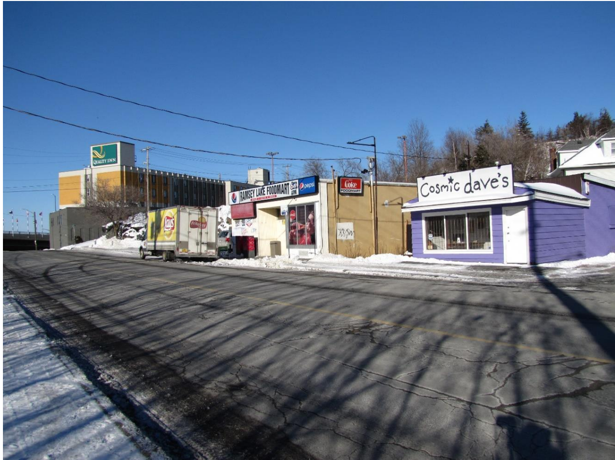
Photo 10: Retail and hotel uses to the west of the subject lands, looking northwest. Photo taken December 16, 2020, File #751-6/20-2.