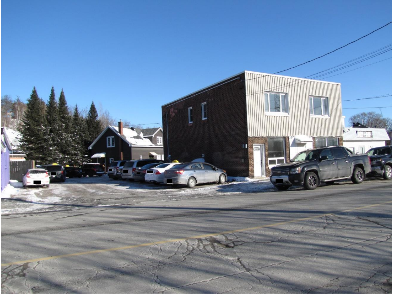
Photo 9: Portion of subject lands known as 422-426 Elgin Street, as well as adjacent lands at 420 Elgin which would appear to be used for parking for the taxi stand, with residential structure at 311 Nelson beyond. Photo taken December 16, 2020, File #751-6/20-2.