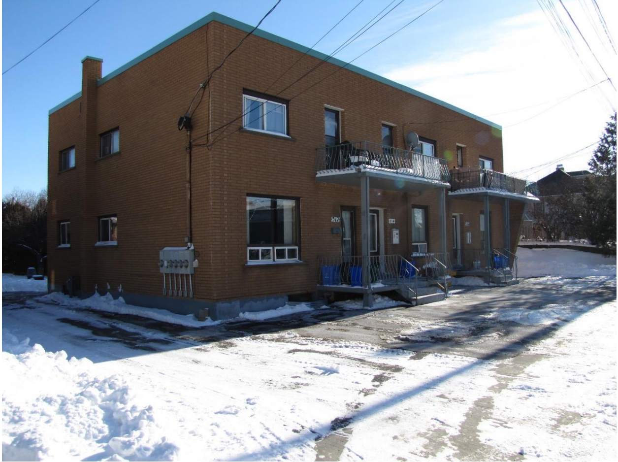
Photo 6: Multiple dwelling at 312-316 Nelson Street, facing southeast. Photo taken December 16, 2020, File #751-6/20-2.