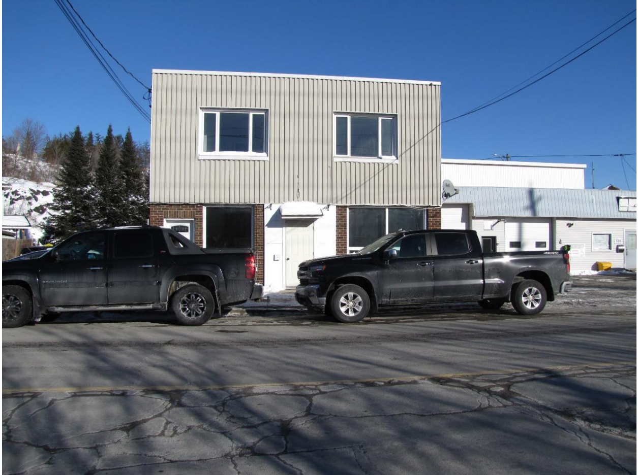
Photo 8: Portion of subject lands known as 422-426 Elgin Street, showing existing 3 unit multiple dwelling, facing northeast. Photo taken December 16, 2020, File #751-6/20-2.