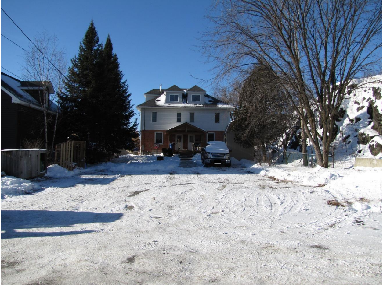
Photo 3: Residential dwelling south of 0 Nelson Street at 305-307 Nelson, looking west. Photo taken December 16, 2020, File #751-6/20-2.