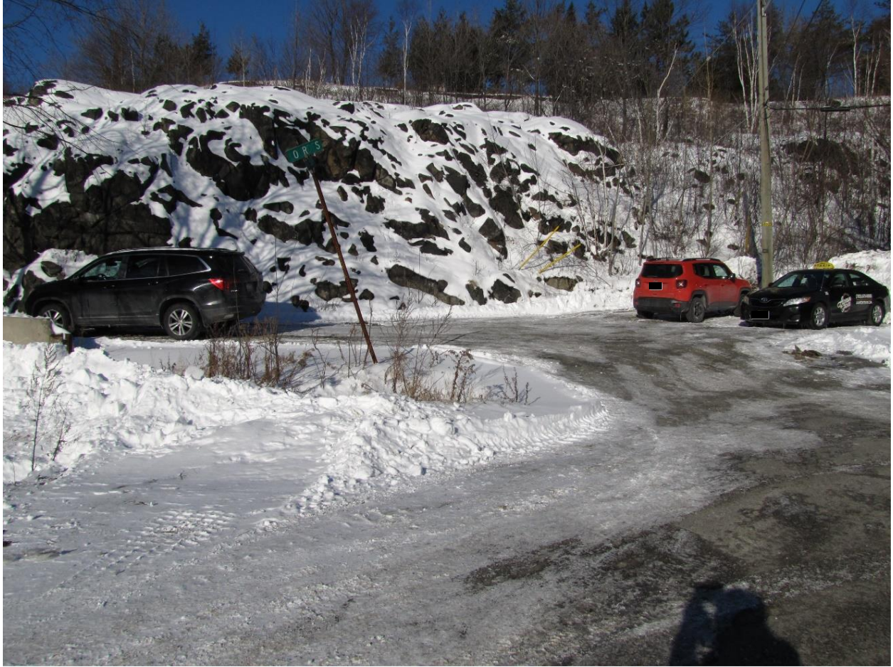
Photo 1: Portion of subject lands known as 0 Nelson Street from street, looking north. Photo taken December 16, 2020, File #751-6/20-2.