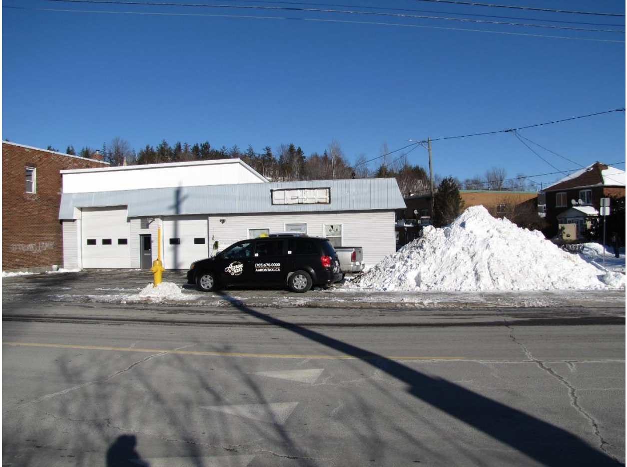
Photo 7: Existing taxi stand at 434 Elgin Street, looking north. Photo taken December 16, 2020, File #751-6/20-2.