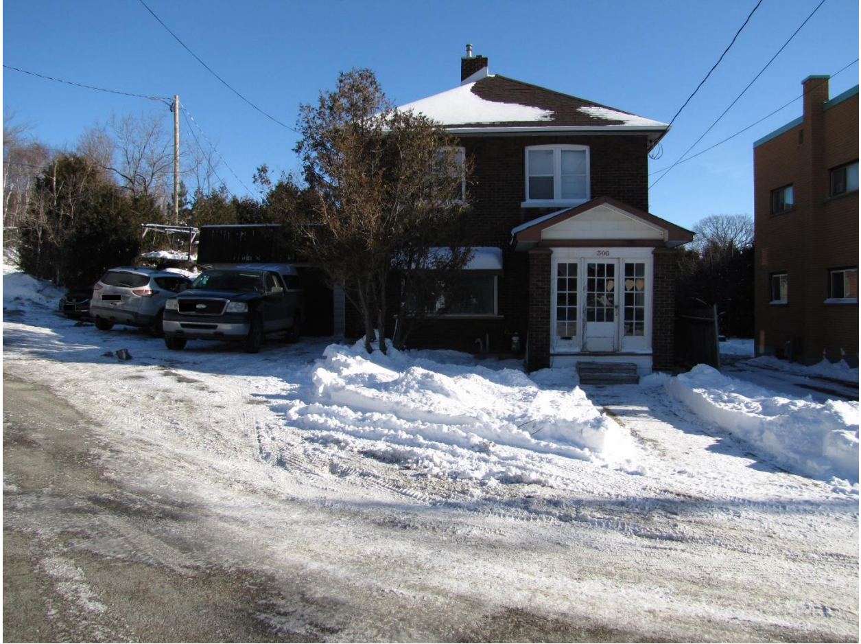
Photo 5: Residential dwelling opposite 0 Nelson Street, looking east. Photo taken December 16, 2020, File #751-6/20-2.