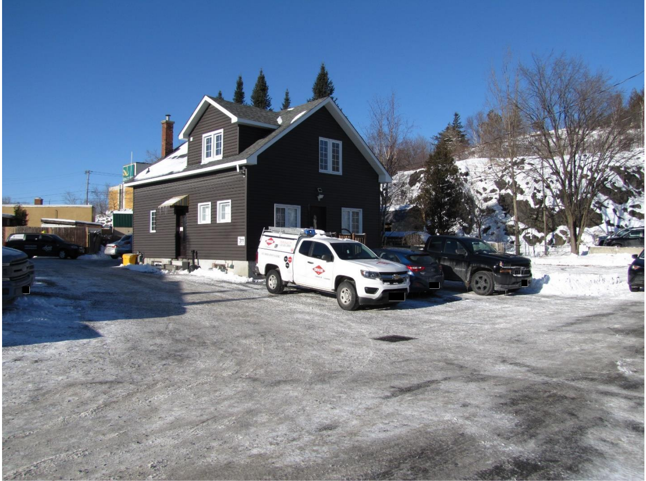
Photo 4: Residential use at 311 Nelson, looking northwest. Photo taken December 16, 2020, File #751-6/20-2.