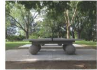
Outdoor Ping Pong Table (Riverdale Park East, Toronto)

Every park should include the opportunity for active physical enjoyment. As such, Alder Park will include two outdoor ping pong tables. Ping pong, or table tennis, is an accessible sport that has been included in the Olympics and Paralympics since 1988 and 1960, respectively. It's a fun and engaging sport which can be played by individuals from 8 to 80 years of age.