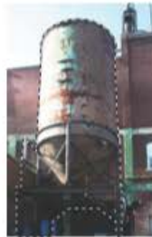
Existing Brewery Tank

At the centre of the vehicular entry loop, there will be a water feature incorporating the existing large brewing tank from the former brewery. The tank will be retrofitted so water gushes out the bottom into a holding reservoir with a metal grate covering it. In addition to holding water, the reservoir will be planted with resilient water plants which will peak through the grate creating the illusion that the water feature is built on a vegetated green mat.