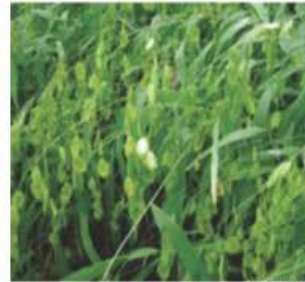
Northern Sea Oats

At the centre of the vehicular entry loop, there will be a water feature incorporating the existing large brewing tank from the former brewery. The tank will be retrofitted so water gushes out the bottom into a holding reservoir with a metal grate covering it. In addition to holding water, the reservoir will be planted with resilient water plants which will peak through the grate creating the illusion that the water feature is built on a vegetated green mat.