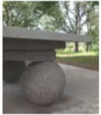
Outdoor Ping Pong Table Detail

Considering the unique urban context of the park is important when designing the internal form system. Urban parks tend to be very connected to their surroundings. In this instance, two streets front the park, as well as a laneway and multiple buildings. Access to the main ingress and egress points must be easily accessible, but still, the circulation within the site should maintain an experience that is interesting and playful. Indirectly-direct routes take users from one end of the park to the other, and lead from the building to the laneway. Instead of being a straight path, routes are slightly biased, or include visual screening and may incorporate 'obstacles' such as seating, planting beds, or programmed areas to entice the user to slow down and enjoy the space.