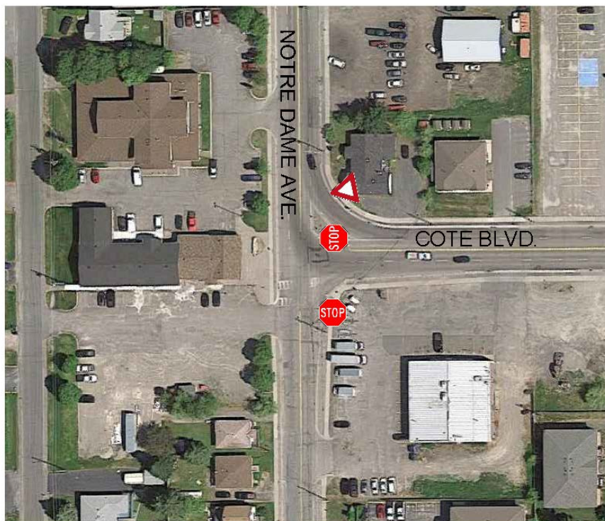
Figure 2 – Notre Dame Avenue and Cote Boulevard – Existing Intersection Control