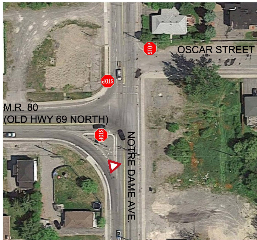
Figure 1 – M.R. 80 and Notre Dame Avenue – Existing Intersection Control