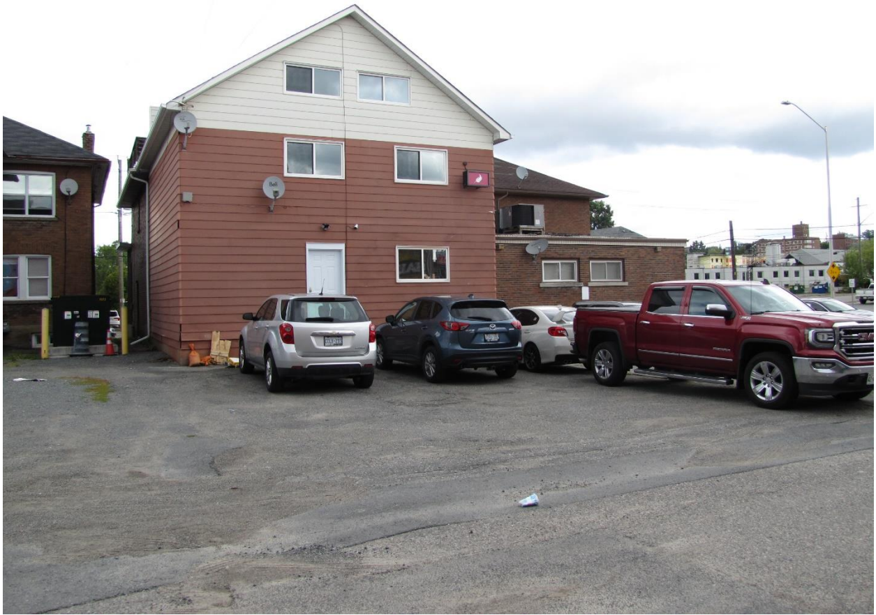
Photo #2. Subject lands showing the rear of the existing building and parking area off Vanier Lane, looking north. Photo taken August 21, 2020.