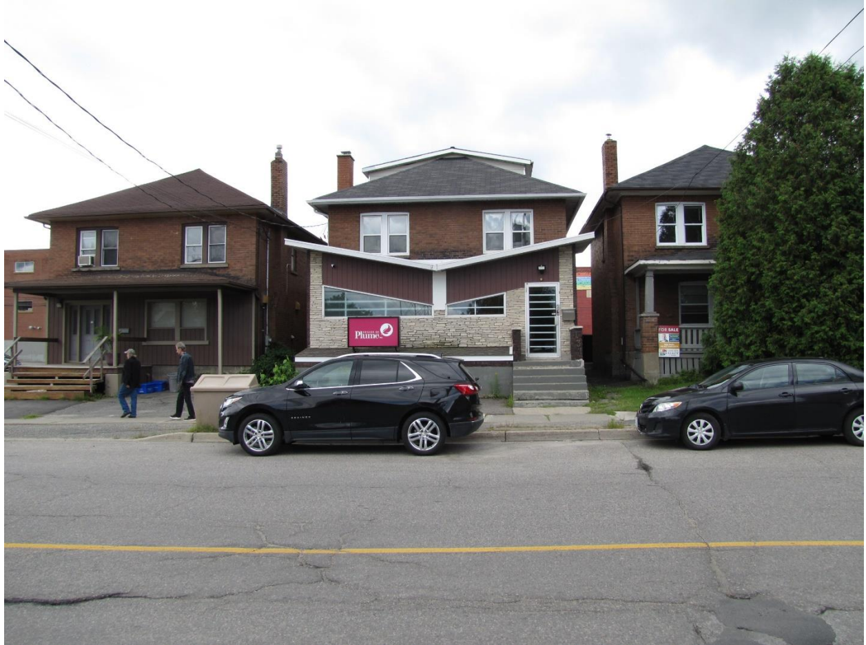
Photo #1. Subject lands showing the existing building, and residential dwellings to the west and east of the subject lands, looking south. Photo taken August 21, 2020.