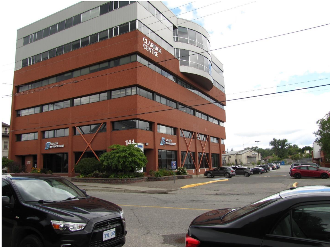
Photo #3. Commercial office to the north of the subject lands (Claridge Centre). Photo taken August 21, 2020.